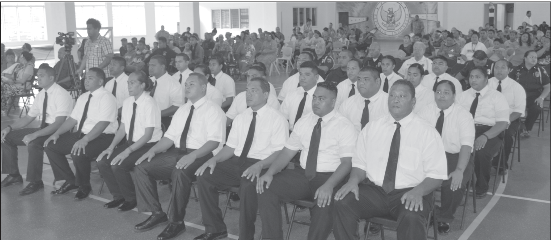
Se vaaiga i le vasega lona 26 o Leoleo fou a le Matagaluega o le Puipuiga o le Saogalemu Lautele, i le taimi o le sauniga o le latou fa’auuga i le vaiaso na te’a nei, lea na faia i le fale taalo a Tupulaga Talavou i Pago Pago i le aso Faraile na tea nei.