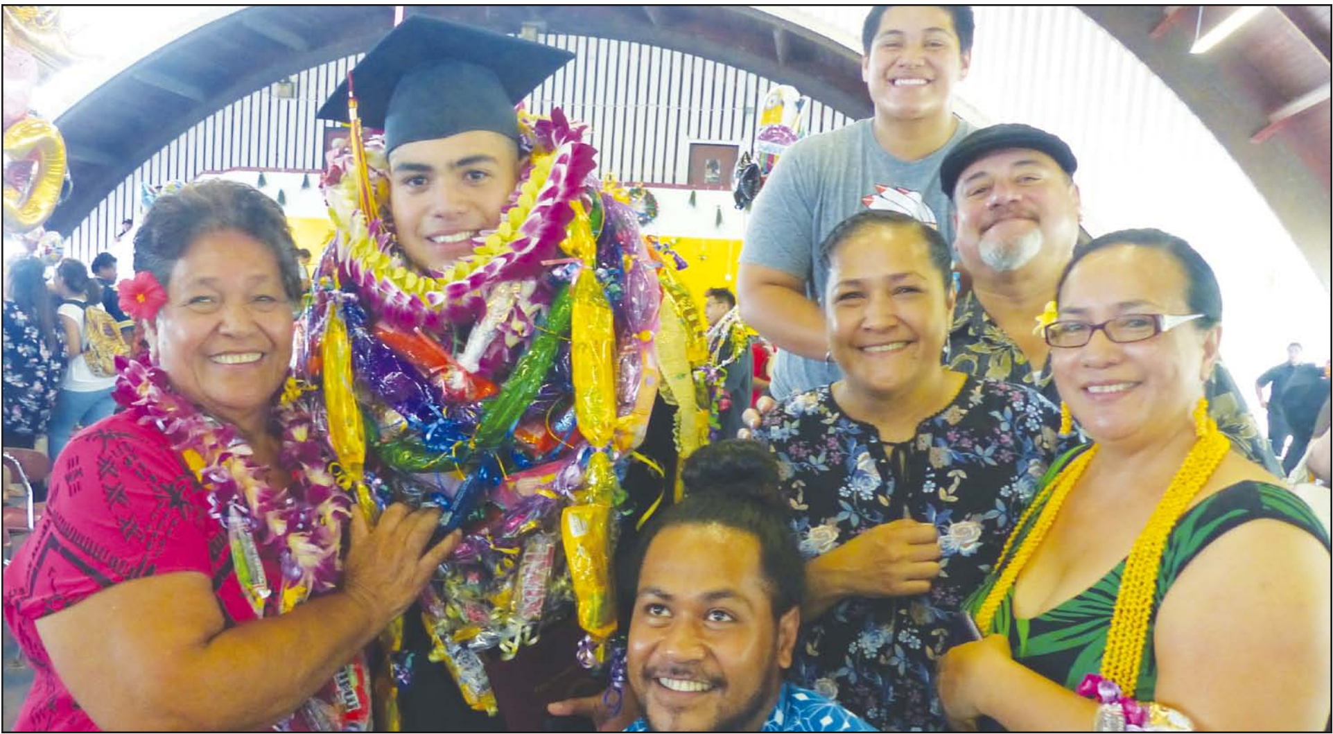
O le aiga fiafia aua ua fa'amae'aina lea la'asaga o tausailiga o le atamai e se tasi o atali'i, sa fa'au'u i le aso Faraile ua te'a, i le fa'au'uga lona 67 a le ASCC