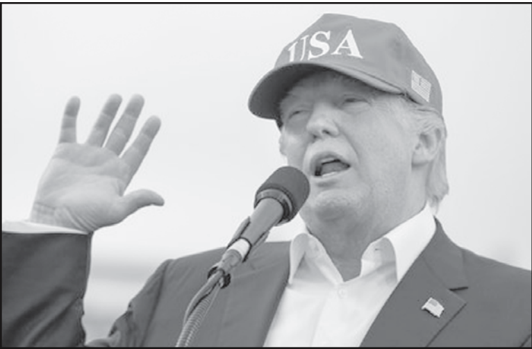
FILE - In this Saturday, Dec. 17, 2016 file photo, President-elect Donald Trump speaks during a rally at Ladd-Peebles Stadium in Mobile, Ala. On Saturday, Dec. 16, 2017, several people familiar with Trump's transition organization say special counsel Robert Mueller's team has gained access to thousands of private emails sent and received by Trump officials before the start of his administration.