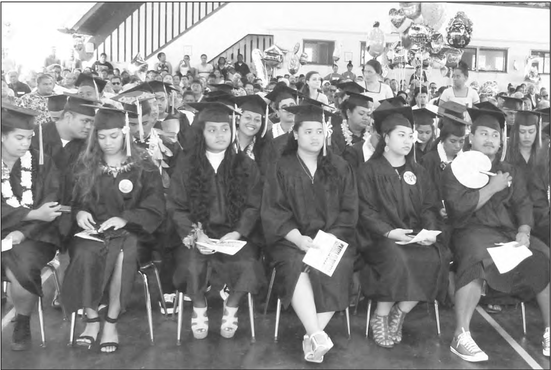
O le isi itu sa sasao ai nisi o le vasega fa'ai'uso mai le ASCC i le latou fa'au'uga i le aso Faraile na te'a nei.