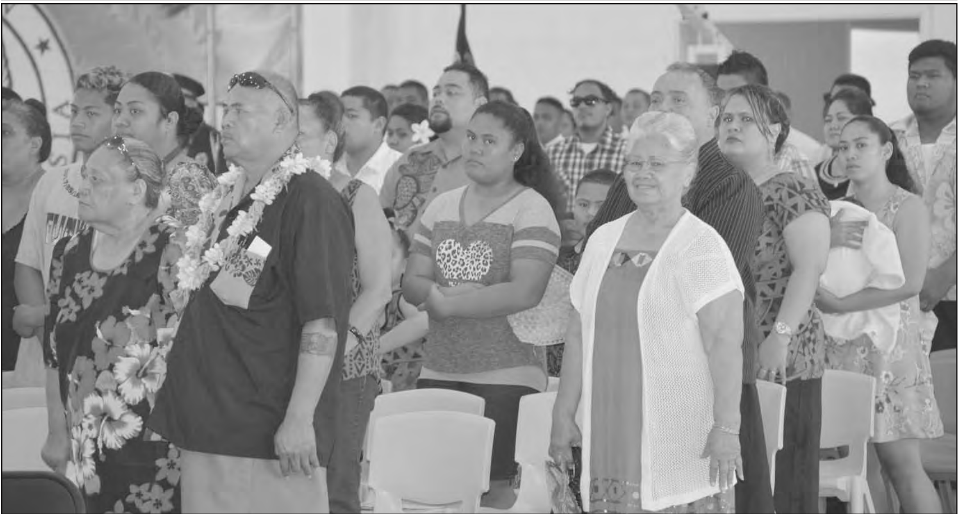
Matua, uo ma aiga o ali'i ma tama'ita'i leoleo sa fa'atautoina i le vaiaso na te'a nei, i le mae'a ai o aoaoga na auai i latou mo le umi e 10 vaiaso. O le fa'auuga o Leoleo sa fa'atautaia lea i le fale taalo a Tupulaga Talavou i Pago Pago. [ata AF]