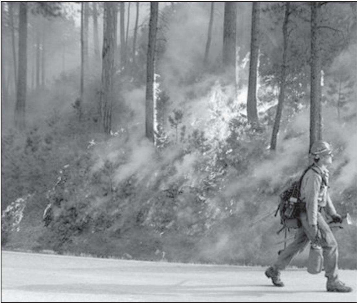
FILE - In this Dec. 12, 2017, file photo, a firefighter walks by flames of the burn out fire that was set set while battling a blaze in Custer State Park in South Dakota. Custer State Park officials said Saturday, Dec. 16, 2017, the wildfire is now about 90 percent contained.