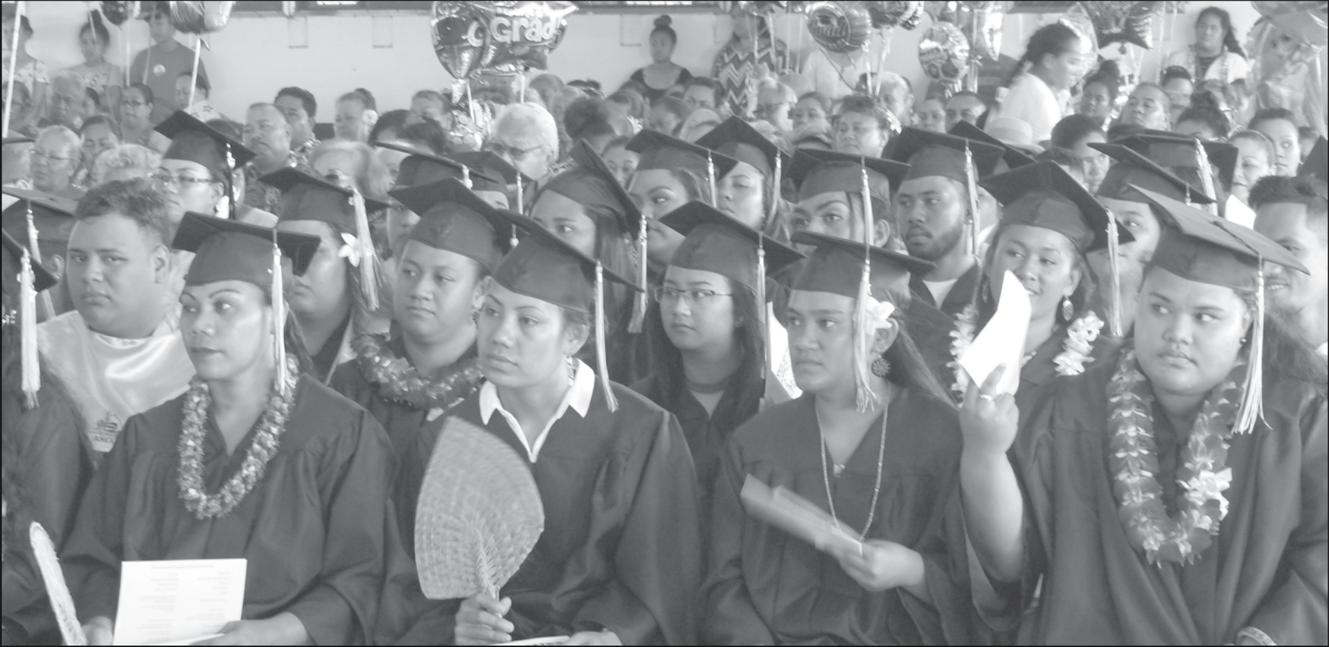
Nisi o le au fa’au’u a le Kolisi Tu’ufa’atasi a Amerika Samoa i le aso Faraile ua te’a.