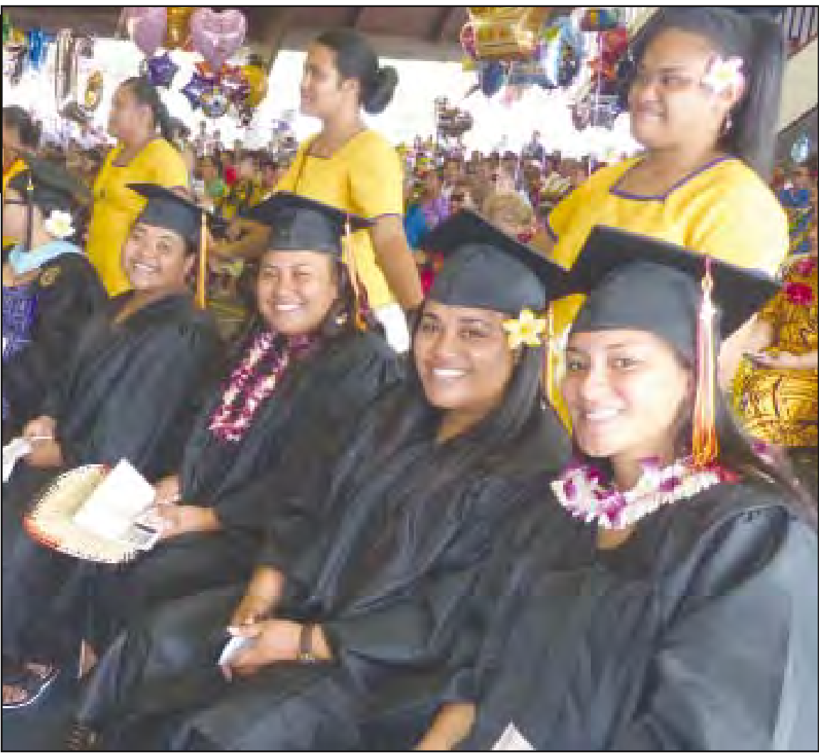
O le laina pito lava i tua o le au fa'au'u. a le Kolisi Tu'ufa'atasi a Amerika Samoa i le aso Faraile ua te'a.