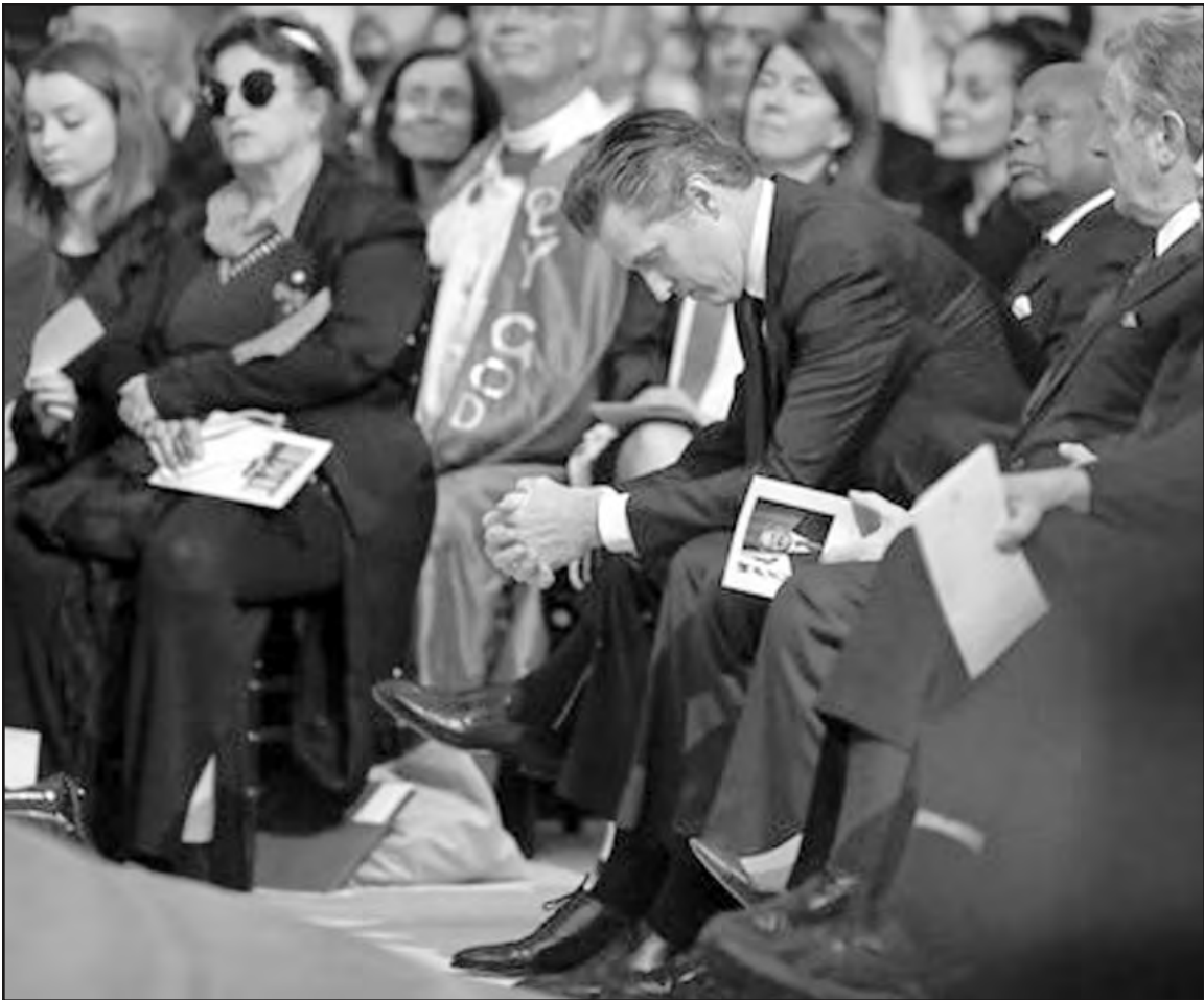
California Lt. Gov. Gavin Newsom, center, reacts during a service celebrating the life of Mayor Ed Lee at San Francisco City Hall in San Francisco, Sunday, Dec. 17, 2017. San Francisco Mayor Ed Lee was remembered for his humility, integrity and infectious smile during a public celebration of his life Sunday at City Hall attended by family members, former staff, politicians and residents.