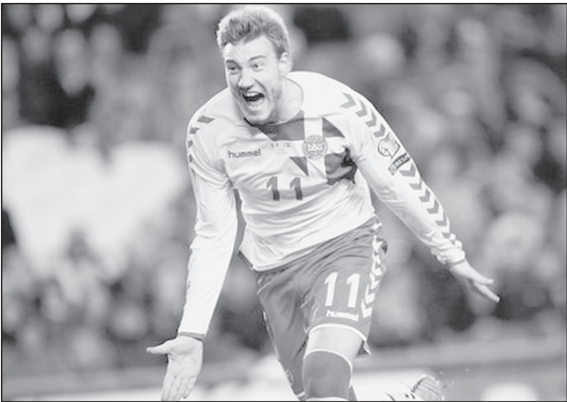
Denmark's Nicklas Bendtner celebrates after scoring his side's fifth goal during the World Cup qualifying play off second leg soccer match between Ireland and Denmark at the Aviva Stadium in Dublin, Ireland, Tuesday, Nov. 14, 2017.