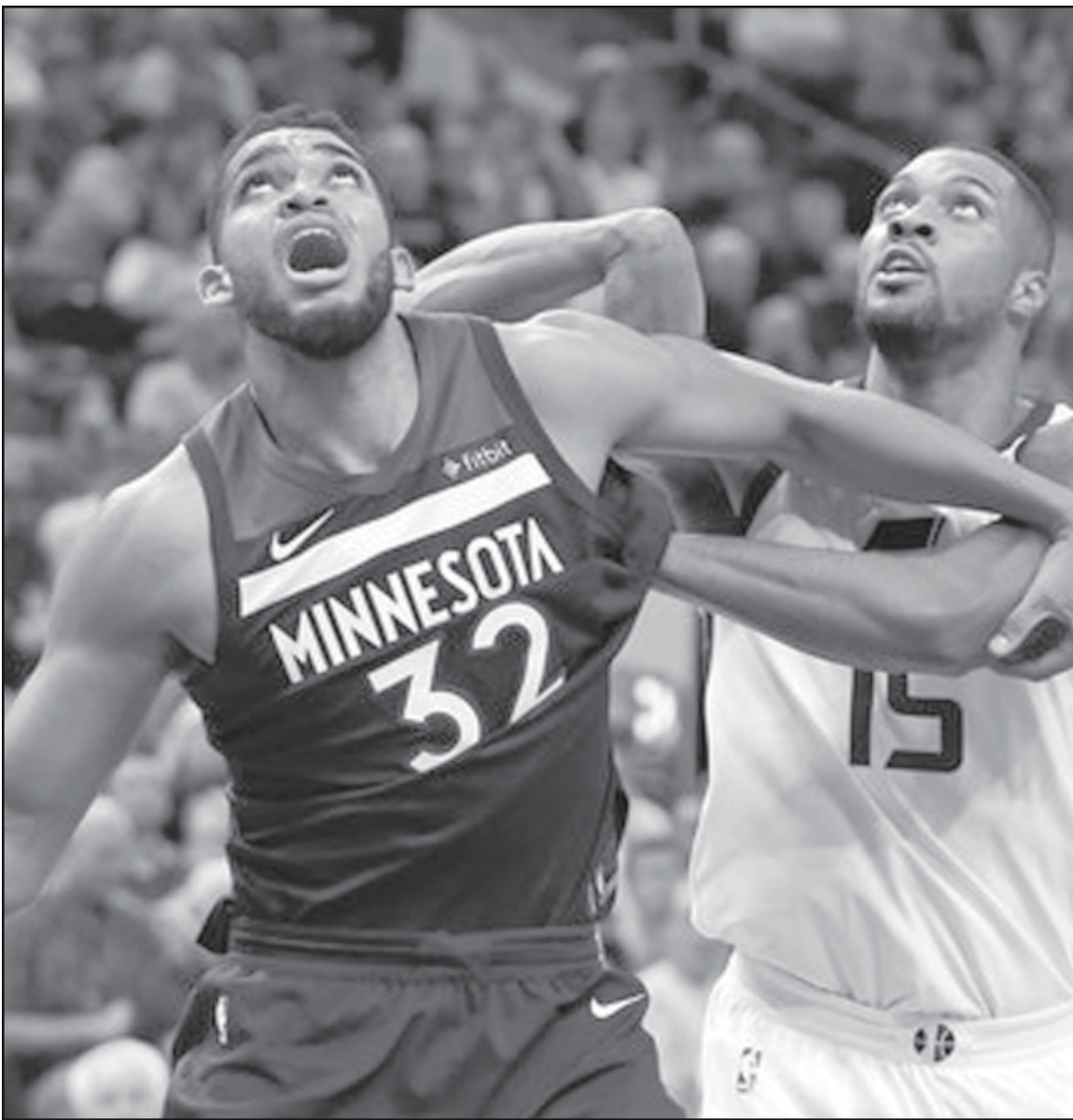
Minnesota Timberwolves center Karl-Anthony Towns (32) and Utah Jazz forward Derrick Favors (15) battle under the boards for a rebound in the second half during an NBA basketball game Monday, Nov. 13, 2017, in Salt Lake City.