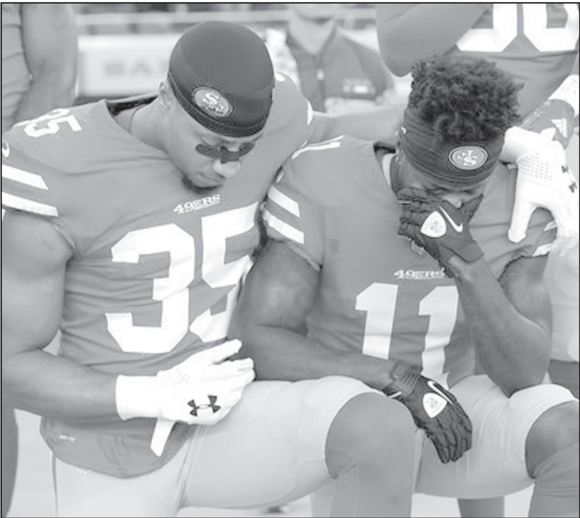
San Francisco 49ers safety Eric Reid (35) and wide receiver Marquise Goodwin (11) kneel during the performance of the national anthem before an NFL football game against the New York Giants in Santa Clara, Calif., Sunday, Nov. 12, 2017.

Goodwin left the locker room Sunday without speaking to reporters to be with his family, the team said, before the news later broke hours after the game.