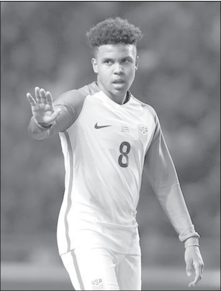
U.S. player Weston McKennie gestures during an international friendly soccer match between Portugal and U.S. at the Dr. Magalhaes Pessoa stadium in Leiria, Portugal, Tuesday Nov. 14, 2017.