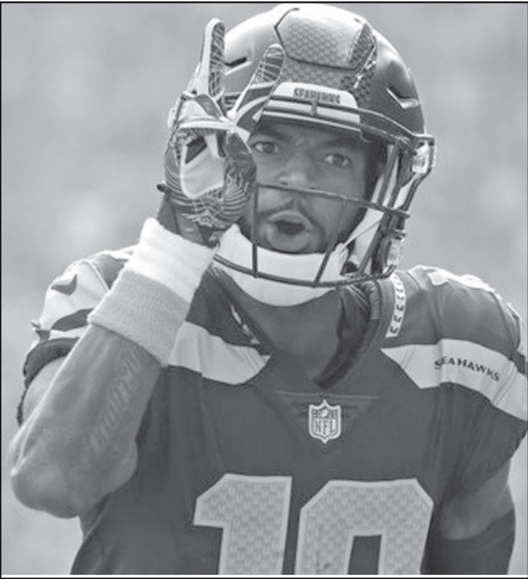
Seattle Seahawks wide receiver Paul Richardson celebrates in the first half of an NFL football game after score his second touchdown against the Houston Texans, Sunday, Oct. 29, 2017, in Seattle.