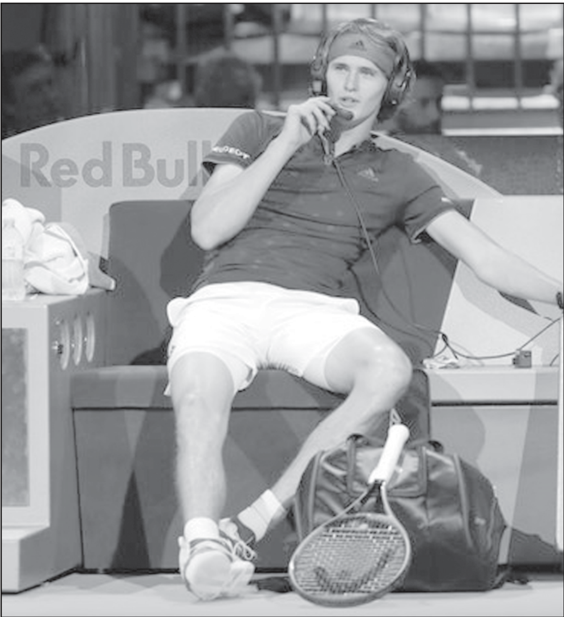
Alexander Zverev talks to his coach by headphones during a break of an exhibition match against Stefanos Tsitsipas at the ATP Next Gen tennis tournament finals, in Rho, near Milan, Italy, Tuesday, Nov. 7, 2017.