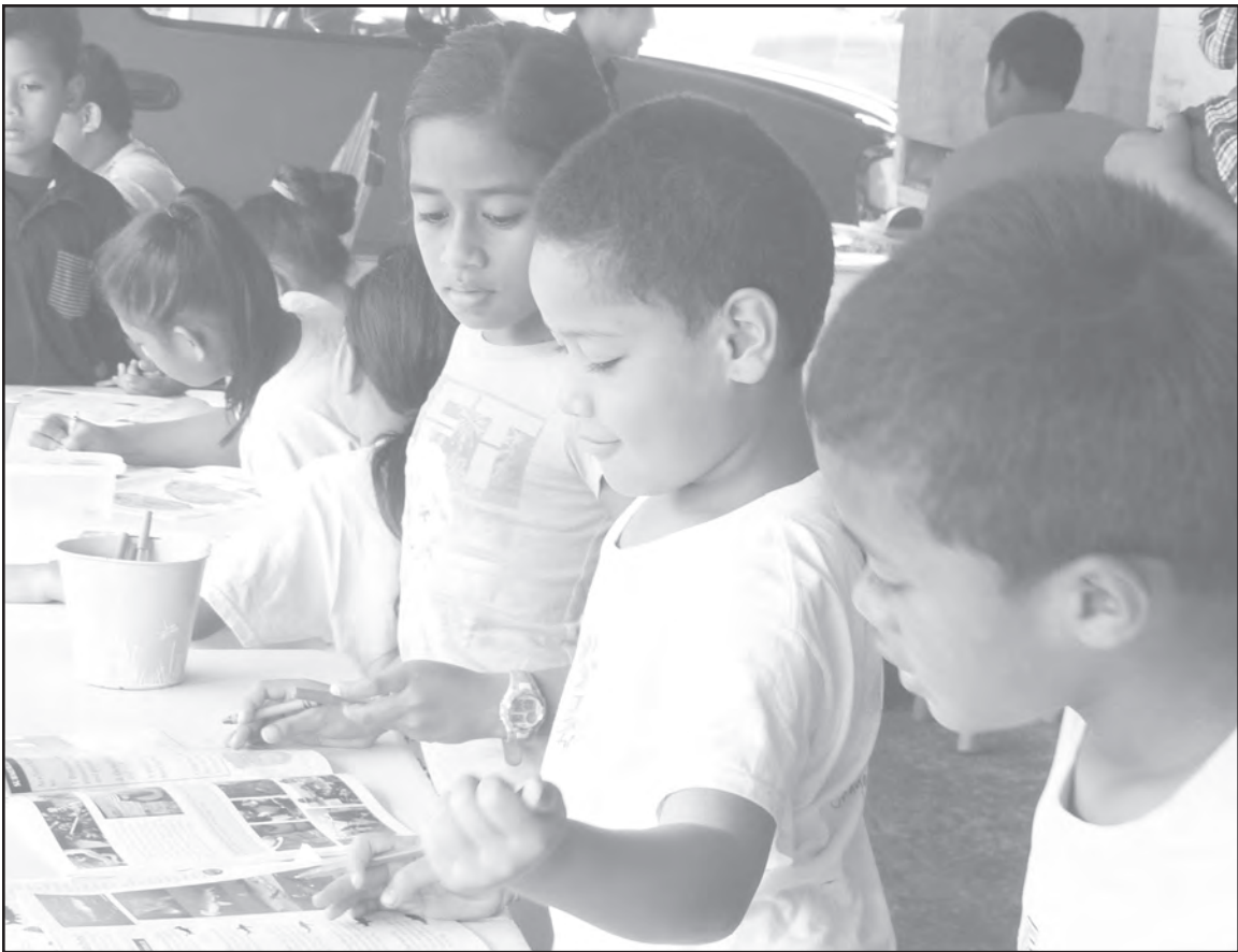
O se vā'aiga i le fanau e ta'i 5, 6, 7 tausaga le matutua o lo'o auai i le Vasega Faitau Tusi ma Valiata a le "E Fa'afaiile e Afioaga latou Fanau!" lea e fa'atautaia e le Auuso Aoelua /Fanene o Nu'uuli. O le fanau lava lenei o le vaifale i Nu'uuli ua aofia i lenei a'oga.