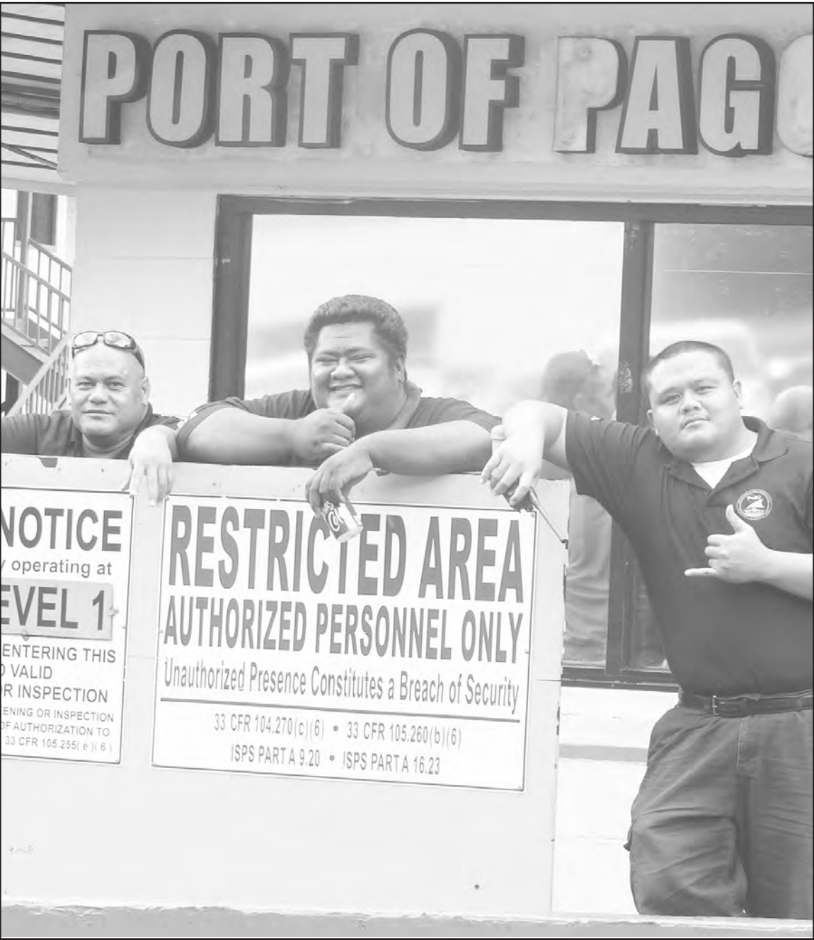
O se va’aiga i le toe vaiaso o nisi o le fanau o lo’o a’otauina ina ia iloa lelei ona fa’atino tiute o Leoleo o le Uafu. Tutula’i fo’i tama matutua e fa’aailoa ia i latou nei tiute. Malo le fai o le faiva o le leoleo.