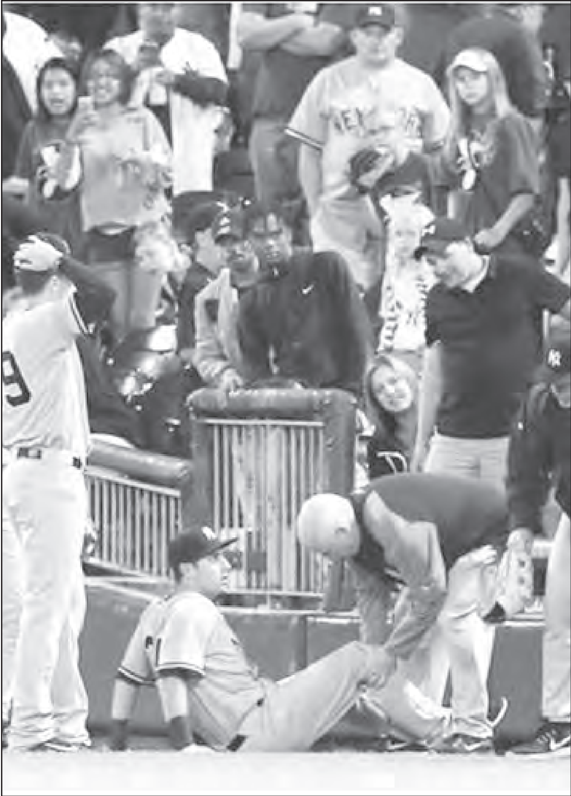
FILE - In this June 29, 2017, file photo, New York Yankees' Dustin Fowler is checked by a team trainer after an injury during the first inning of the team's baseball game against the Chicago White Sox in Chicago. The Oakland Athletics' likely center fielder of the future didn't know anybody Tuesday, a day after being traded by the Yankees in the deal that sent Sonny Gray to New York. As Gray's news conference in the Bronx showed on the A's clubhouse TV with his former teammates tuning in, Fowler discussed his own journey West.