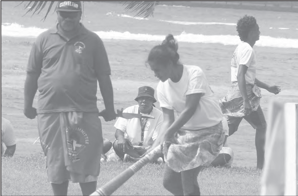
O se va'aiga i le lelei fo'i o le tauau o le tama'ita'i lea o le Tutotonu, ae na sapo'ia lana ta maualuga.