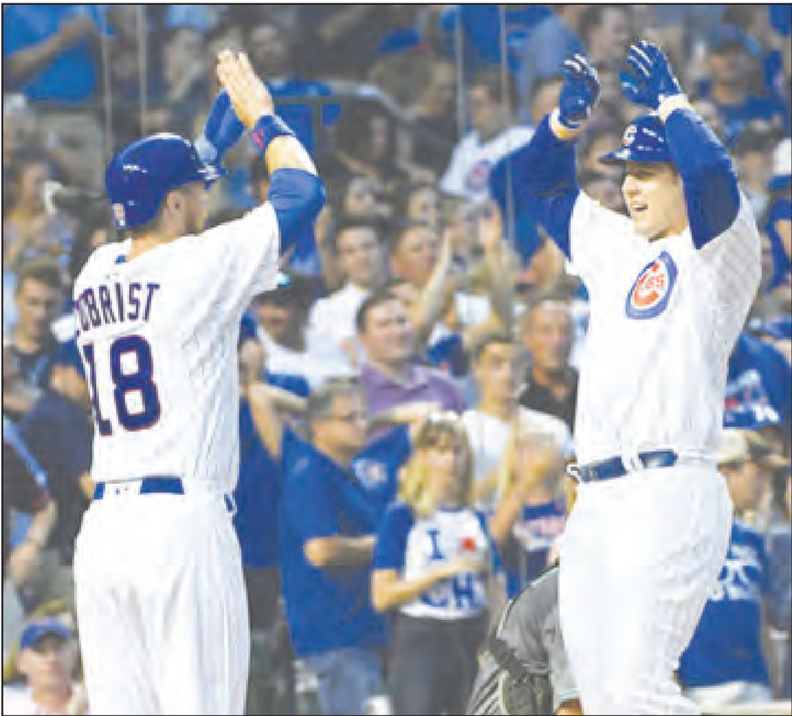
Chicago Cubs' Anthony Rizzo, right, high fives Ben Zobrist (18) after they score on his two-run home run during the second inning of a baseball game against the Arizona Diamondbacks on Tuesday, Aug. 1, 2017, in Chicago.