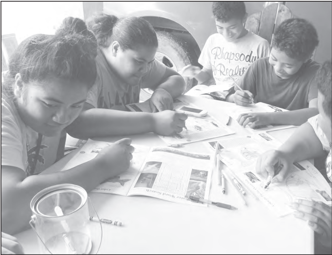
O se vā'aiga i le fiafia o nei fanau e valia a latou ata ia maea uma tusi vali ata sa fa'ao'o ane e i latou na asia le latou a'oga ma fa'amatala a latou tautua i le fanau, ina ia fausia se limana'i manuia mo i latou uma.