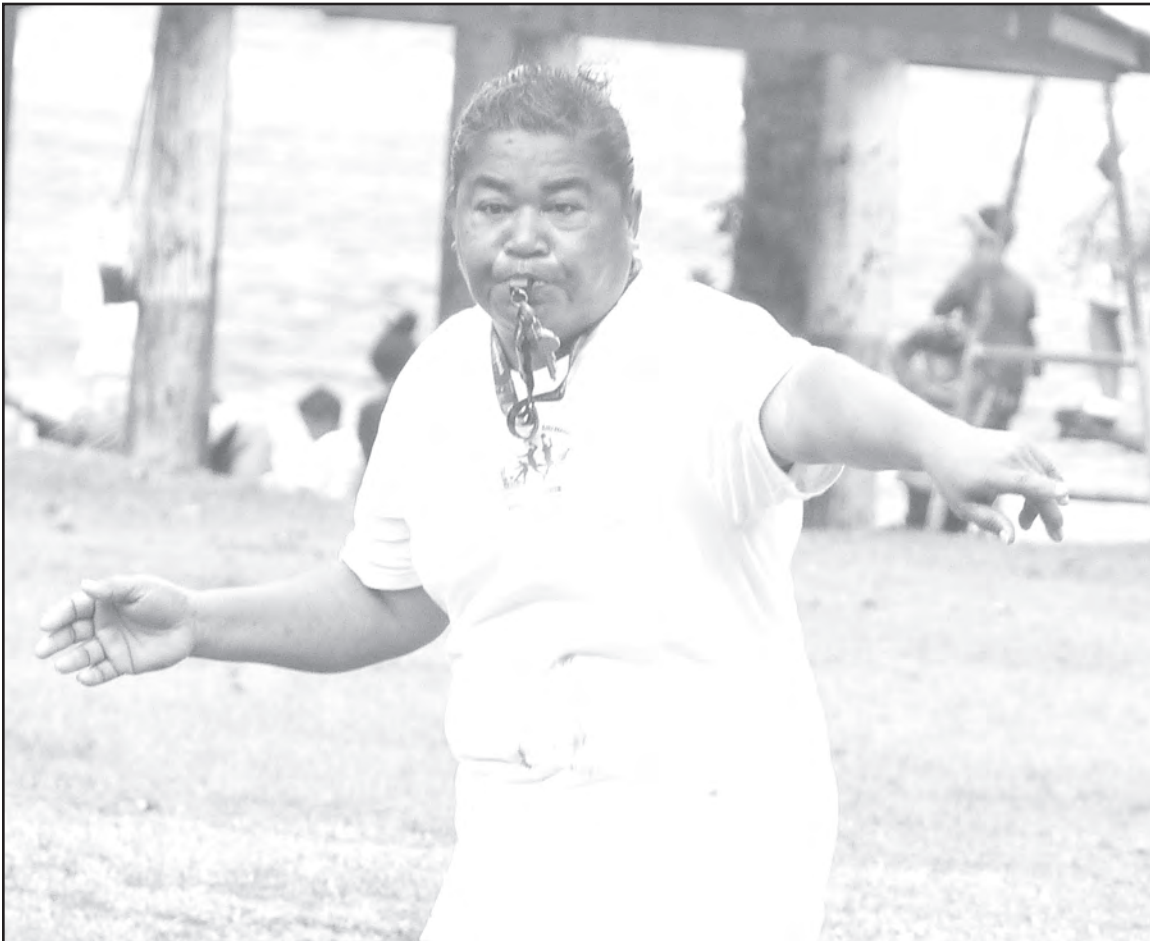
Ia o aga ia a le fa'aluma mo le fa'amalosi'au atu i le 'au te'a ma le talitua'a a le Sone Tutotonu. E le mapu lava le ili o le fa'a'ili latou.