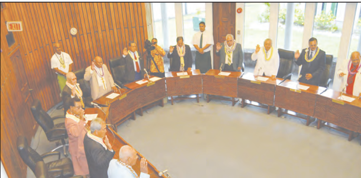
Le taimi na fa'atauto ai afioga i Senatoa o le tauaofiaga lona 35 o lo o nofoia i le taimi nei a le Fono Faitulafono.