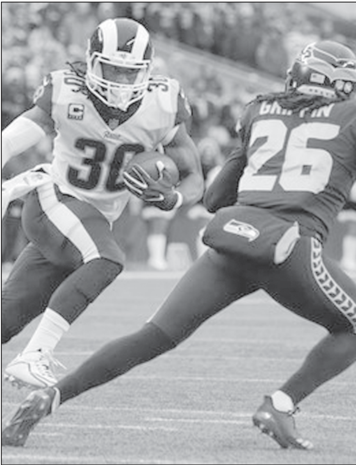
Los Angeles Rams running back Todd Gurley (30) rushes against Seattle Seahawks cornerback Shaquill Griffin (26) in the second half of an NFL football game, Sunday, Dec. 17, 2017, in Seattle. Gurley had four touchdowns and the Rams won 42-7.