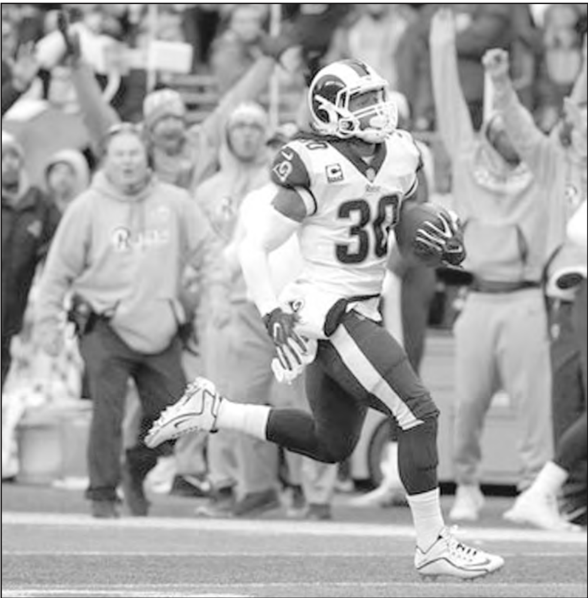
The Rams bench reacts as running back Todd Gurley runs for his third touchdown in the first half of an NFL football game against the Seattle Seahawks, Sunday, Dec. 17, 2017, in Seattle.