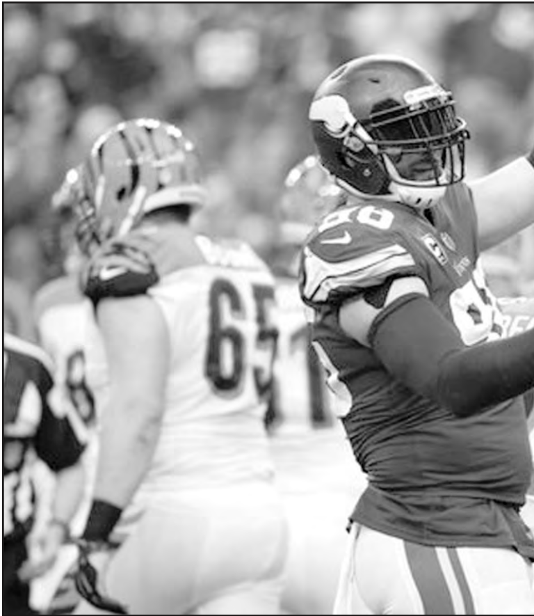
Minnesota Vikings defensive end Brian Robison celebrates after a sack during the first half of an NFL football game against the Cincinnati Bengals, Sunday, Dec. 17, 2017, in Minneapolis.

"We've been saying for a while that these wins don't really mean anything yet, and yesterday we were able to accomplish something with it and get the division," right guard.