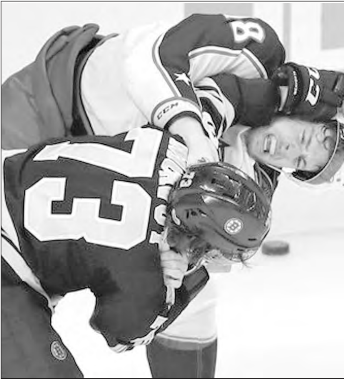
Columbus Blue Jackets center Pierre-Luc Dubois, right, hangs onto Boston Bruins defenseman Charlie McAvoy (73) as they fight during the third period of an NHL hockey game in Boston, Monday, Dec. 18, 2017.