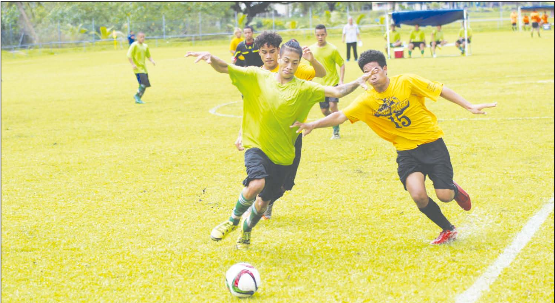
A Lion Heart player, left, and Pago Youth opponent compete for the ball during their round 3 match of the 2017 FFAS Top 4 Tournament on Saturday, Dec. 2, 2017 at Pago Park Soccer Stadium.