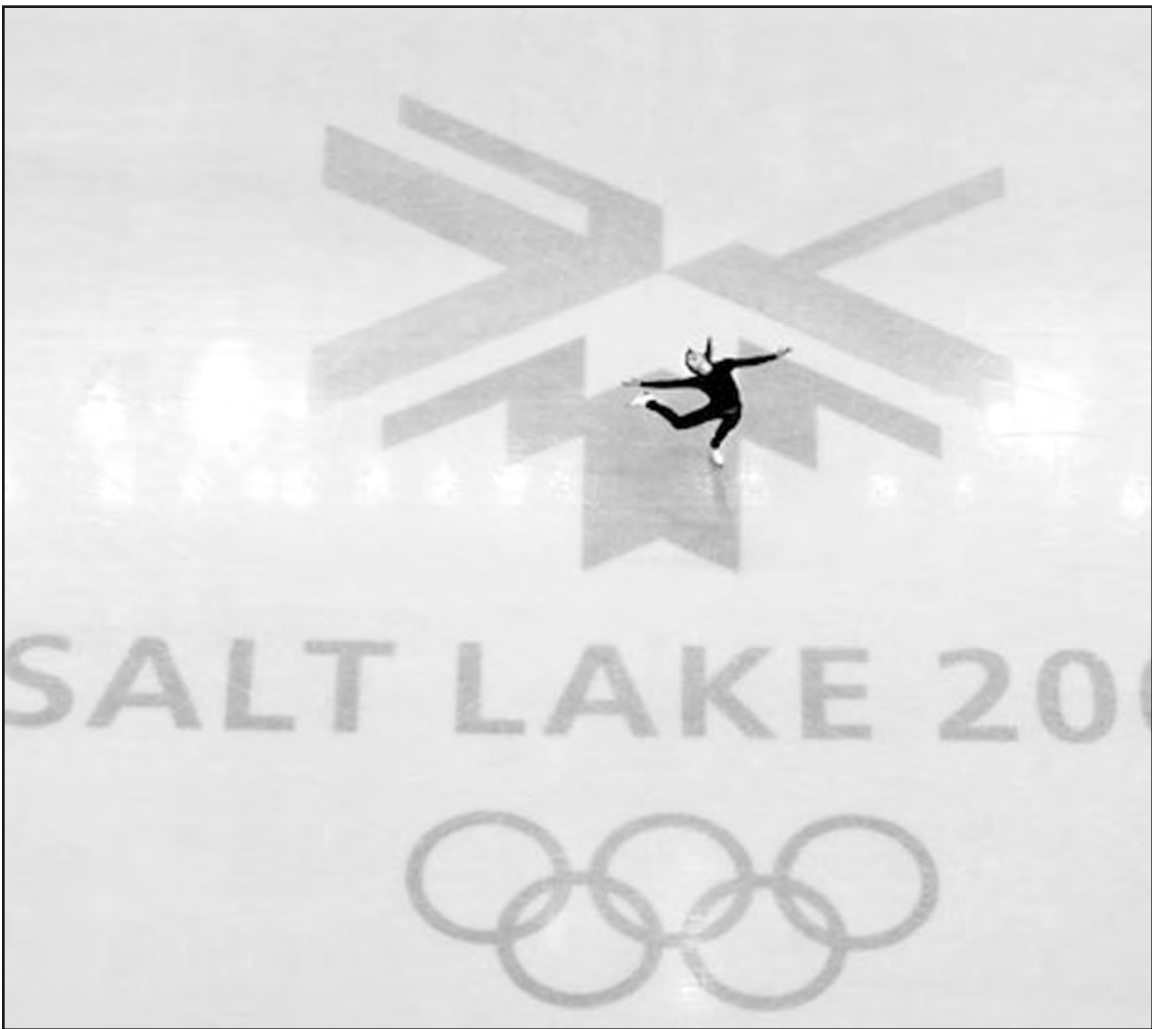
FILE - In this Feb. 8, 2002, file photo, U.S. champion Michelle Kwan practices for the women's short program for the Winter Olympic Games at Salt lake Ice Center in Salt Lake City. A committee studying the possibility of Salt Lake City making a bid to host another Winter Olympics says it would rather host the games in 2030, but would be ready if for some reason they are needed for 2026.