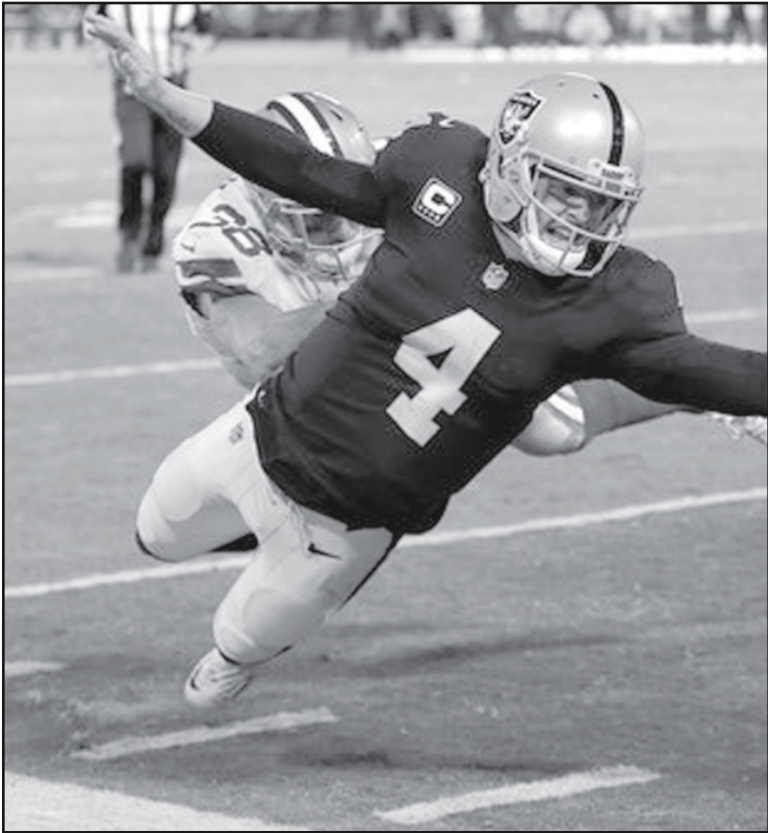
Oakland Raiders quarterback Derek Carr (4) fumbles the ball into the end zone in front of Dallas Cowboys strong safety Jeff Heath (38) during the second half of an NFL football game in Oakland, Calif., Sunday, Dec. 17, 2017. The play was ruled a touchback and the Cowboys got possession. The Cowboys won 20-17.