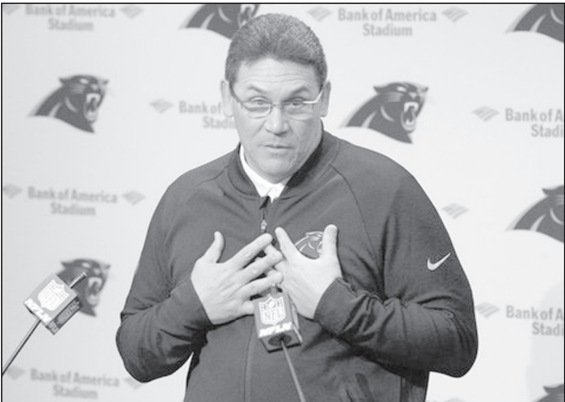
Carolina Panthers NFL football head coach Ron Rivera answers a question about the allegations against team owner Jerry Richardson, and the announced sale of the team at the end of the season, during a weekly press conference at Bank of America Stadium in Charlotte, N.C., Monday, Dec. 18, 2017.