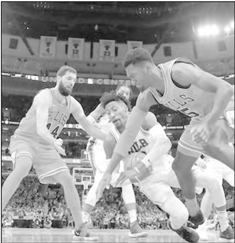
Philadelphia 76ers’ Robert Covington, center, battles Chicago Bulls’ Bobby Portis (5) for a rebound as Bulls’ Nikola Mirotic (44) watches during the second half of an NBA basketball game Monday, Dec. 18, 2017, in Chicago. The Bulls won 117-115.

Bulls: Host Orlando on Wednesday night. The Bulls beat the Magic 105-83 in Orlando in their first matchup of the season on Nov. 3.