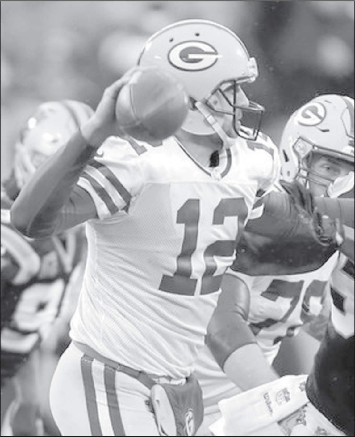
Green Bay Packers’ Aaron Rodgers (12) blocks Carolina Panthers’ Thomas Davis (58) during the second half of an NFL football game in Charlotte, N.C., Sunday, Dec. 17, 2017.

“I like (Panthers coach) Ron Rivera. I’ve always respected the play style of his football team. But that hit was a dirty hit.”