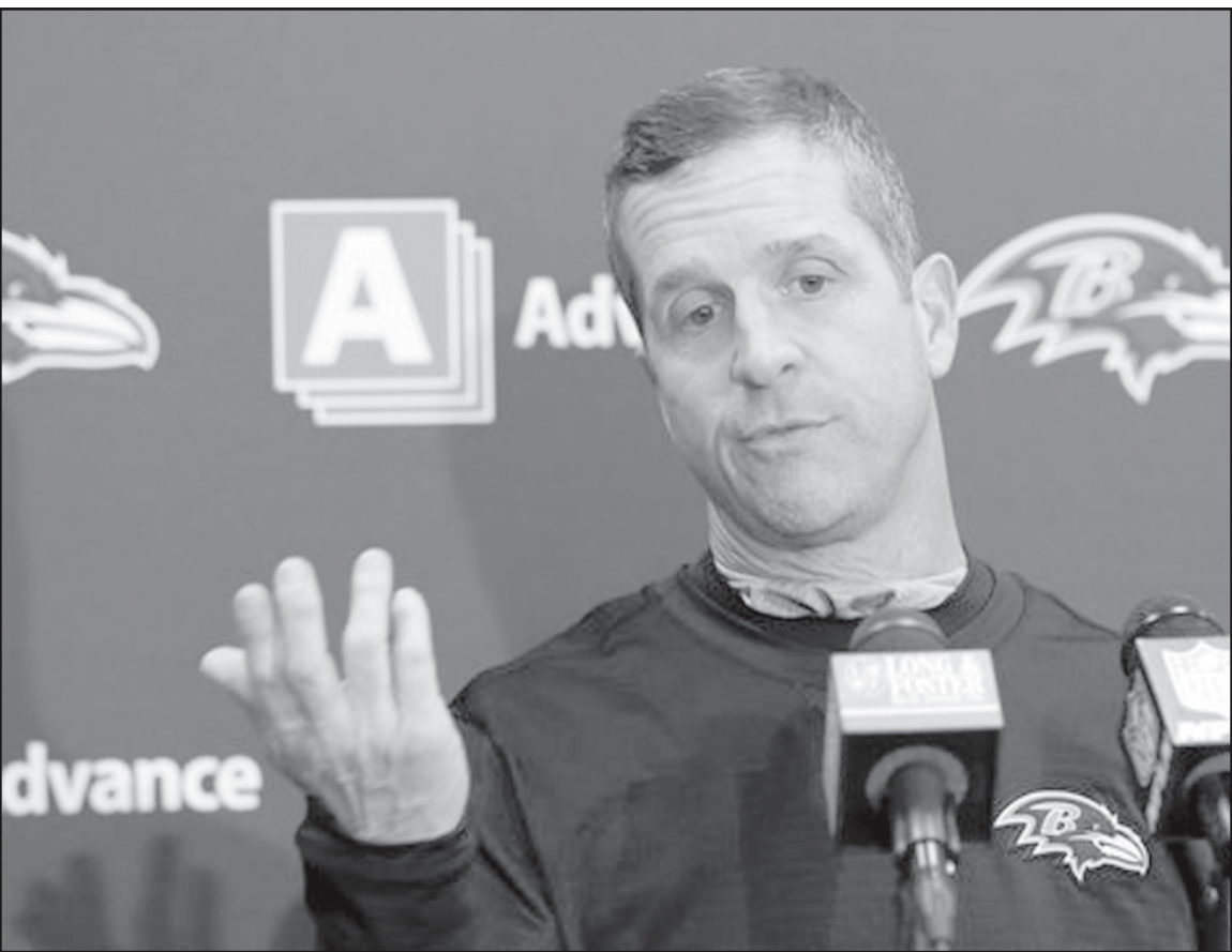
Baltimore Ravens head coach John Harbaugh answers questions during a news conference after his team defeated the Cleveland Browns in an NFL football game, Sunday, Dec. 17, 2017, in Cleveland.

explanation, but whatever it is, I'm going to disagree with it," Del Rio said. "I know what I saw, I saw it myself from the sideline. But I also saw plenty examples on Twitter. The guy ran out there with the camera and put the camera right down on it, so the whole world got to see what it was. It's not like we're making something up. The guy with the camera was right there. So how you can look at that and then get up with a smirk. I don't know, that's hard to take." Oakland still had a chance to win after holding Dallas to a field goal on that drive, but Derek Carr fumbled while trying to stretch the ball over the goal line on a scramble and the ball rolled out of the end zone for a touchback that gave the Cowboys the ball. The Raiders head into the final two games with only the slimmest of postseason chances. They must win at Philadelphia and the Chargers, then hope Buffalo and Tennessee each lose twice, Miami wins twice and Baltimore gets at least one tie or win in the final two games to get in as the sixth seed in the AFC. Oakland's playoff odds are estimated at less than 1 percent, according to fivethirtyeight.com. Still, Del Rio doesn't plan to shift playing time with an eye on evaluating younger players ahead of next season. "We're going to play to win," he said. "We're just going to play to win. We're going to do everything we can to get over this 'close but no cigar' finish we had."