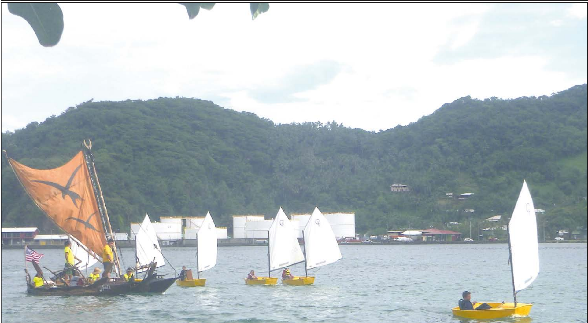
Committee Boat Apaula and sailors heading in to Sadie's by the Sea after a round of races. Ten Apia sailors and nine local sailors competed this past weekend in the 2017 Pago Pago Harbor Optimist Sailing Regatta.