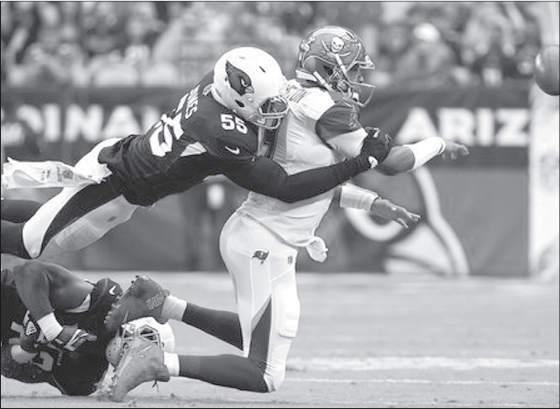
Tampa Bay Buccaneers quarterback Jameis Winston, right, is tackled by Arizona Cardinals outside linebacker Chandler Jones (55) and inside linebacker Haason Reddick (43) during the first half of an NFL football game Sunday, Oct. 15, 2017, in Glendale, Ariz. Winston was injured on the play, would briefly return to the game, but left the game before halftime.

MONDAY TO FRIDAY: 7:30AM-5:00PM SATURDAY :8:00AM-1:00PM