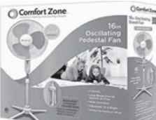
Comfort Zone Fan 16"

We are now accepting Credit & Debit Cards.