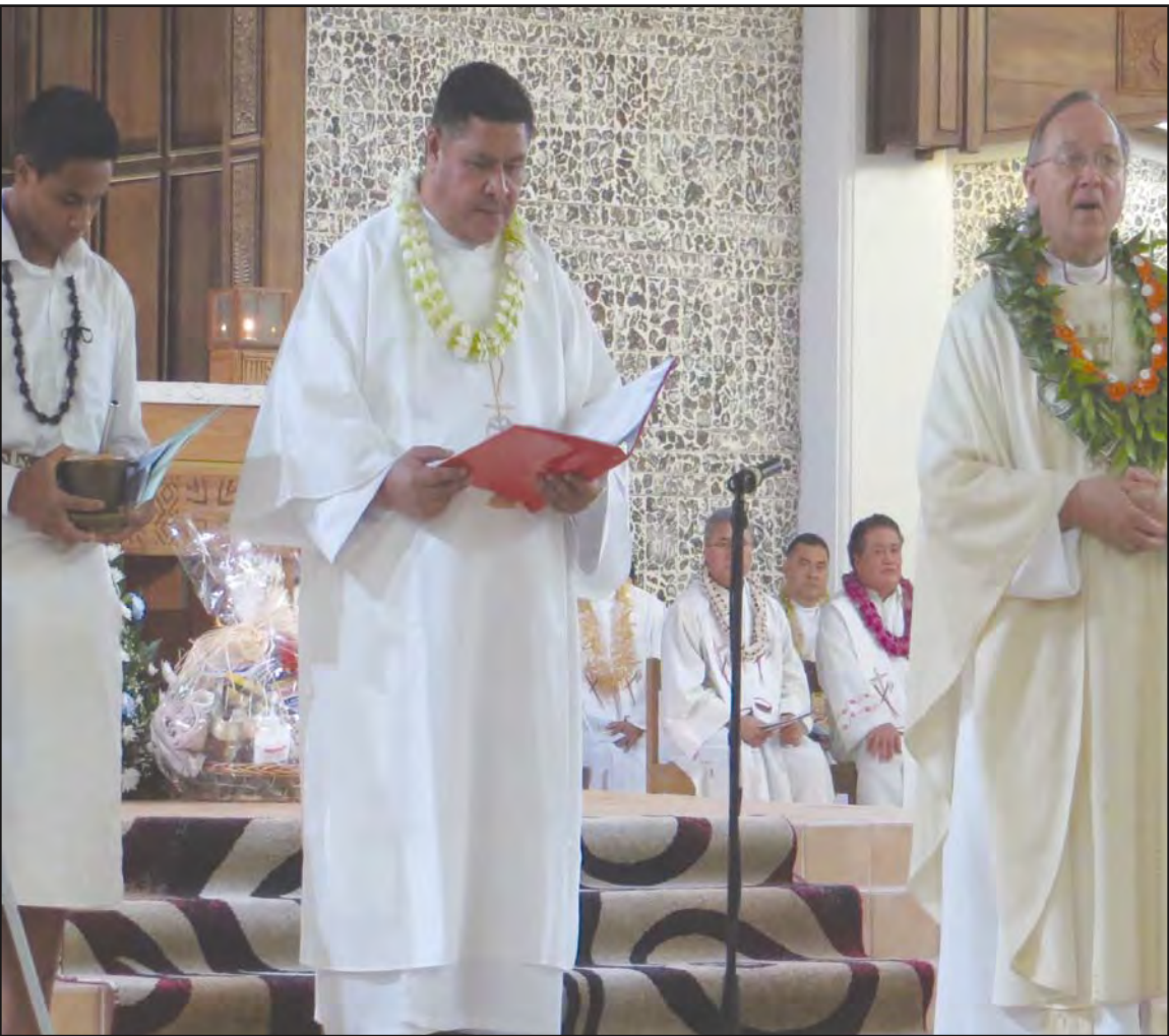
Le ma’a fa’ailo o le atoaga o le 30 tausaga o le Hope House i Fatuoaga ua maea saunia e le Komiti Fa’afaoe ma ua fa’apa’iaina i le sauniga na tatala ai le vaiaso fiafia e fa’ailo ai le auunaga ua au a lea nofoaga i le Fatuoaga.