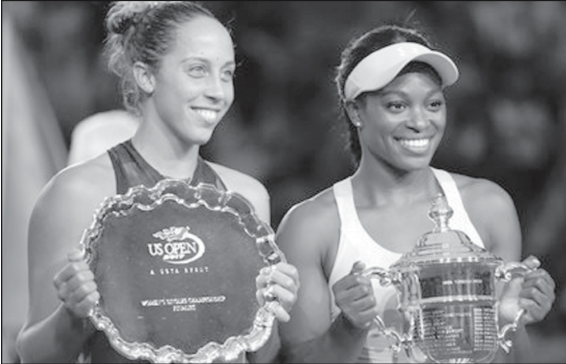
Madison Keys, of the United States, left, holds up the finalist trophy as Sloane Stephens, of the United States, holds the championship trophy after Stephens won the women's singles final of the U.S. Open tennis tournament, Saturday, Sept. 9, 2017, in New York.

Also advancing were Agnieszka Radwanska, who plays Barty next, Lauren Davis of the U.S., Barbora Strycova of the Czech Republic, Alize Cornet of France, and Kiki Bertens of the Netherlands.