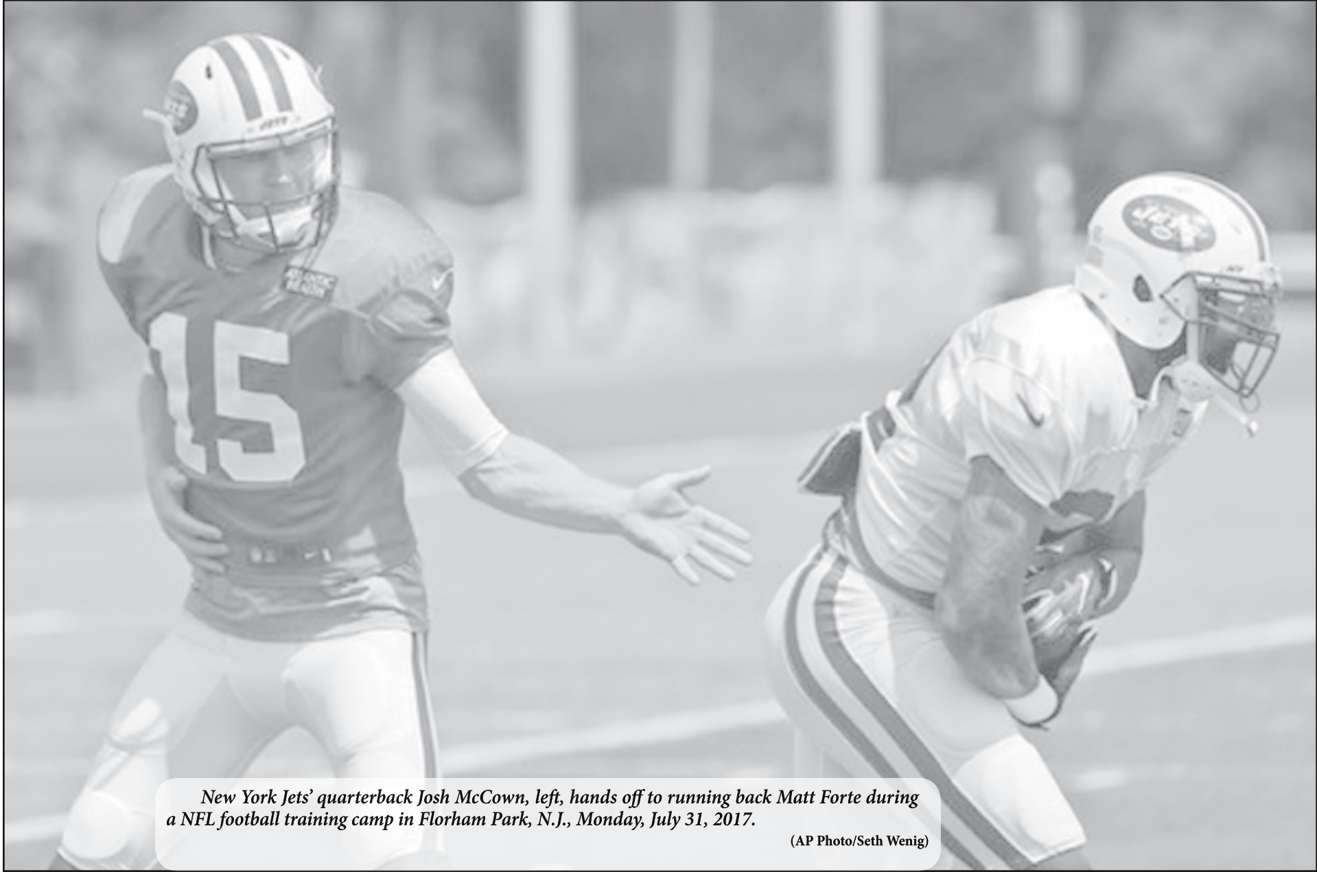
New York Jets' quarterback Josh McCown, left, hands off to running back Matt Forte during a NFL football training camp in Florham Park, N.J., Monday, July 31, 2017.