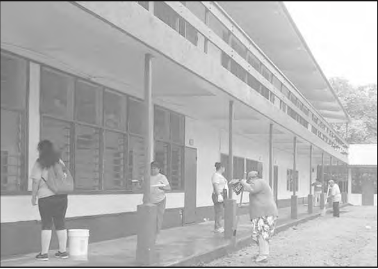
O se va'aiga i le aufaigaluega a le Homeland Security ua galulue malosi e fa'amama le lotoa ma falea'oga o le a'oga maualuga i Fa'asao Marist High i Lepua. Malo le galulue.