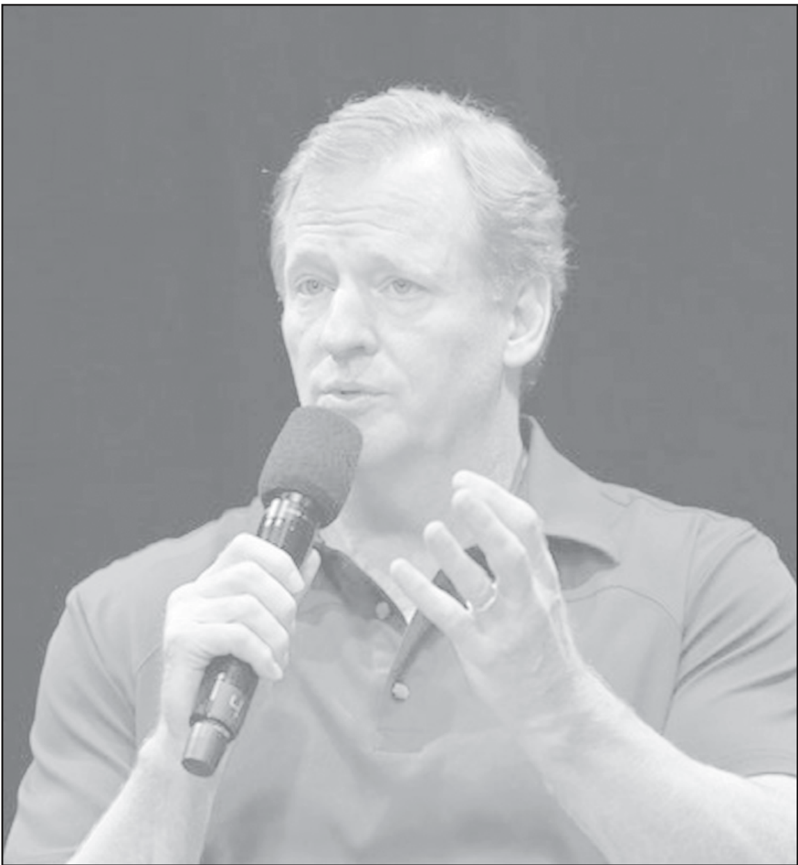
NFL football Commissioner Roger Goodell talks with Arizona Cardinals season ticket holders during an event at University of Phoenix Stadium ,Monday, Aug. 14, 2017, in Glendale, Ariz.