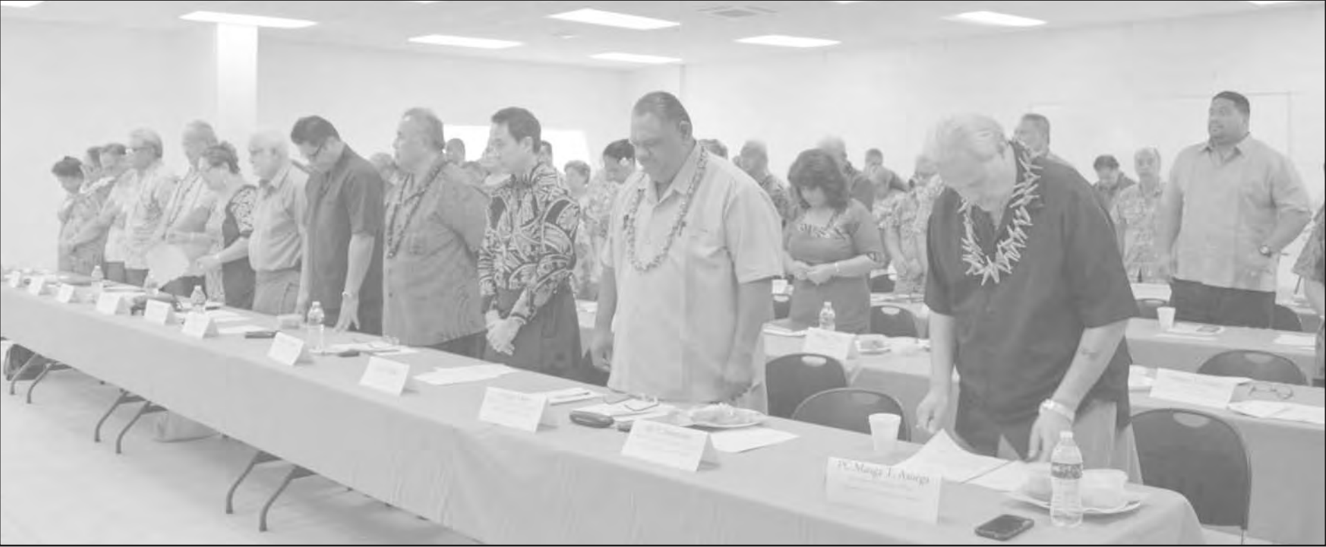
Kapeneta a le afioga i le ali'i kovana

Sa ia taua e fa'apea, afai na mafai e le malo ona faalelei le faaiuga o le tausaga tupe sa sili ona faigata ua mavae atu, e tatau fo'i ona mafai ona latou faia le tulaga lena i le tausaga tupe lenei.