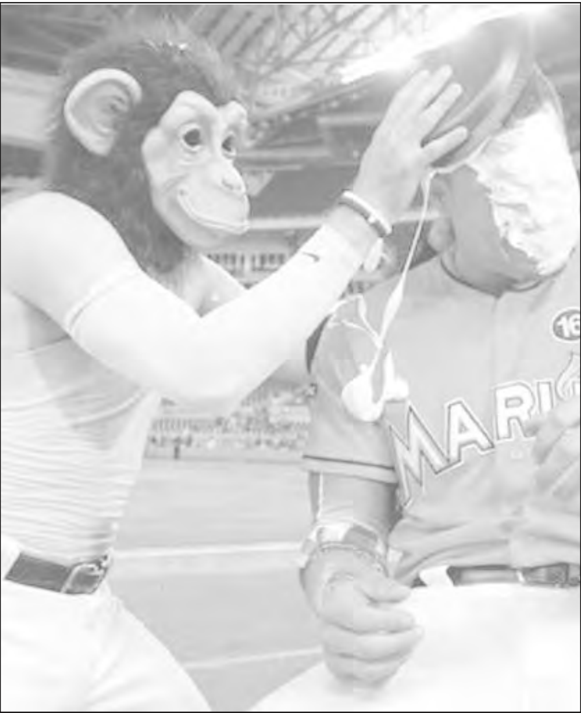
Miami Marlins’ Miguel Rojas, left, wears a mask as he hits Giancarlo Stanton with a shaving cream pie as Stanton does an interview after they defeated the Colorado Rockies in a baseball game, Sunday, Aug. 13, 2017, in Miami.