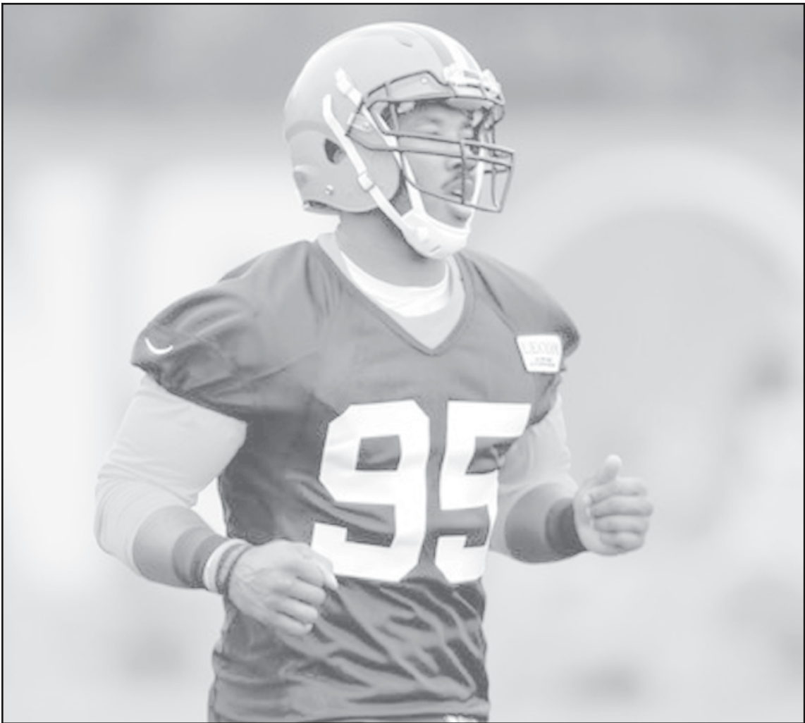
FILE - In this May 12, 2017 photo shows Cleveland Browns' Myles Garrett runs through drills during NFL football rookie minicamp in Berea, Ohio. Garrett has fully recovered from a foot sprain and is ready for training camp, the team announced Wednesday, July 26, 2017. Garrett, the No. 1 overall pick in this year's draft, suffered a left lateral foot sprain during minicamp in June.