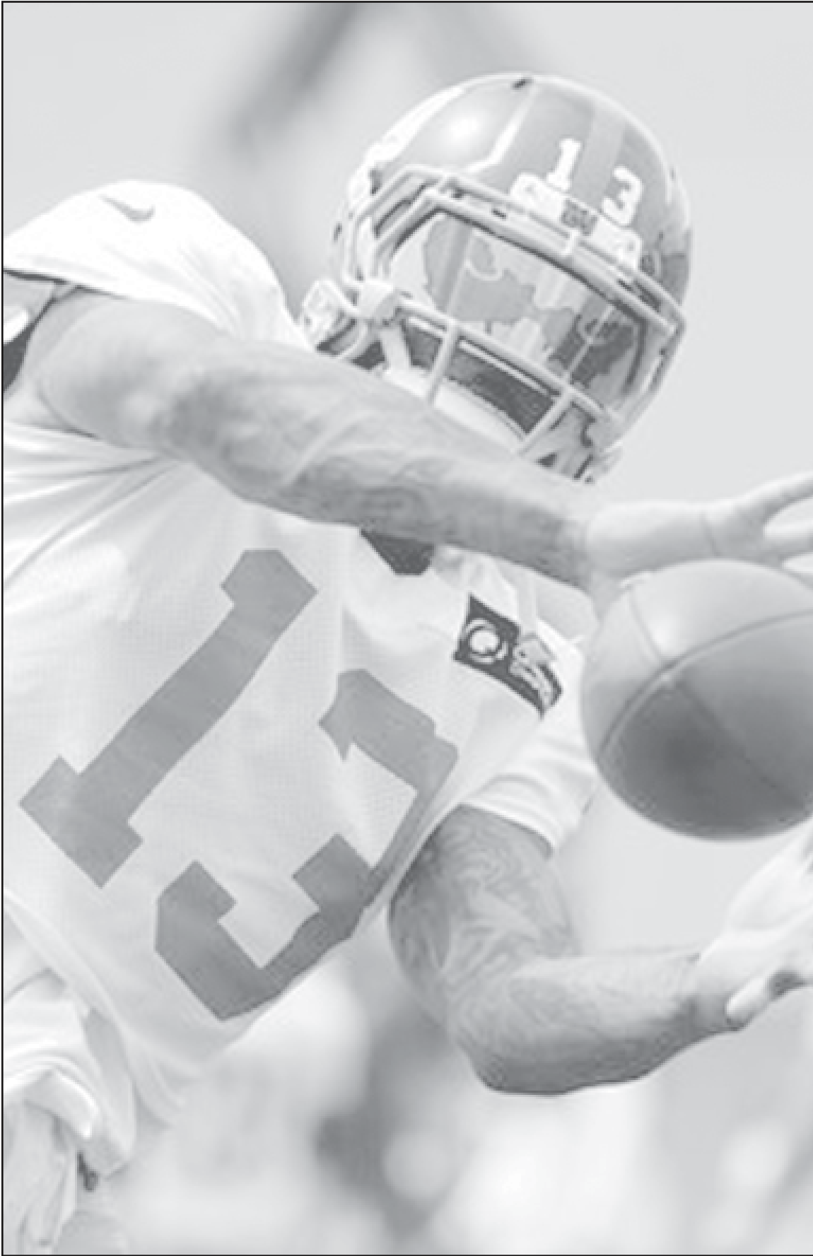
FILE - In this Aug. 8, 2017, file photo, New York Giants wide receiver Odell Beckham works out during NFL football training camp, in East Rutherford, N.J. After a miserable end to the 2016 season and the brouhaha about his desire to be the NFL, Áôs highest paid player, Beckham is having a great time at training camp with the Giants.