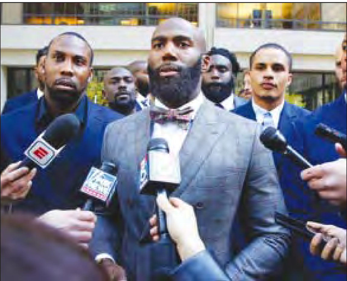
In this Tuesday, Oct. 17, 2017, file photo, Former NFL football player Anquan Boldin, left, Philadelphia Eagles Malcolm Jenkins, center, and San Francisco 49ers Eric Reid, right, speak to the media outside the league’s headquarters after meetings in New York. San Francisco 49ers linebacker Eric Reid says he left The Players Coalition because founder Malcolm Jenkins excluded Colin Kaepernick from meetings, and asked players if they would stop protesting the anthem if the NFL made a charitable donation to causes they support.

Jets linebacker Demario Davis has no problem with leadership. “The Coalition has been a very solid group, as far as I’ve been concerned,” Davis said. “Everything’s been positive. Talks between leadership, which is Anquan and Malcolm, and ownership, and it’s been very positive. We hope we make leeway in the negotiations and how we can get things done the best way to help the community.”