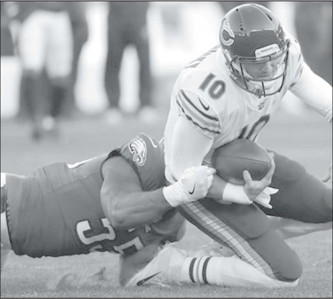
Chicago Bears’ Mitchell Trubisky, right, is tackled by Philadelphia Eagles’ Brandon Graham during the second half of an NFL football game, Sunday, Nov. 26, 2017, in Philadelphia.

The wide receiver, who was not in the locker room to talk with the media on Wednesday, wrote on Instagram he doesn’t have a foundation. Matthews wrote he’s supporting Kaepernick for his sacrifice bringing attention to every day issues along with the quarterback’s foundation because everyone should know their rights and use them. Matthews has stayed off the field during the anthem in protest , though he stood Nov. 12 to honor veterans.