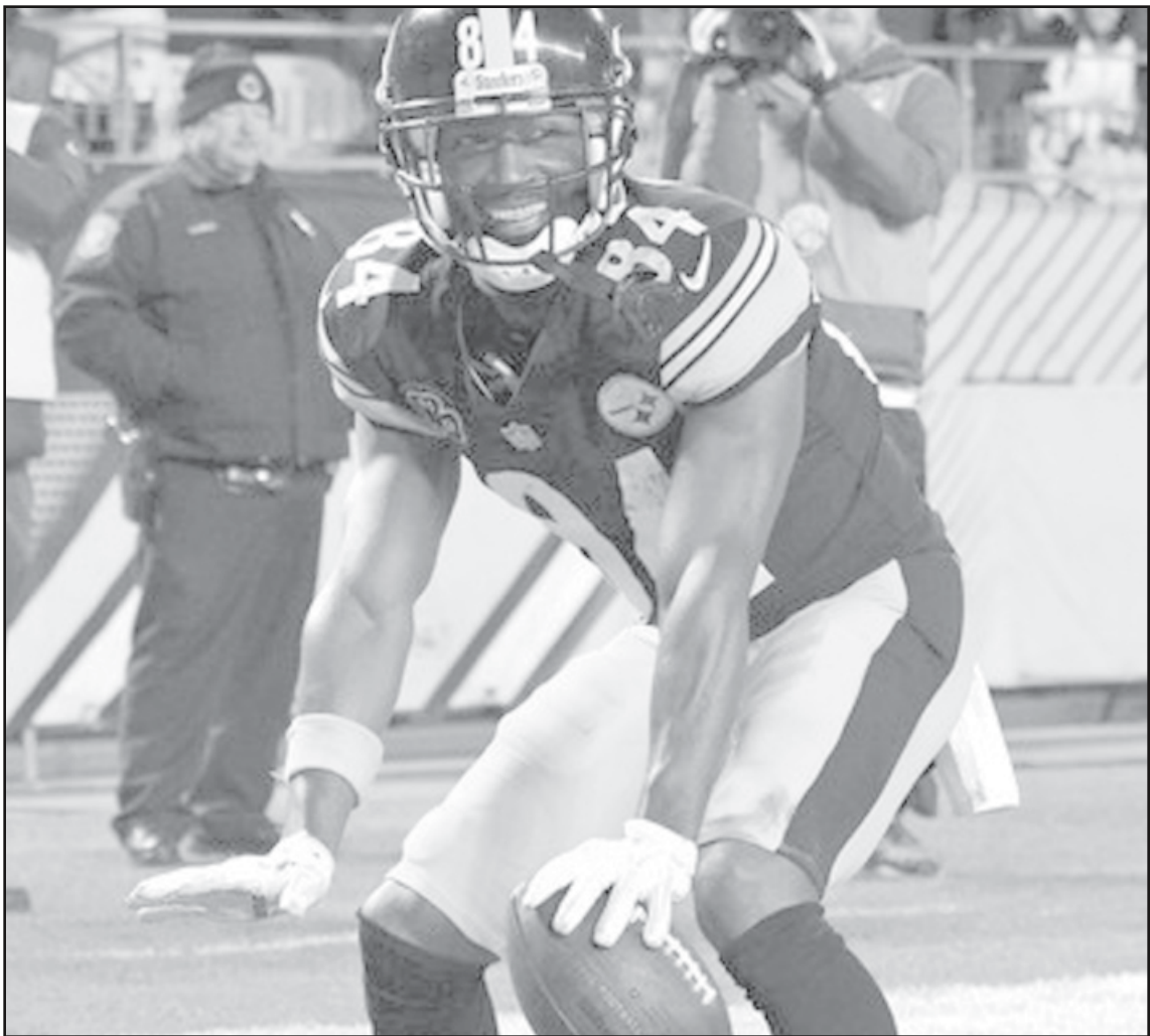
Pittsburgh Steelers wide receiver Antonio Brown (84) celebrates in the end zone after scoring during the second half of an NFL football game against the Green Bay Packers in Pittsburgh, Sunday, Nov. 26, 2017. The Steelers won 31-28.