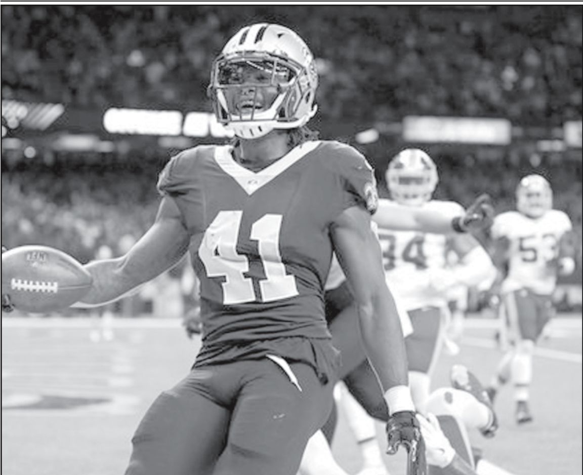
FILE - In this Sunday, Nov. 19, 2017, file photo, New Orleans Saints running back Alvin Kamara (41) celebrates his game-tying two-point conversion in the second half of an NFL football game against the Washington Redskins in New Orleans. Opposing defenses are still having trouble containing Kamara, who leads all rookies in touchdowns. Carolina Panthers coach Ron Rivera says the offense designed by Saints coach Sean Payton is too dynamic to focus on stopping Kamara, which is a factor in the rookie,Äôs success.

lated,” Kamara said. “It’s a lot of down-shifting and up-shifting. ... I wasn’t really a big juke.” Right guard Larry Warford said Kamara’s teammates have caught themselves letting up on plays, figuring Kamara is certain to be tackled, only to realize he’s still running. “When you see him in a situation and it looks like there’s no way he’s getting out of that, he gets out of it,” Warford said. “It’s weird.” The Panthers’ Davis, a former Georgia player, sounded among the least surprised by Kamara’s success. “I’ve been a real fan of Alvin since he was at Tennessee, watching a lot of SEC football and really seeing how dynamic that guy was,” Davis said “It’s definitely translated over into the NFL.”