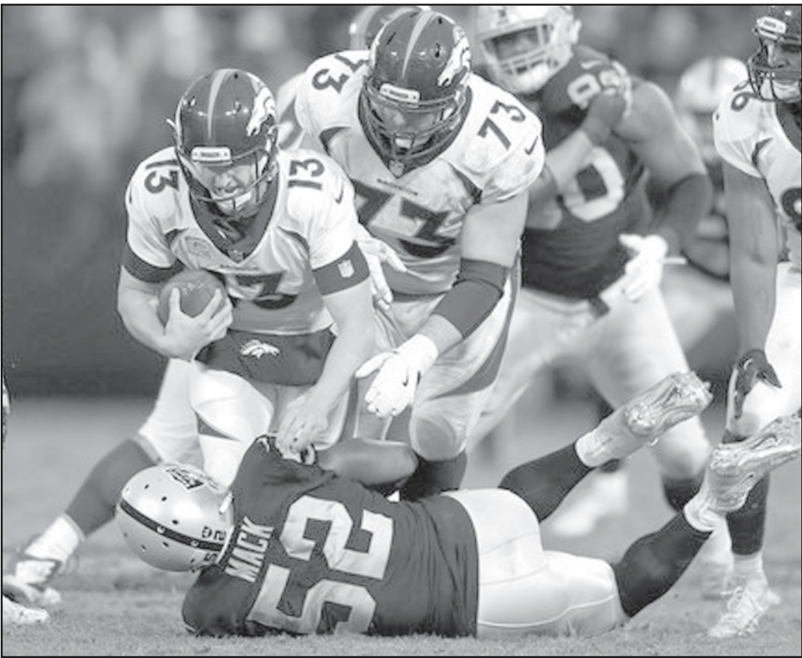
Oakland Raiders defensive end Khalil Mack (52) sacks Denver Broncos quarterback Trevor Siemian (13) during the second half of an NFL football game in Oakland, Calif., Sunday, Nov. 26, 2017. The Raiders won 21-14.