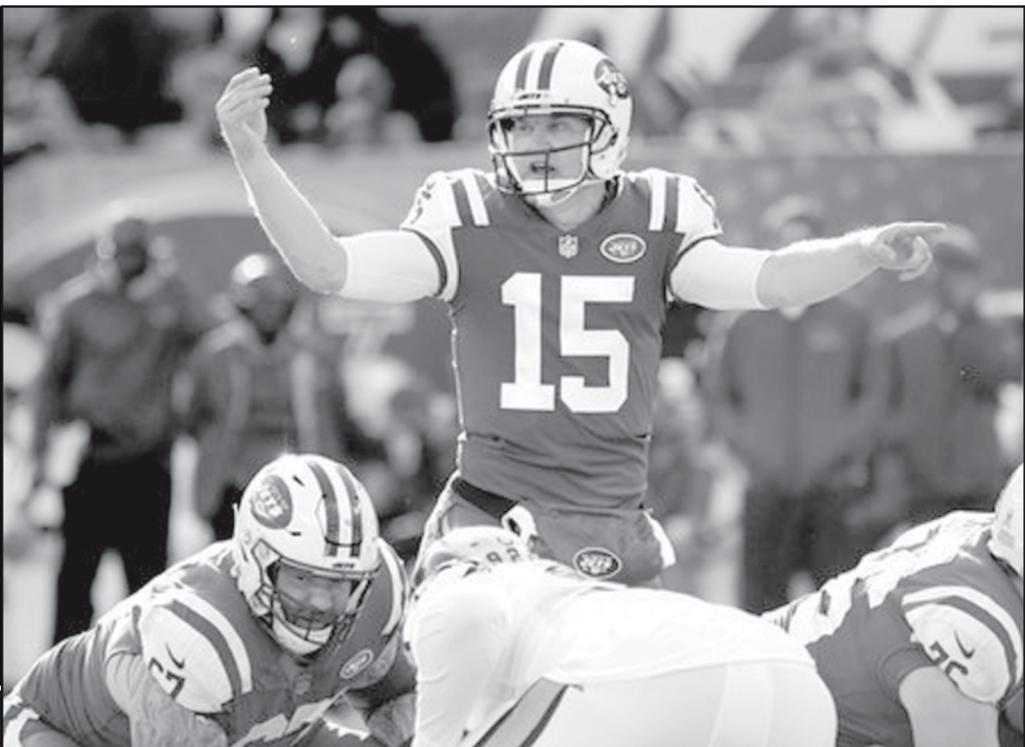
In this Nov. 26, 2017, photo, New York Jets quarterback Josh McCown (15) talks to his line before the snap against the Carolina Panthers during the first half of an NFL football game in East Rutherford, N.J. McCown realizes that he's not a long-term answer at quarterback for the New York Jets. But at 38, he's not thinking too far ahead. His focus is squarely on the Kansas City Chiefs and not whether he'll remain under center the rest of the season or even continue to play beyond this year.

With basic (or intermediate) accounting background Verbal/written communication Multi-tasking, prioritizing and organizational skills Knowledge in Quickbooks or Peachtree is a must MS Office Proficient Have worked in similar office environment. Email your resume to breakerspoint.as@gmail.com. No phone calls please.