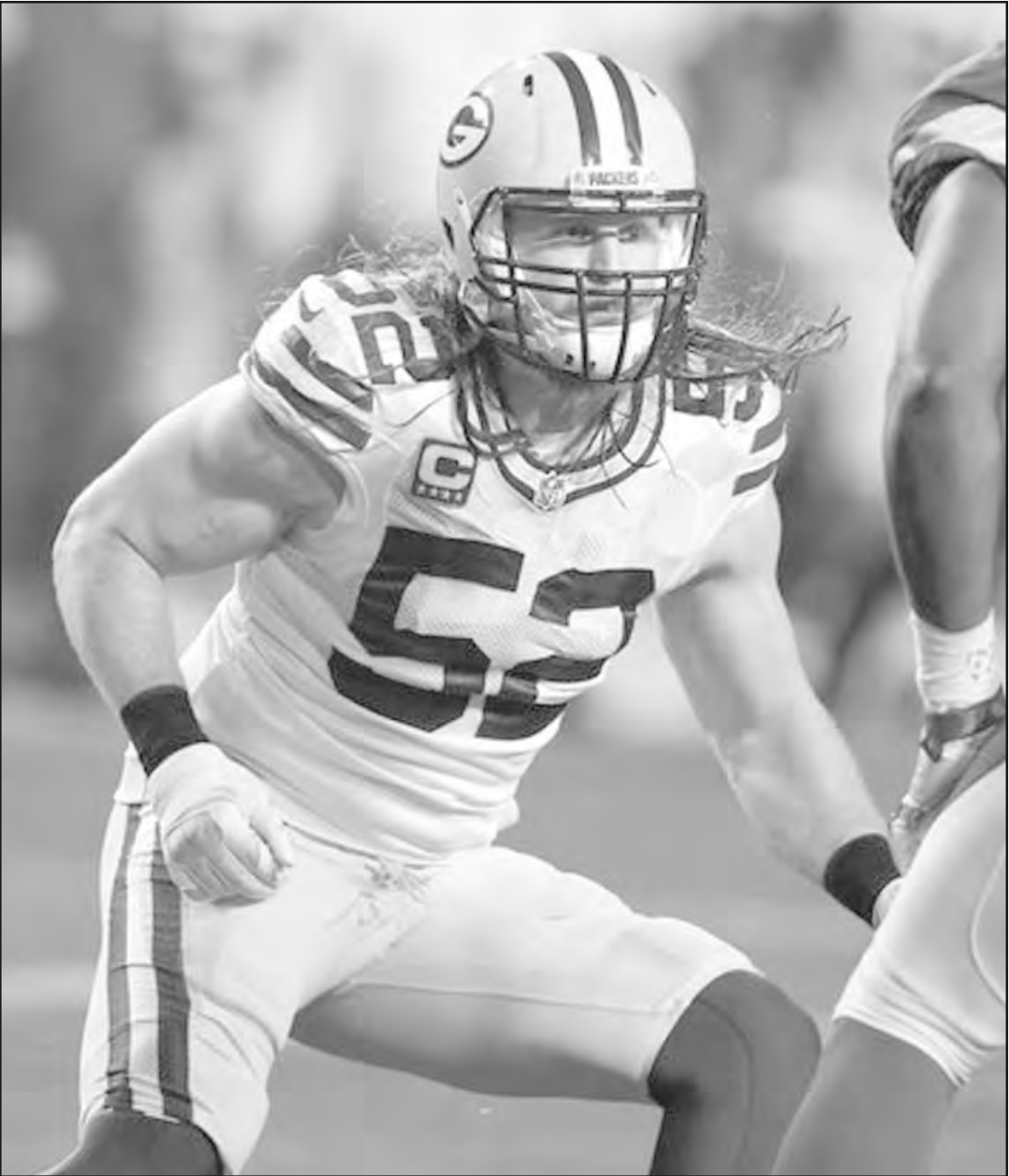
FILE - In this Jan. 16, 2016, file photo, Green Bay Packers inside linebacker Clay Matthews (52) chases a play during an NFL divisional playoff football game against the Arizona Cardinals, in Glendale, Ariz. A bye week allowed the Green Bay Packers to get some much-needed rest and just as importantly push the reset button on the season after two straight losses since quarterback Aaron Rodgers got hurt. Veteran linebacker Matthews says the disastrous feeling of losing Rodgers to a broken collarbone is behind the team and that they, Åore focused on moving forward.

defense produced against Pittsburgh’s prolific offense would help. Green Bay forced take-aways even without Matthews and run-stuffing defensive lineman Kenny Clark (ankle). In his second year in the league, Clark has turned into an important piece up front next to Mike Daniels. After being carted off the field, Clark thought his season was over. He’s hoping to come back, too, against Tampa after returning to practice Wednesday. “It was ugly. My ankle was swollen,” Clark said. “I thought it was worse than what it was, honestly. I’m happy it was a high ankle sprain.” What the Packers might need most on defense is more pressure on the quarterback after coming up with one sack against the Steelers. The defense rarely blitzed while concentrating on stopping receiver Antonio Brown, putting the onus on pass rushers to win matchups. Other times, the Packers rushed three but kept a defender close to the line to spy on crossing routes. “But we have to win this week ... after all these losses,” Matthews said. “But it starts with a win. We were close on Sunday night, but close doesn’t cut it. This is the week.”