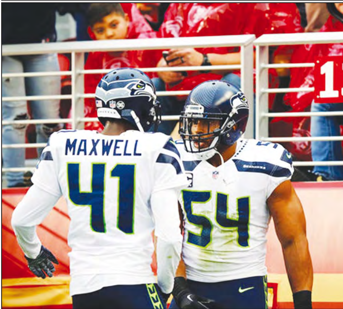
Seattle Seahawks middle linebacker Bobby Wagner (54) celebrates after intercepting a pass with teammate Byron Maxwell (41) during the first half of an NFL football game against the San Francisco 49ers Sunday, Nov. 26, 2017, in Santa Clara, Calif.