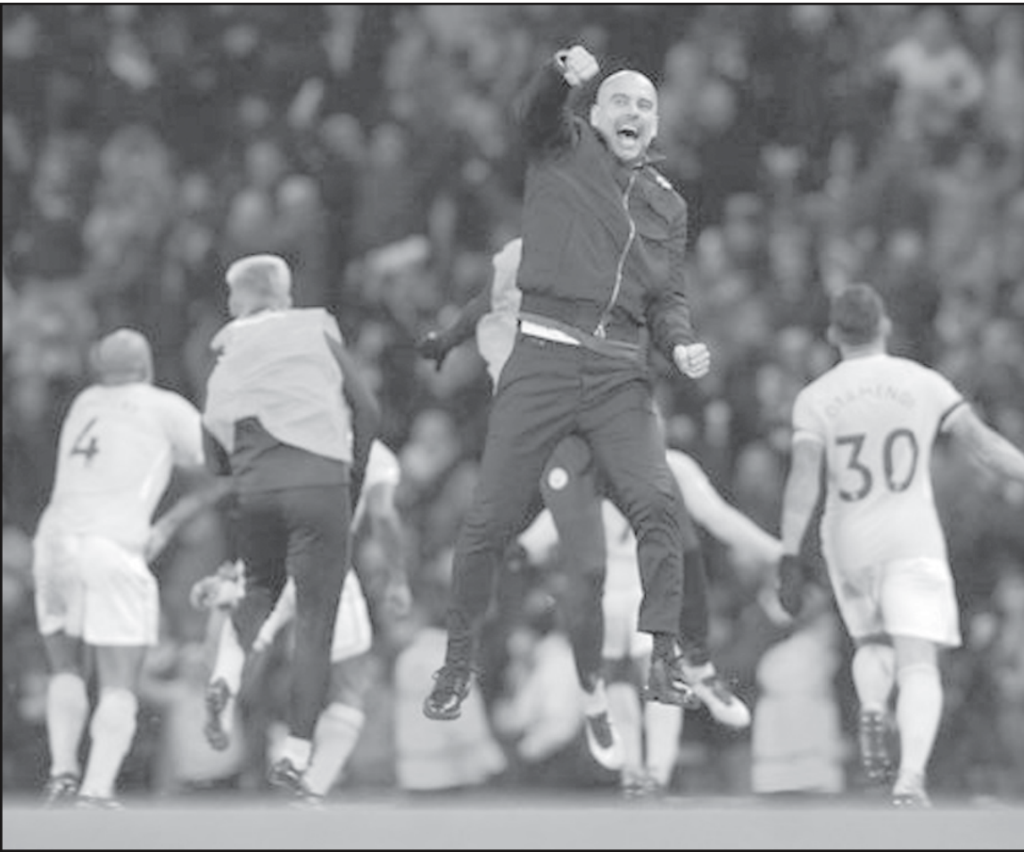
Manchester City manager Josep Guardiola celebrates after Manchester City's Raheem Sterling scored his side second goal during the English Premier League soccer match between Manchester City and Southampton at Etihad stadium, in Manchester, England, Wednesday, Nov. 29, 2017.

Sadio Mane opened the scoring for Liverpool, lofting the ball into the net as Stoke's defenders claimed it had gone out of play earlier.