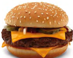
Quarter Pounder Burger