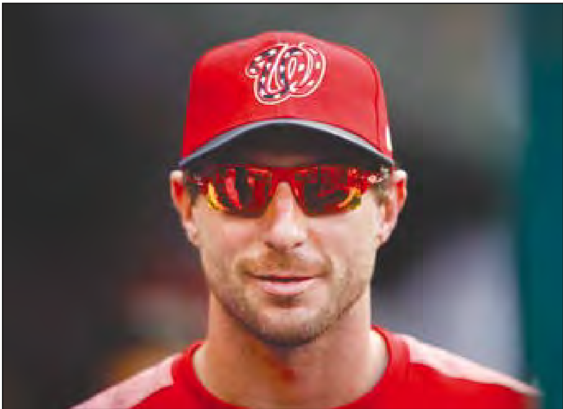
FILE - In this Aug. 30, 2017, file photo, Washington Nationals pitcher Max Scherzer stands in the dugout during the team's baseball game against the Miami Marlins at Nationals Park in Washington. Scherzer of the Washington Nationals coasted to his third Cy Young Award, winning Wednesday, Nov. 15, for the second straight year in the National League.

CLASSIFIEDS • CARTOONS • ALOHA BRIEFS & MORE