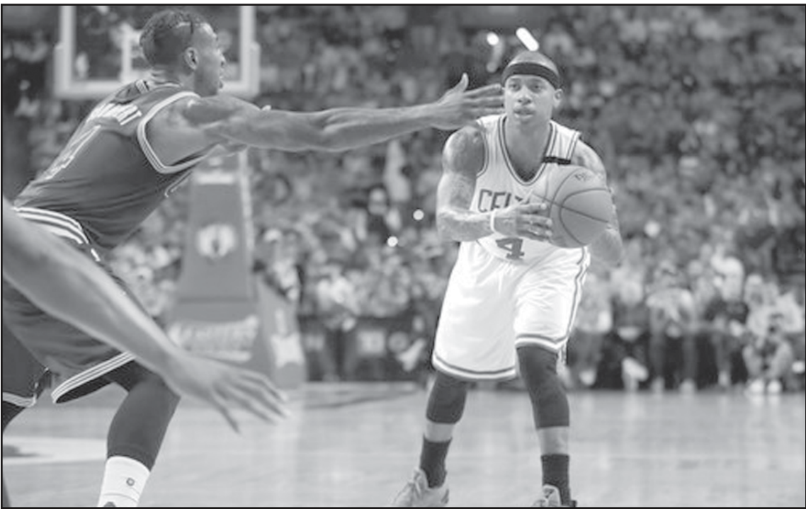
FILE - In this Friday, May 19, 2017 file photo, Boston Celtics guard Isaiah Thomas looks to pass the ball as Cleveland Cavaliers guard Iman Shumpert, left, defends during the first half of Game 2 of the NBA basketball Eastern Conference finals in Boston. Day by day, Isaiah Thomas looks a little more like an All-Star point guard like himself. And just maybe like one who can rescue the reeling Cavaliers. Thomas has been increasing his workout load and is making strong progress in his recovery from a hip injury that ended his 2016 in Boston and delayed the start of his 2017 season with Cleveland, Tuesday, Nov. 7, 2017.