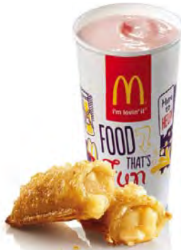
Small Shake & Apple Pie