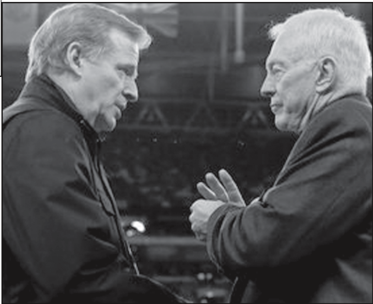
FILE - In this Nov. 9, 2014, file photo, NFL Commissioner Roger Goodell, left, and Dallas Cowboys owner Jerry Jones talk at the NFL football game between the Jacksonville Jaguars and the Cowboys at Wembley Stadium in London. The Associated Press has obtained a letter sent to Jerry Jones, attorney accusing the Cowboys owner of, "conduct detrimental to the league," over his objection to a contract extension for Goodell. The letter accusing Jones of sabotaging the negotiations was sent to David Boies on Wednesday, Nov. 15, 2017.

It's the latest escalation of a feud between the NFL and one of its most powerful owners. Jones has denied that his objections to the extension are tied to Goodell's decision to suspend star running back Ezekiel Elliott for six games over alleged domestic violence.