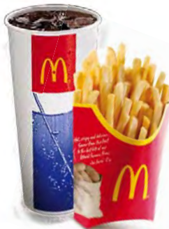
Med Fries & Med Drink