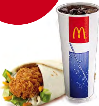
McChicken Wrap & Med Drink

Choose one of the below combos, Thursdays Only