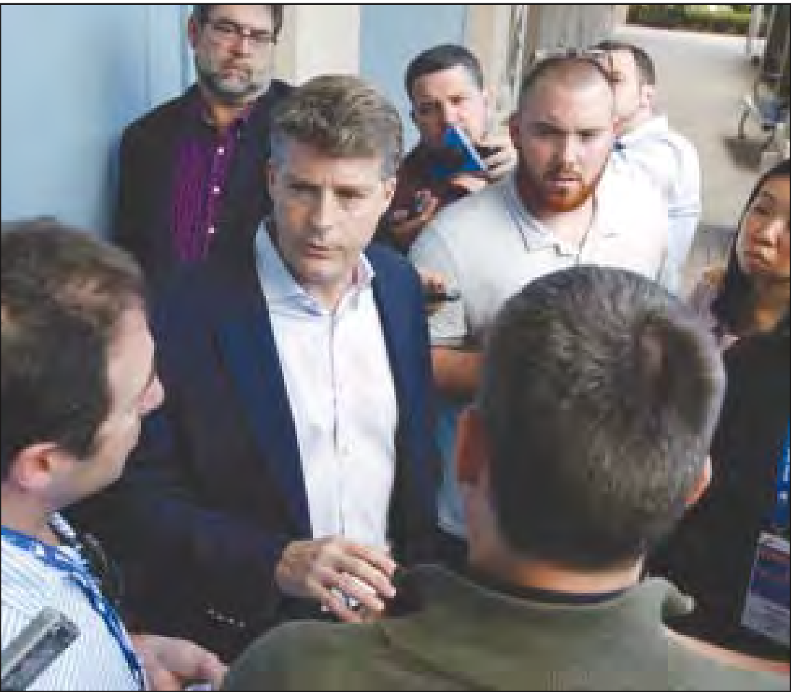
Hal Steinbrenner, second from left, principal owner, managing general partner and co-chairman of the New York Yankees, talks with reporters at the annual MLB baseball general managers' meetings, Wednesday, Nov. 15, 2017, in Orlando, Fla.

He remains intent on the Yankees finishing 2018 below next year's luxury tax threshold of $197 million, which would reset New York's base tax rate from 50 percent to 20 percent in 2019 — the season after Bryce Harper, Manny Machado and possibly Clayton Kershaw are eligible for free agency.