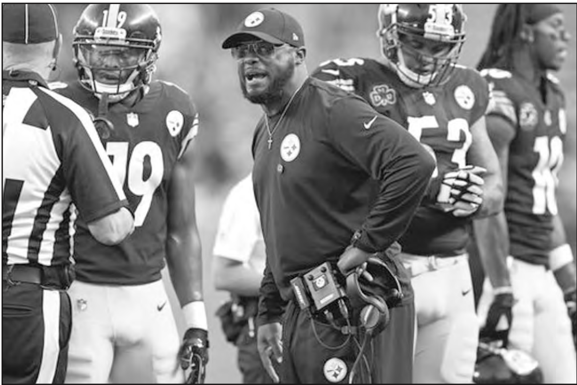
FILE - In this Oct. 22, 2017, file photo, Pittsburgh Steelers coach Mike Tomlin, center, talks with an official during the first half of the team's NFL football game against the Cincinnati Bengals in Pittsburgh. Tomlin was the only other coach named on all 11 ballots in voting by an Associated Press panel for the top NFL coaches, and finished second with 81 points. He has won six division titles, two AFC championships and one Super Bowl since replacing Bill Cowher in 2007.