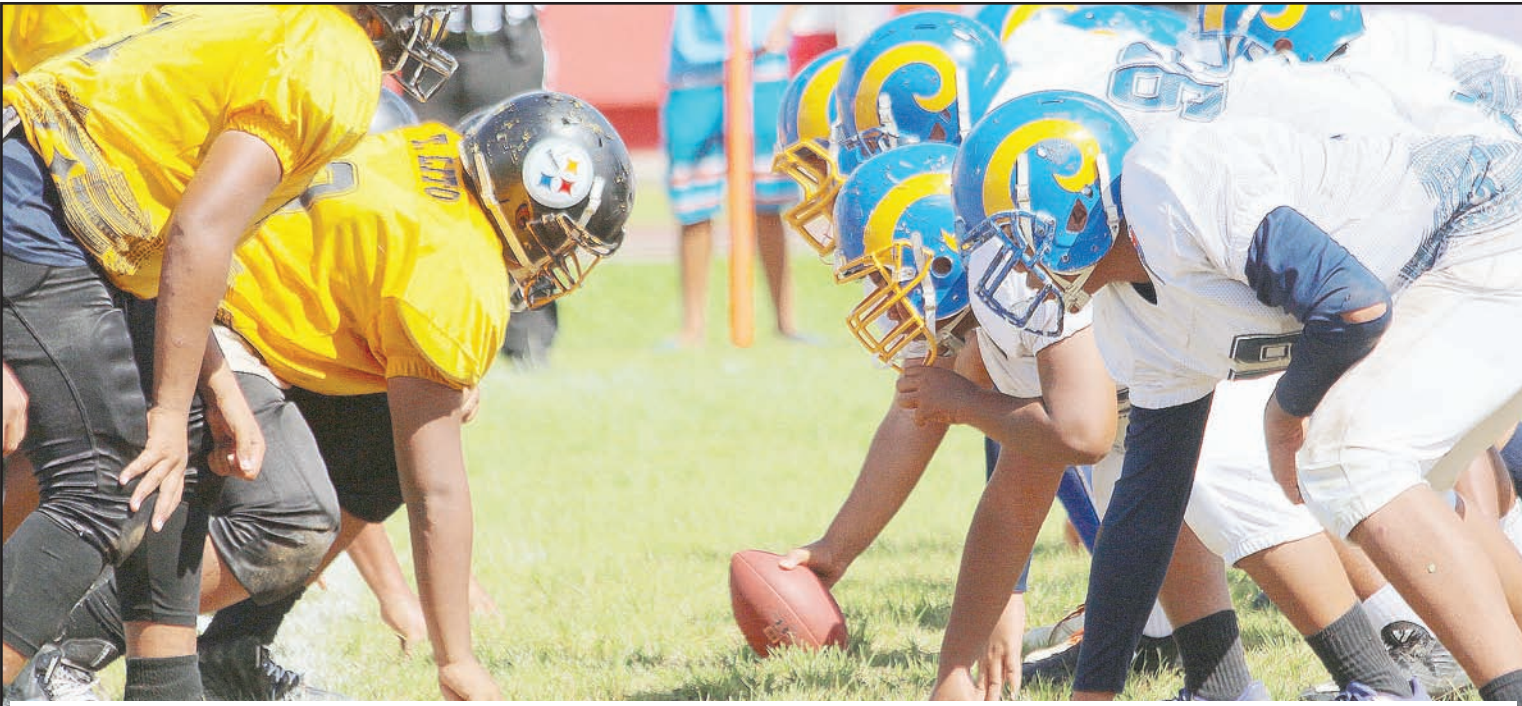
The AYFS Rams offensive squad about to snap another play against the Steel curtain that shut them out 36-0 last Saturday morning at the Veterans Memorial Stadium - the third week of the American Youth Football of Samoa's (AYFS) 8th season in the territory. (See tomorrow's Samoa News issue for more highlights).