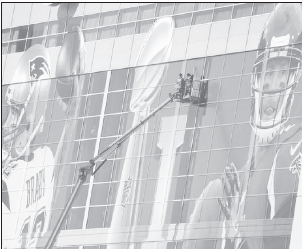
Workers attach a sign to the front of NRG Stadium as preparations continue for the NFL Super Bowl 51 football game Sunday, Jan. 29, 2017, in Houston.