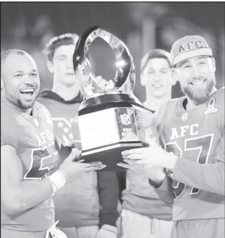
AFC outside linebacker Lorenzo Alexander (57) of the Buffalo Bills, and tight end Travis Kelce (87), of the Kansas City Chiefs, raise the MVP trophy following the NFL Pro Bowl football game Sunday, Jan. 29, 2017, in Orlando, Fla. The AFC defeated the NFL 20-13.