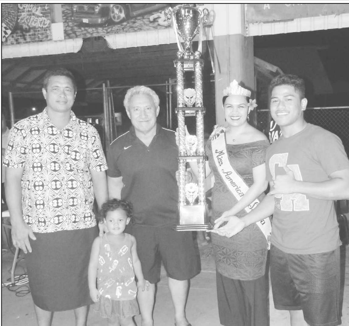
Mizuno Boys Team won the President's Cup of the U19 tournament and they were presented the trophy last Thursday night.

Pingpong, you see, helped transform a team into a brotherhood.