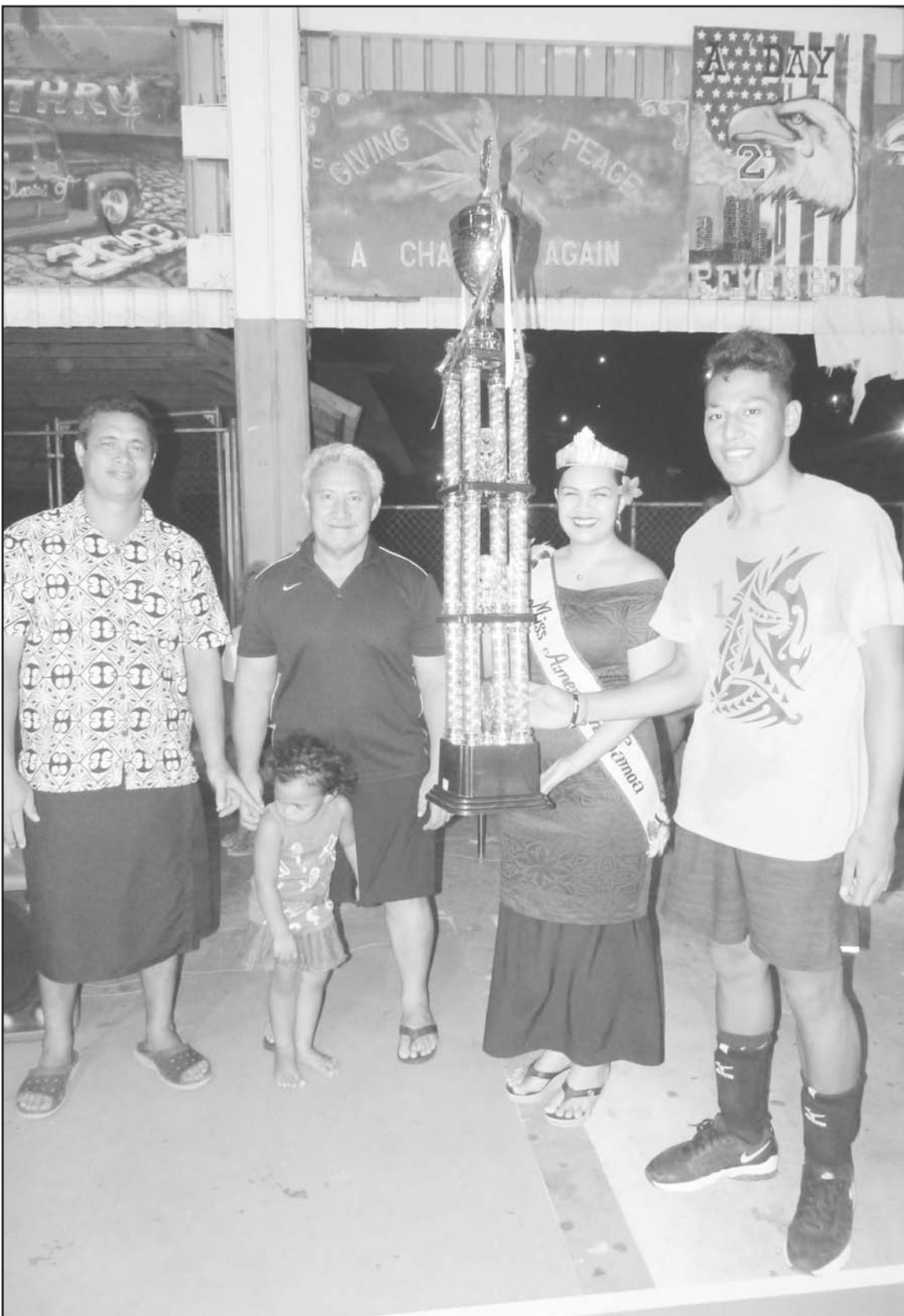
The winner of the first U19 Samoa Challenge Tournament goes to All Stars Samoa and their captain was ready to take the trophy home. These two teams were supposed to leave on Thursday evening on the Lady Naomi, but stayed behind again just to finish the tournament that same evening.