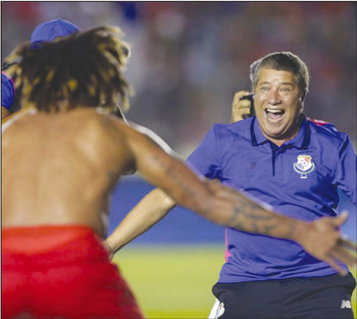
Panama's coach Hernan Dario Gomez, from Colombia, celebrates with his player Roman Torres who scored his team's second goal, after a 2018 Russia World Cup qualifying soccer match against Costa Rica in Panama City, Tuesday, Oct. 10, 2017.