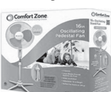
Comfort Zone Fan 16"

We are now accepting Credit & Debit Cards.