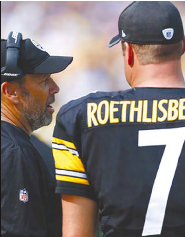
Pittsburgh Steelers quarterback Ben Roethlisberger (7) talks with offensive coordinator Todd Haley during the second half of an NFL football game against the Minnesota Vikings in Pittsburgh, Sunday, Sept. 17, 2017.

lisberger said before later adding “I’m not really worried about guys complaining about wanting the ball. We have a lot of guys that can make plays for us and we just need to make them.” Haley, who must come up with a plan that generates points while also placating the highest-paid wide receiver and highest-paid running back in the league, downplayed the idea there aren’t enough balls to go around. “We got an unselfish group, really,” Haley said. “I’ve said that a number of times. You’re going to see emotional reactions all the time in this game. We’ve got a group that wants to win and that’s what we need to do.” Scoring more would help. The Steelers are tied for 19th in scoring (19.8 points per game) and don’t rank in the top 10 in any major statistical offensive category.