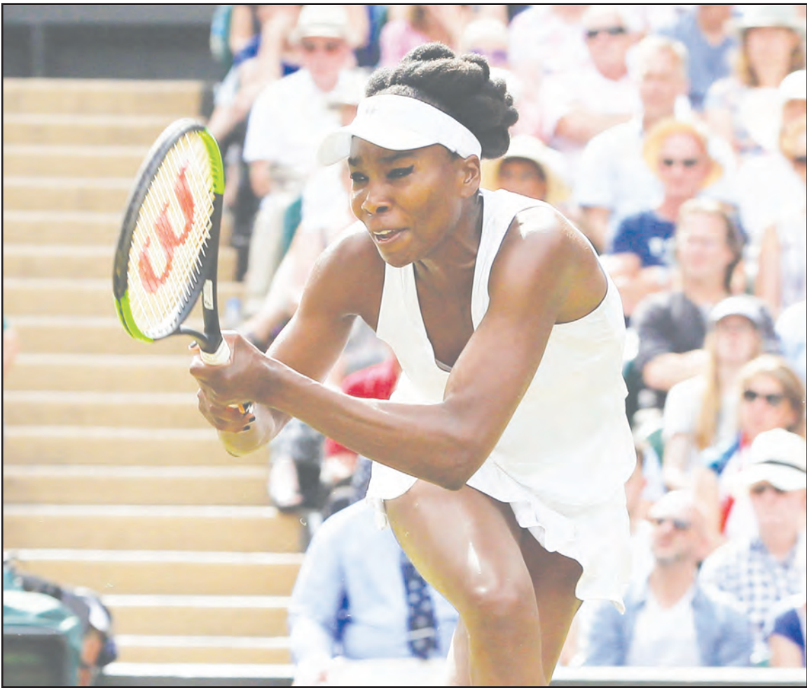
Venus Williams of the United States returns to Britain's Johanna Konta, during their Women's Singles semifinal match on day nine at the Wimbledon Tennis Championships in London Thursday, July 13, 2017.