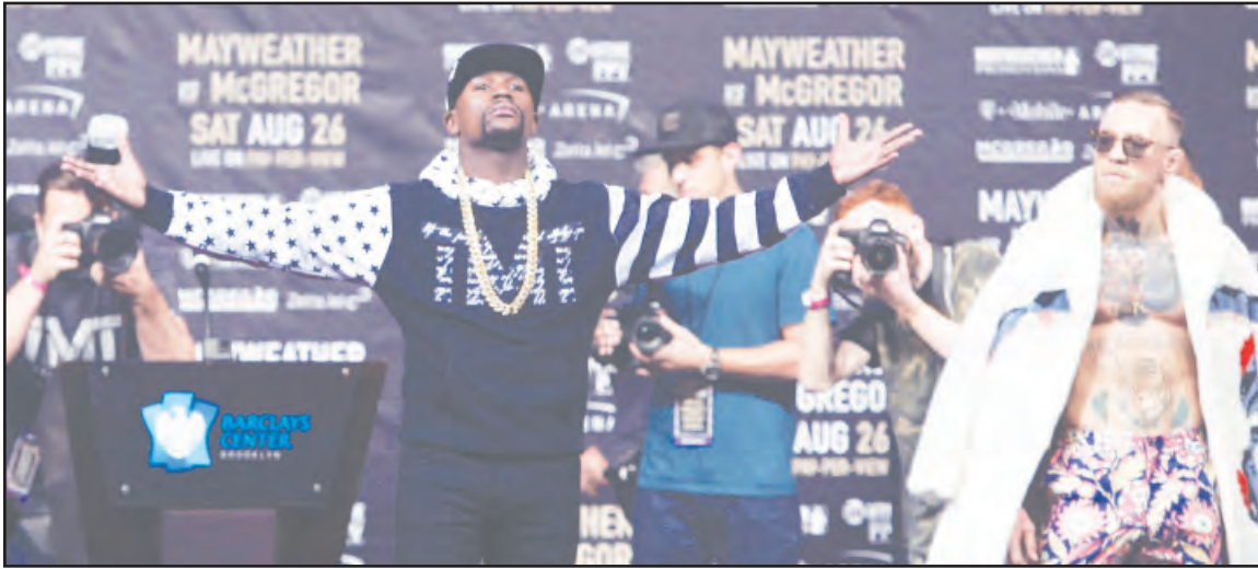
Floyd Mayweather Jr., front left, poses as Conor McGregor, right, watches during a news conference at Barclays Center on Thursday, July 13, 2017, in New York, for their junior middleweight boxing bout next month.

Yes, the hype could go down as a more entertaining time than the 154-pound fight Aug. 26 in Las Vegas. The fighters can entertain as much as anything on Broadway.