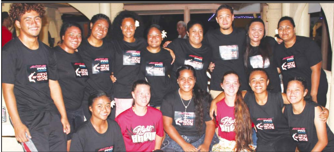
Members of the American Samoa Handball team, along with supporters and coaches, during a fundraising event held over the weekend at Maluu Mai Beach Resort, to send the territory's Under-17 Women's Handball Team to the Youth Olympics later this year in Argentina.

CLASSIFIEDS • CARTOONS • ALOHA BRIEFS & MORE