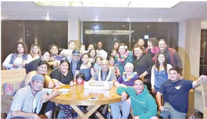
65th Birthday celebration with family in Hawai'i Kai, O'ahu