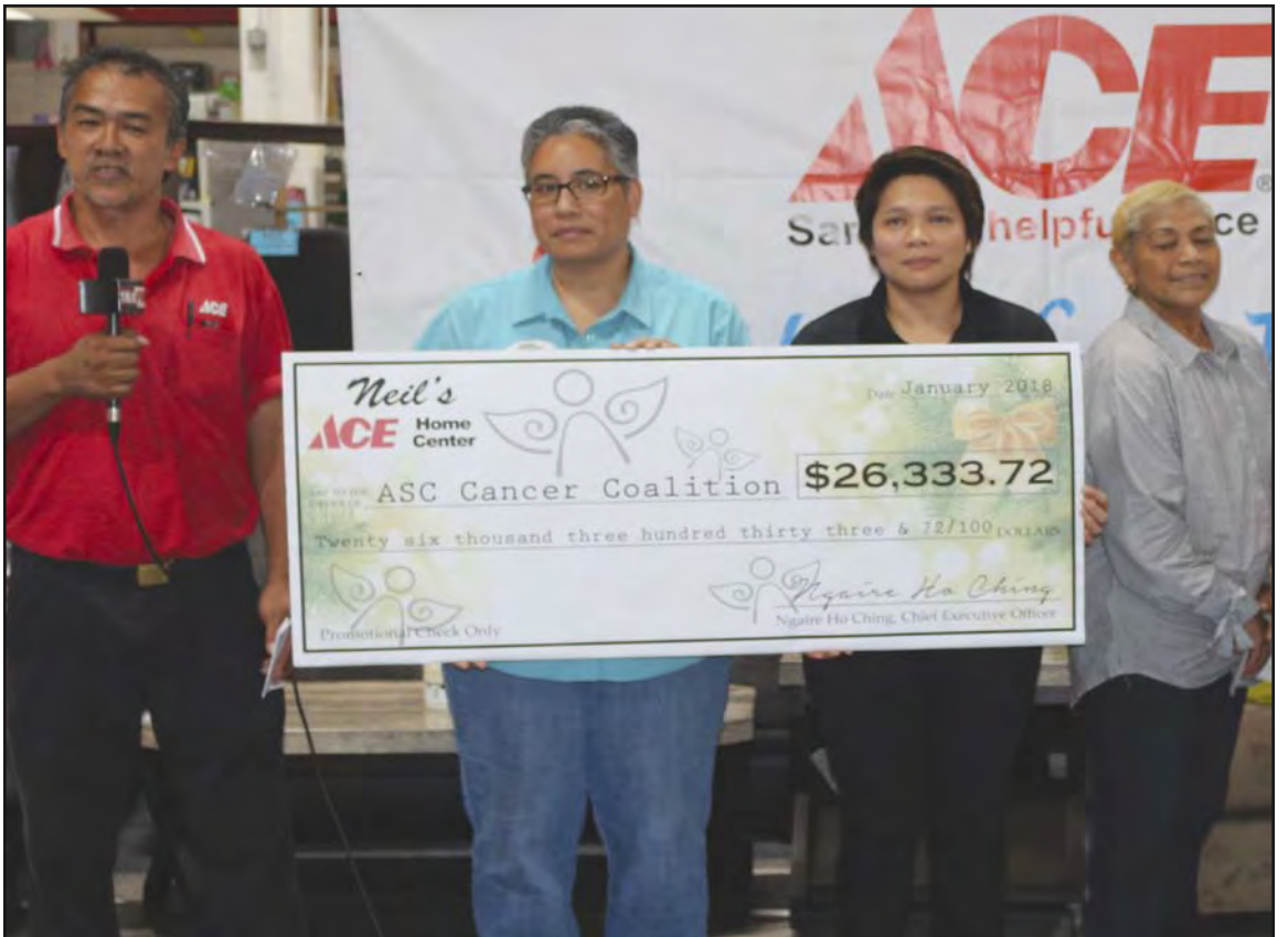
Teniseli Ma'ae o le Ace ua ia saunua fa'afeiloa'i i sui mamalu o le ASCCC na o'o atu e talia le fesoasoani a le latou Kamupani ma latou pa'aga sa fa'atau i lo latou faleoloa o oloa eseese i le vaitau o le Kerisimasi ma le tausaga fou, lea ua tu'ufa'atasia ai le aofaiga e $26,000+ mo i latou o talosagaina se fesoasoani tau tupe ona ua pagatia i le Kanesa.