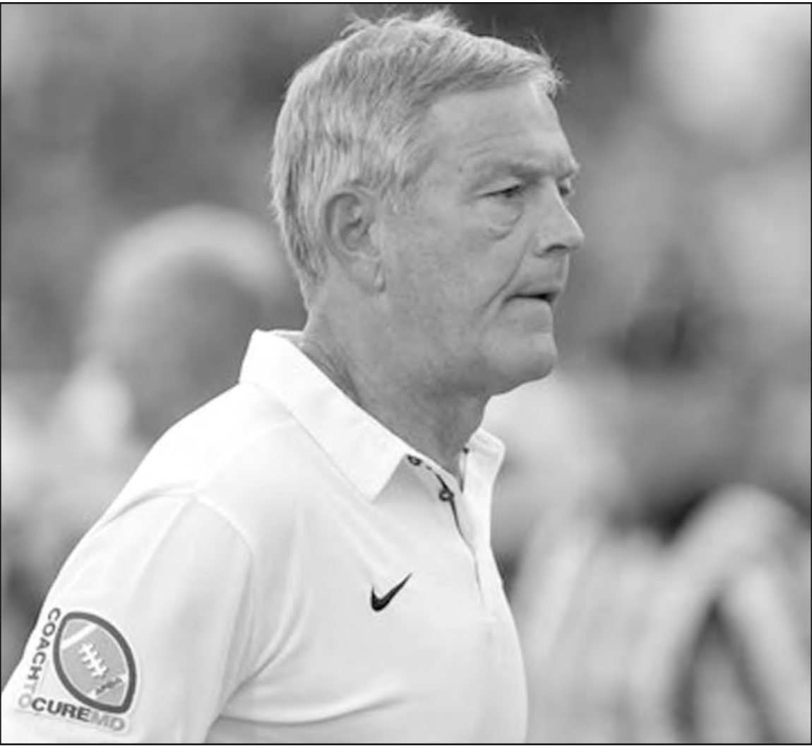
Iowa coach Kirk Ferentz is shown during an NCAA college football game against Michigan State, Saturday, Sept. 30, 2017, in East Lansing, Mich.