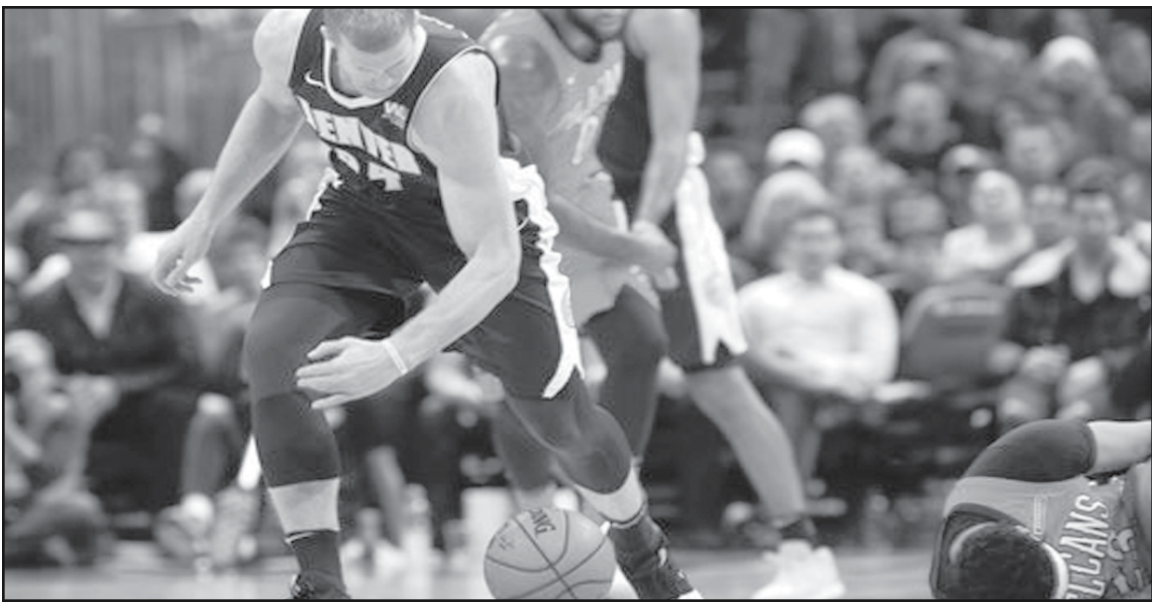
Denver Nuggets center Mason Plumlee, left, picks up a loose ball after New Orleans Pelicans forward Anthony Davis hurt his left ankle as Plumlee defended Davis in the second half of an NBA basketball game Friday, Dec. 15, 2017, in Denver. The Nuggets won 117-111 in overtime.