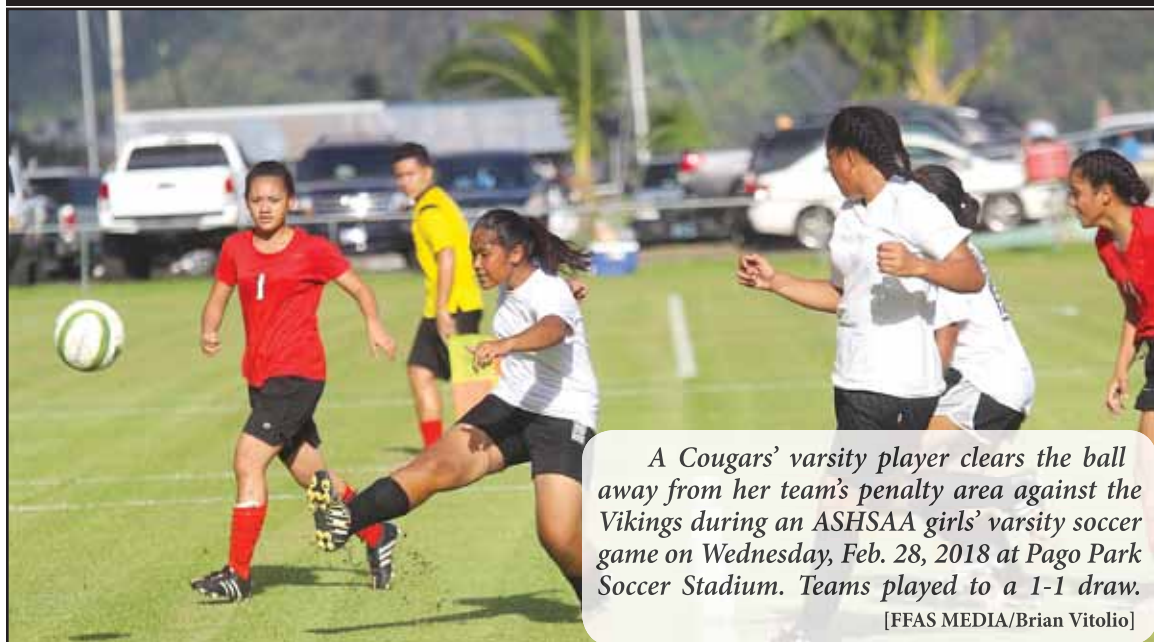
A Cougars' varsity player clears the ball away from her team's penalty area against the Vikings during an ASHSAA girls' varsity soccer game on Wednesday, Feb. 28, 2018 at Pago Park Soccer Stadium. Teams played to a 1-1 draw.

CLASSIFIEDS • CARTOONS • ALOHA BRIEFS & MORE