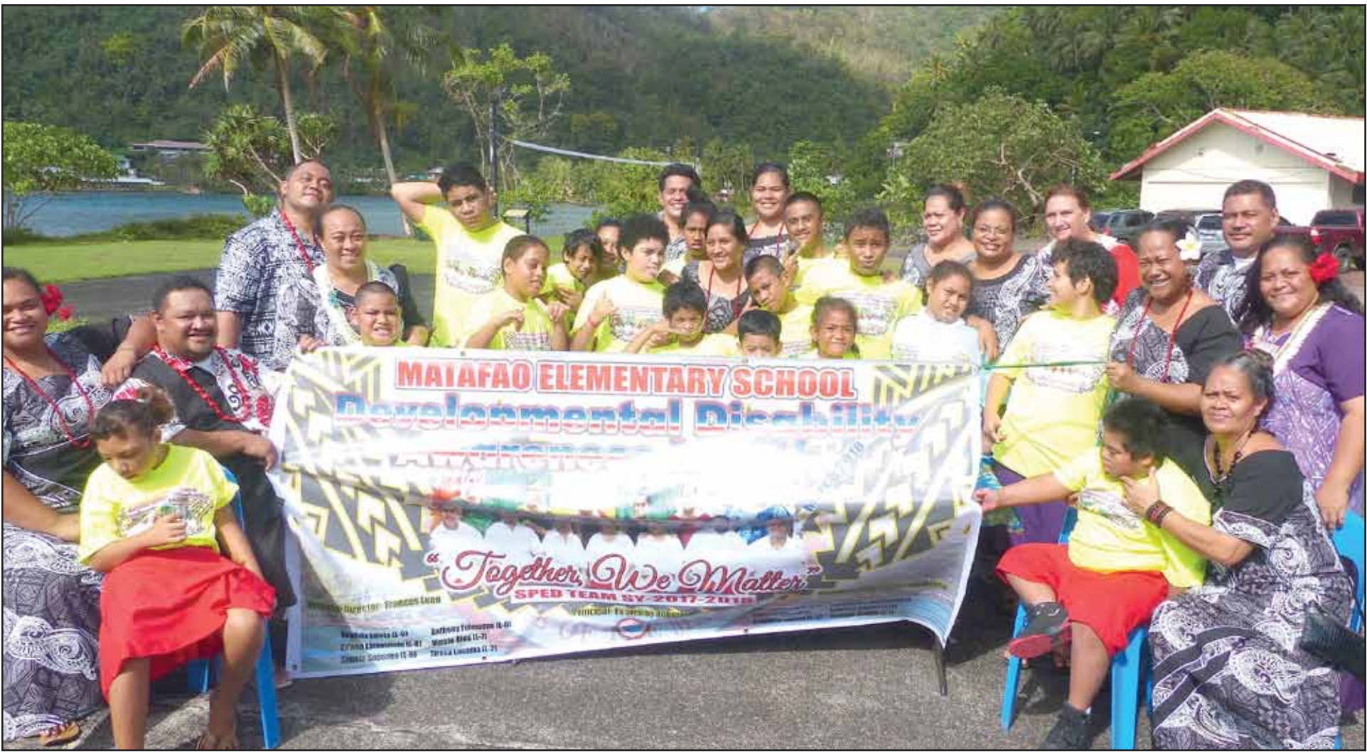
Students from the Special Education Program at Matafao Elementary School were all smiles yesterday during the opening ceremony for Developmental Disability Awareness Month.