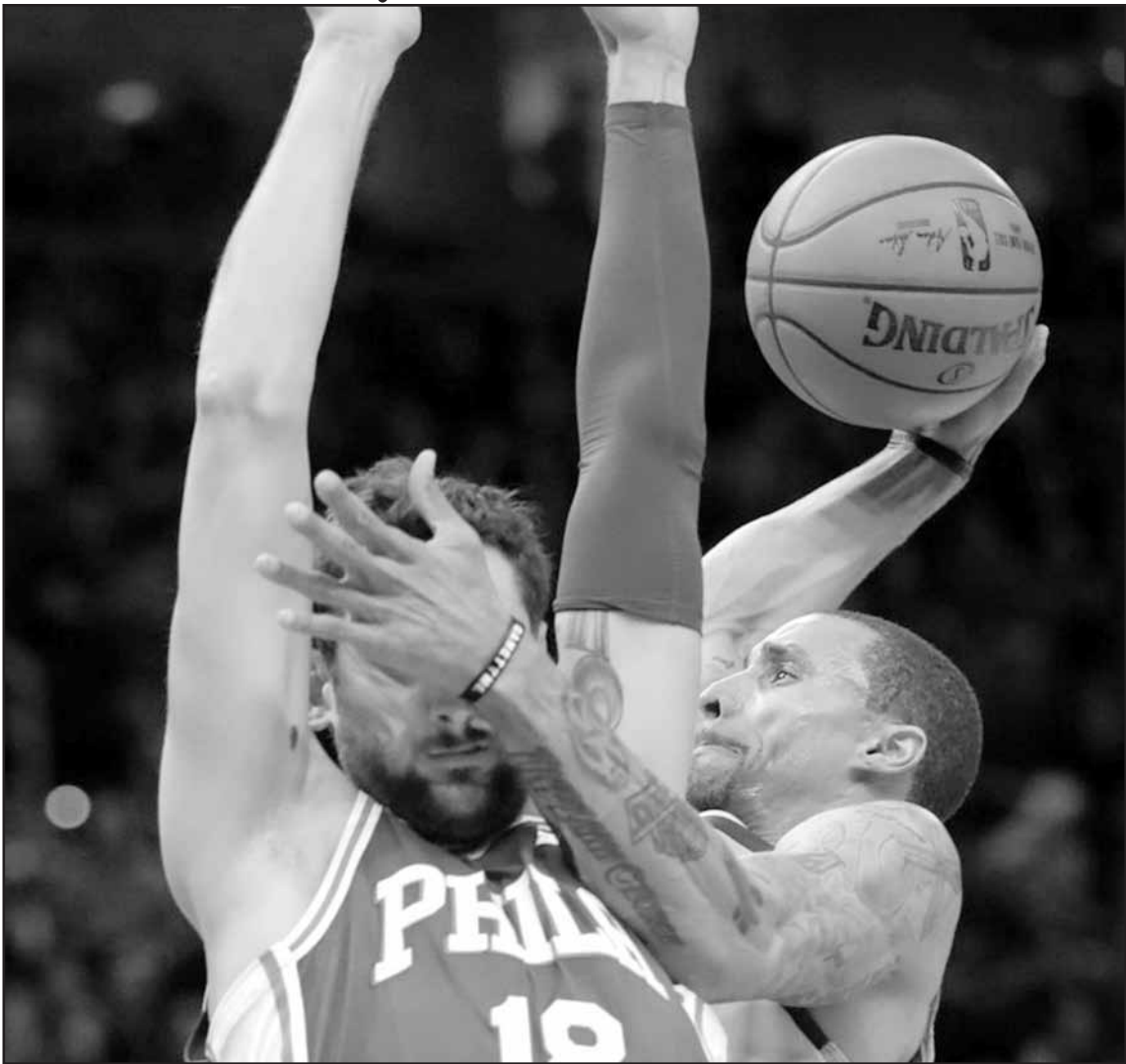
Cleveland Cavaliers' George Hill, right, drives to the basket against Philadelphia 76ers' Marco Belinelli, from Italy, in the first half of an NBA basketball game, Thursday, March 1, 2018, in Cleveland.

ACE HARDWARE IS AN EQUAL OPPORTUNITY EMPLOYER