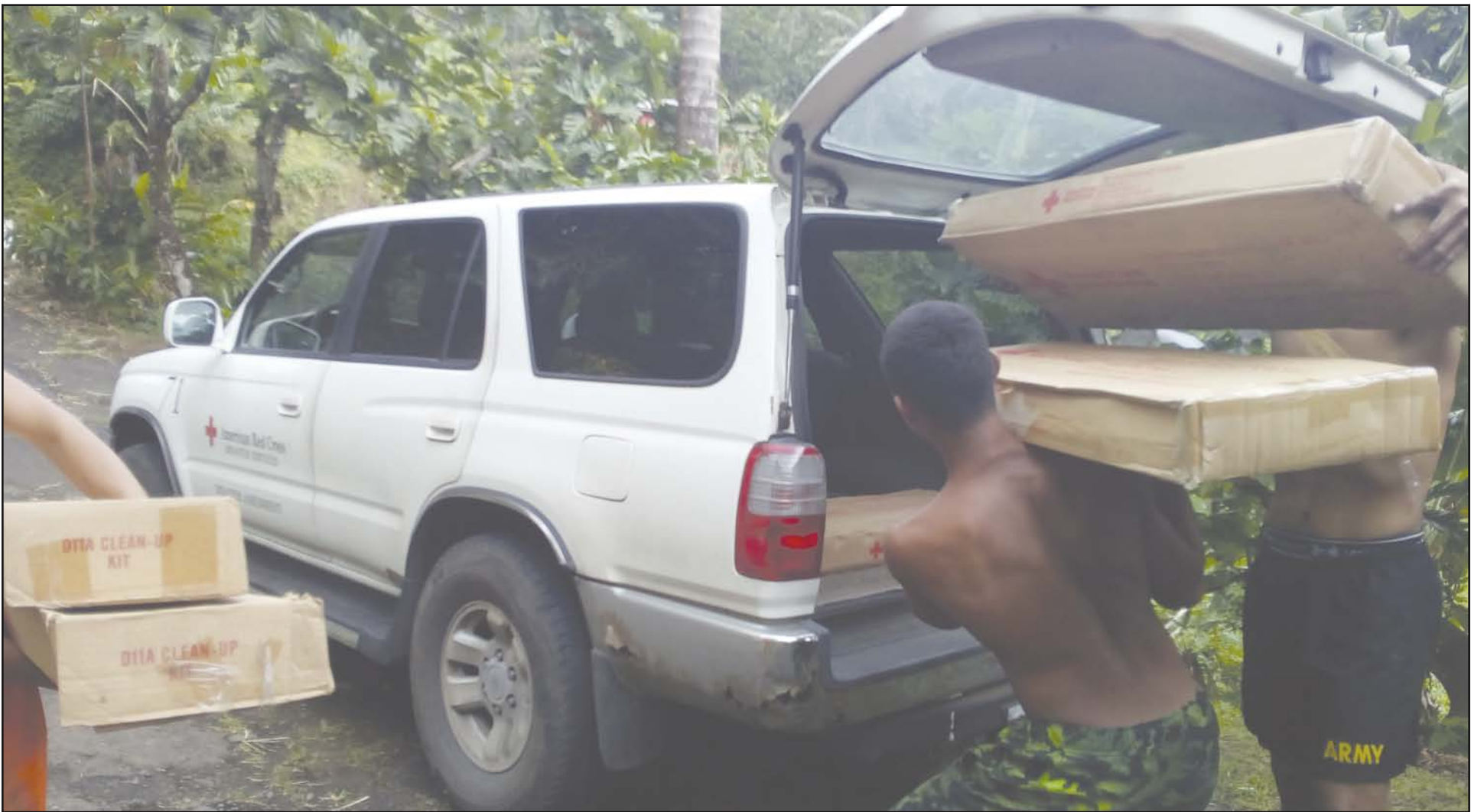
Members of a family in Fagasa, who lost their home in an Aug. 30th fire, carry out of a local American Red Cross vehicle, packages of emergency supplies from the Red Cross. Supplies included folding cots and clean up kits.