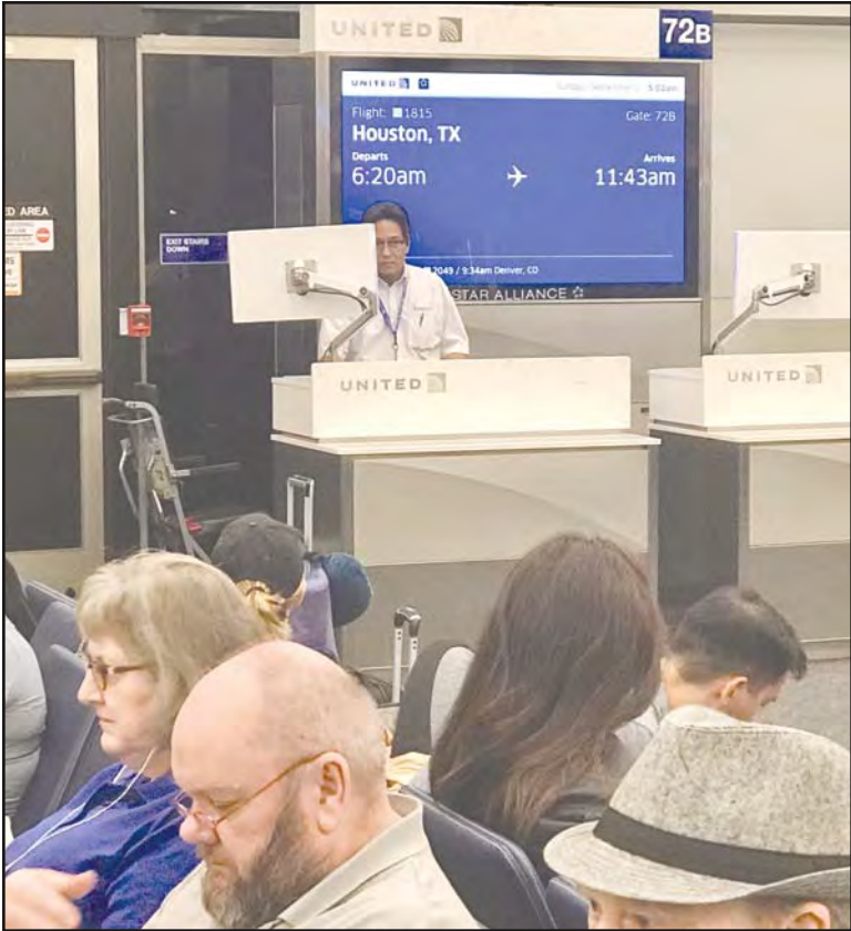
Passengers waited to board a 6:20a.m. flight from LAX to Houston on United Airlines on September 2, 2017. Whether it's to travel to provide assistance or care for relatives, Houston is back in the loop.