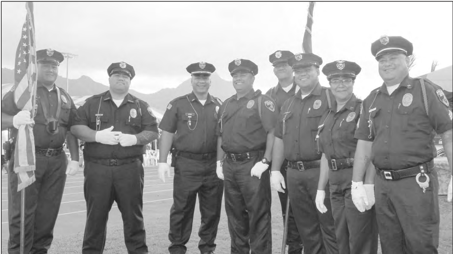
Members of the DPS police honor guard pose for a Samoa News photo before the start of last Friday's Workforce Appreciation Day at Veterans Memorial Stadium at Tafuna.