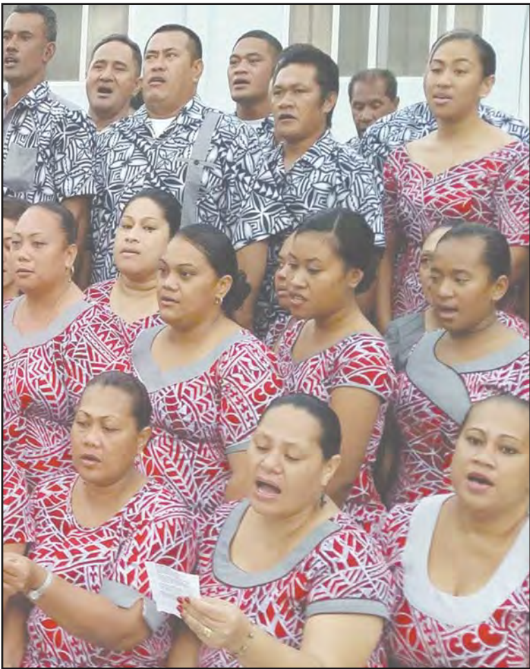
A look at some of the singers who provided hymns during the annual ASG Workforce Appreciation Day celebration, held last Friday at the Veterans Memorial Stadium.