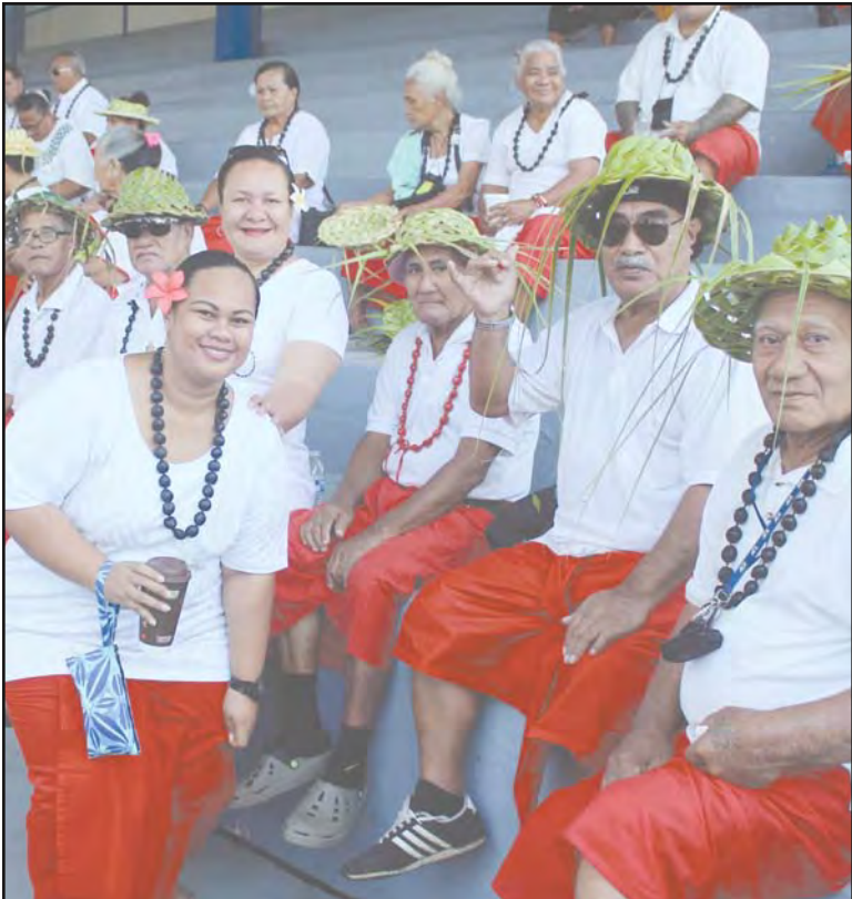
Some senior citizens and TAOA staff, who arrived early at the Veterans Memorial Stadium last Friday, long before the start of the ASG Workforce Appreciation Day, during which the group provided entertainment.