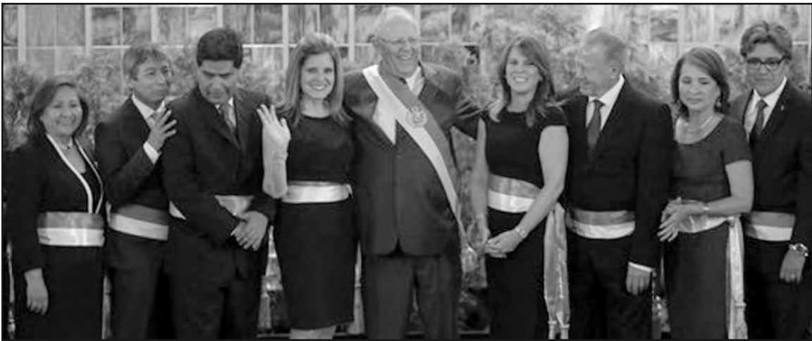
Peru's President Pedro Pablo Kuczynski, center, laughs with part of his new cabinet after a swearing-in ceremony at the government palace in Lima, Peru, Tuesday, Jan. 18, 2018. Kuczynski has named a new "cabinet of reconciliation" following his close brush with impeachment and controversial pardon of a former president convicted of human rights abuses.