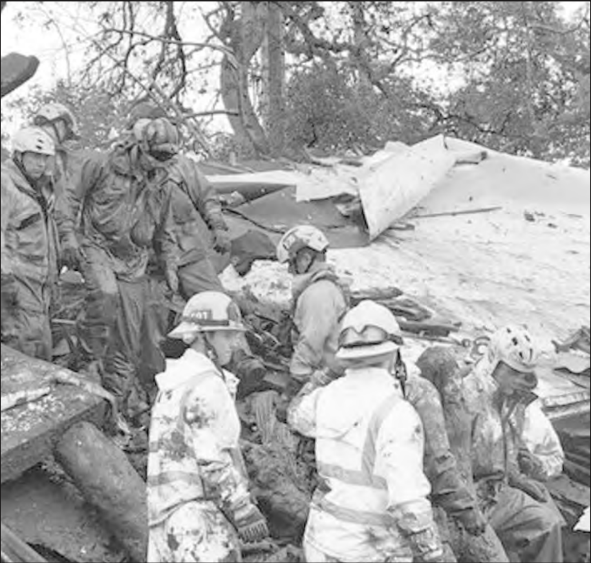
firefighters successfully rescue a 14-year-old girl, right, after she was trapped for hours inside a destroyed home in Montecito, Calif., Tuesday, Jan. 9, 2018. Dozens of homes were swept away or heavily damaged and several people were killed Tuesday as downpours sent mud and boulders roaring down hills stripped of vegetation by a gigantic wildfire that raged in Southern California last month.

“My condolences to everyone, whether in American Samoa, Utah, elsewhere in the U.S., and across the world, as they remember this exceptional life and continue his work. May God bless each of you,” she concluded.