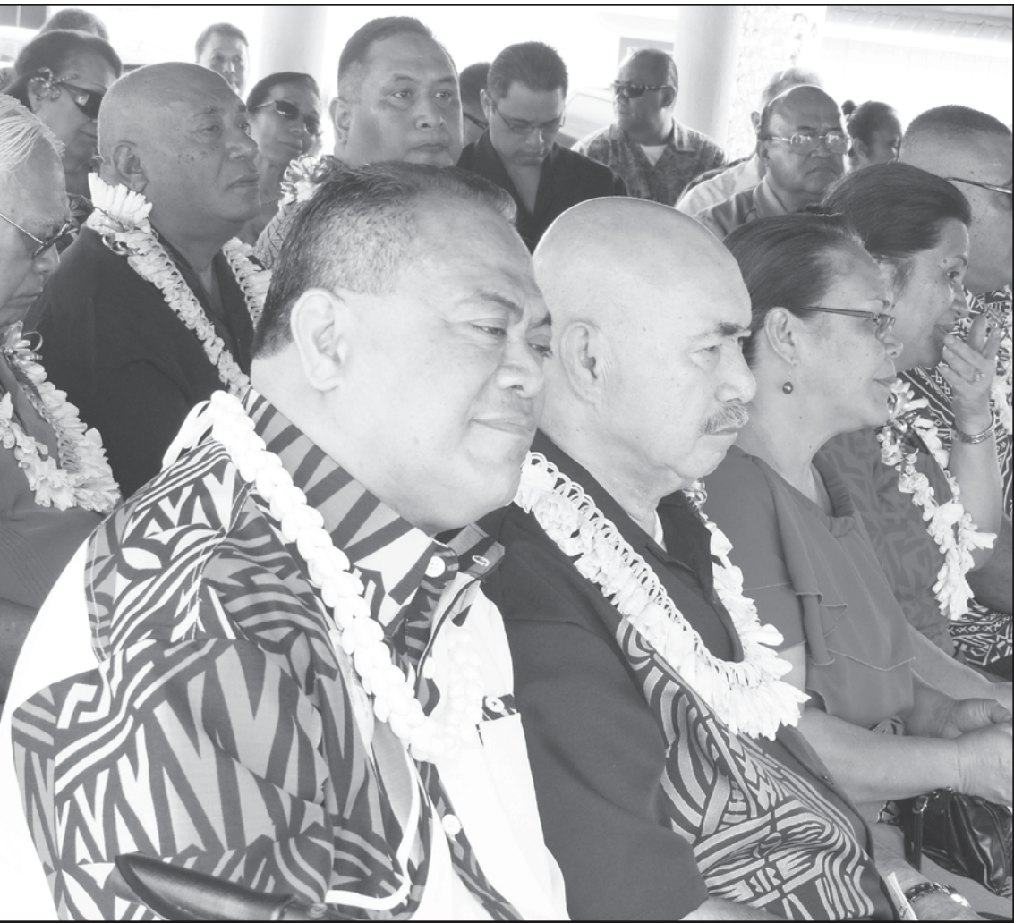
O le nofoaga fa'apitoa o sui mamalu o le Komiti Fa'afae mo Aoaoga Mauafuluga a le tatou Malo i le taimi o le sauniga mamalu e tatala aloa'ia ai le Multi-Purpose Center mo le fanau a'oga.

"O lona tu'ua ai o le galuega, o ni se'evae ua le toe mafaia ona fa'atumu e se tasi o totoe mo le galuega," o le molimau lea a se tasi o e na mulimulita'i i ona tulaga a'ao i le galuega a le Atua.