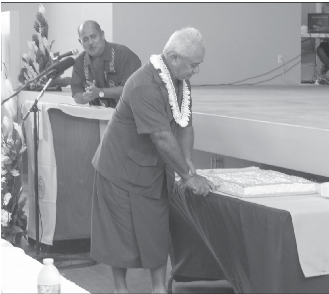
Former Gov. Togiola Tulafono cutting the cake yesterday as part of the ceremony to officially dedicate the new $6.5 million ASCC Multi-Purpose Center. Togiola was governor when the project was in its planning stages.