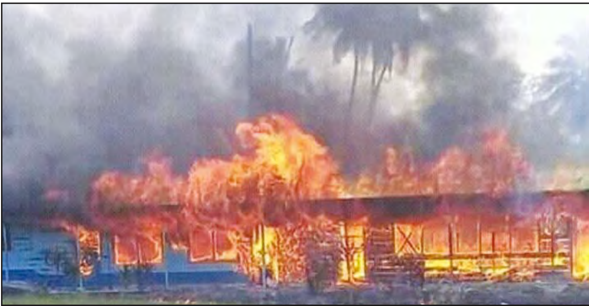
Palalaua college in Siumu went up in flames earlier this week.