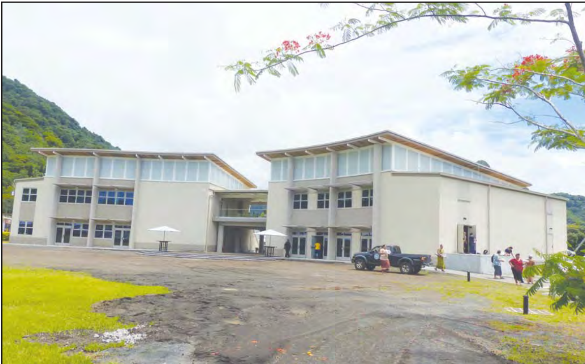
The ASCC Multi-Purpose Center was officially dedicated yesterday morning. The building cost $6.5 million, funded by Capital Improvement Project money. The contractor was Paramount Builders Inc., while the design was by Honolulu-based Clifford Planing & Architecture.