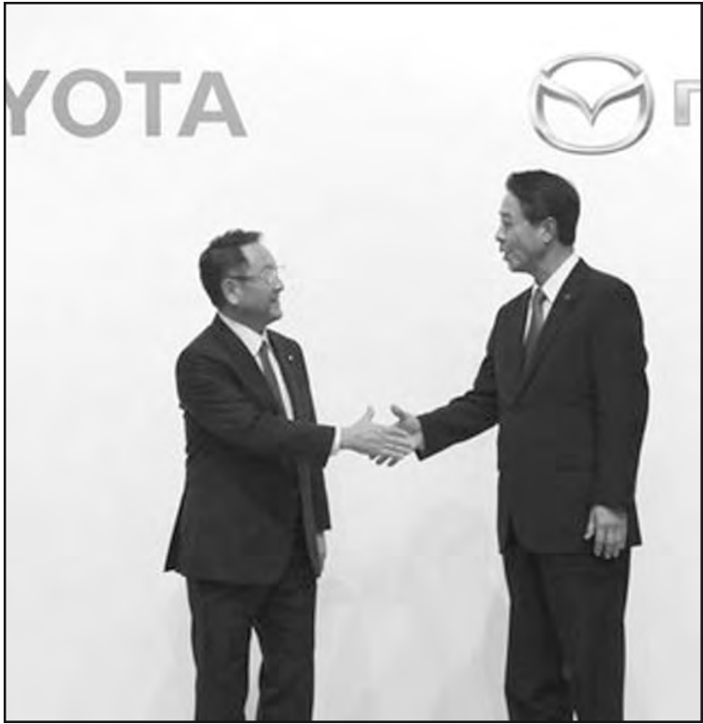
FILE- In this Aug. 4, 2017, file photo, Toyota Motor Corp. President Akio Toyoda, left, and Mazda Motor Corp. President Masamichi Kogai shake hands after a press conference in Tokyo. Japanese automakers Toyota and Mazda have picked Alabama as the site of a new $1.6 billion joint-venture auto manufacturing plant, a person briefed on the decision said Tuesday, Jan. 9, 2018.