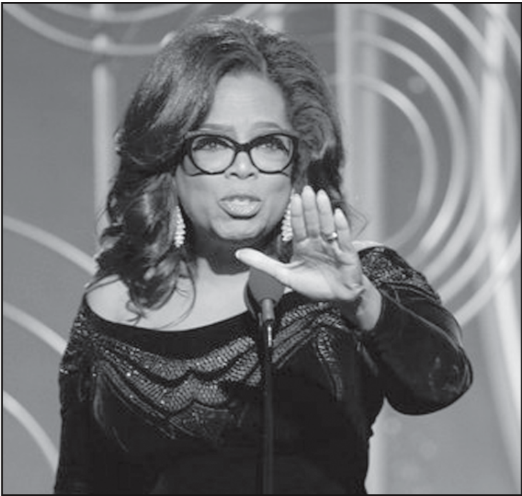
This image released by NBC shows Oprah Winfrey accepting the Cecil B. DeMille Award at the 75th Annual Golden Globe Awards in Beverly Hills, Calif., on Sunday, Jan. 7, 2018.