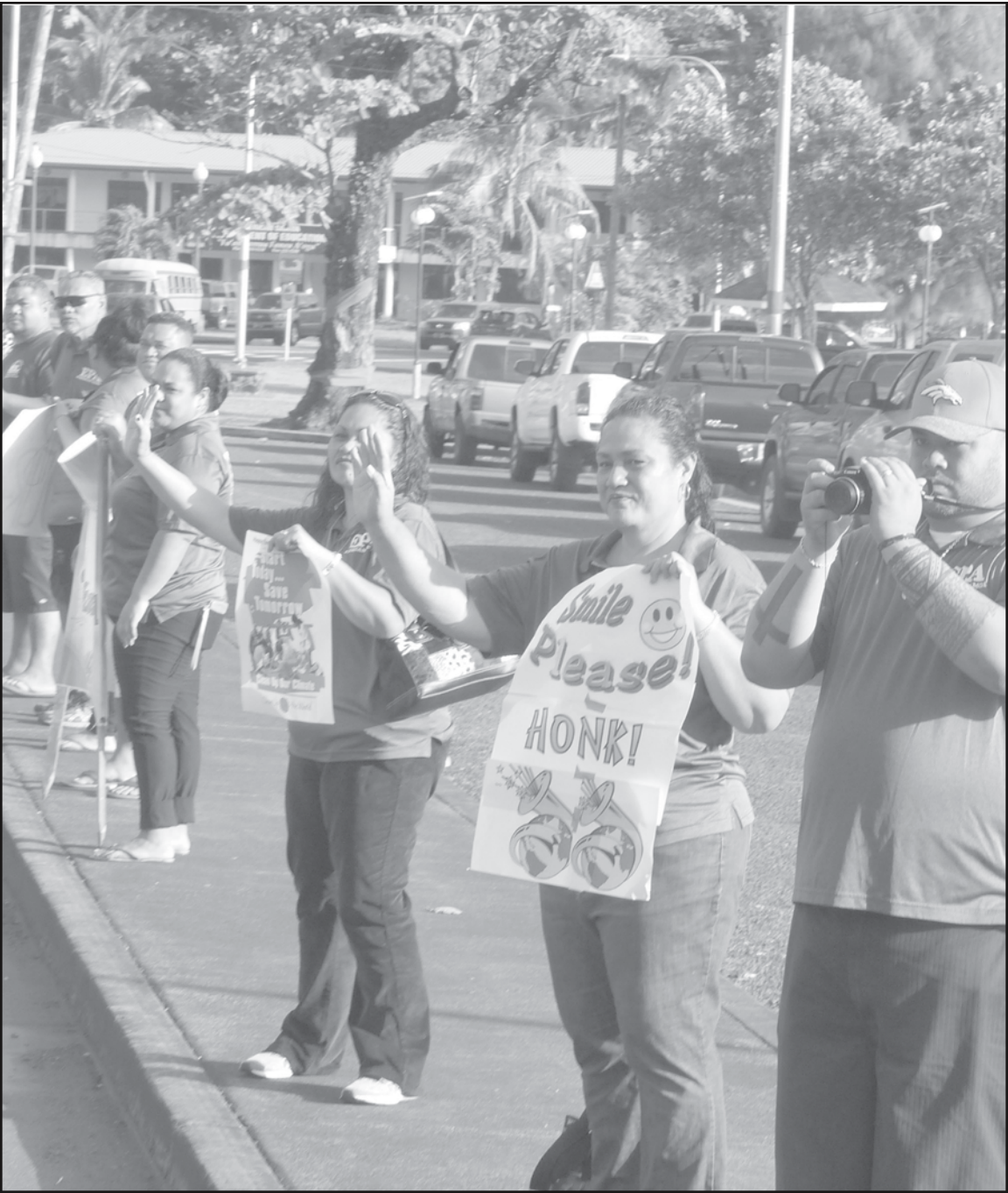
O le ulua’i aso lenei o le vaiaso mo le Fa’atauaina o Lou Siosiomaga. Ua auai uma le Ofisa o le ASEPA i le latou talotaloga sa faia i le Malae o Suigaula a le Atuvasa i Utulei i le taeao ananafi. Vaai i le tala tusia i le lomiga o le aso Lulu.