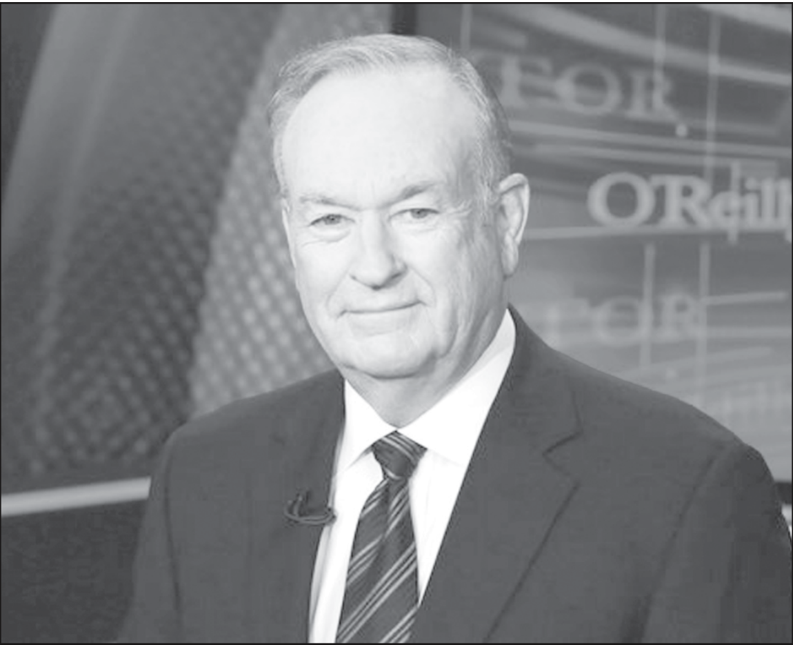
FILE - This Oct. 1, 2015 file photo shows Bill O'Reilly of the Fox News Channel program “The O'Reilly Factor” in New York. The fever over sexual misconduct involving media figures began in the summer of 2016 with Gretchen Carlson’s accusations against Fox News Channel founder Roger Ailes, who was out of a job within two weeks later. Similarly, O'Reilly’s career at Fox imploded quickly in April when The New York Times reported on how much had been paid to settle misconduct allegations against him.

Republican lawmakers and governors around the country targeted the organization after several videos were released by the anti-abortion Center for Medical Progress.