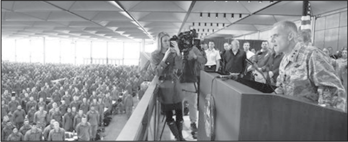
Lt. Gen. Jay Silveria, gives a speech about race relations to U.S. Air Force cadets during lunch, Friday, Sept. 29, 2017 at the Air Force Academy in Colorado Springs, Colo. Silveria, the leader of the Air Force Academy delivered a poignant and stern message on race relations in a speech to thousands of cadets after someone wrote racial slurs on message boards outside the dorm rooms of five black students.

Equal Opportunity Employer / Affirmative Action