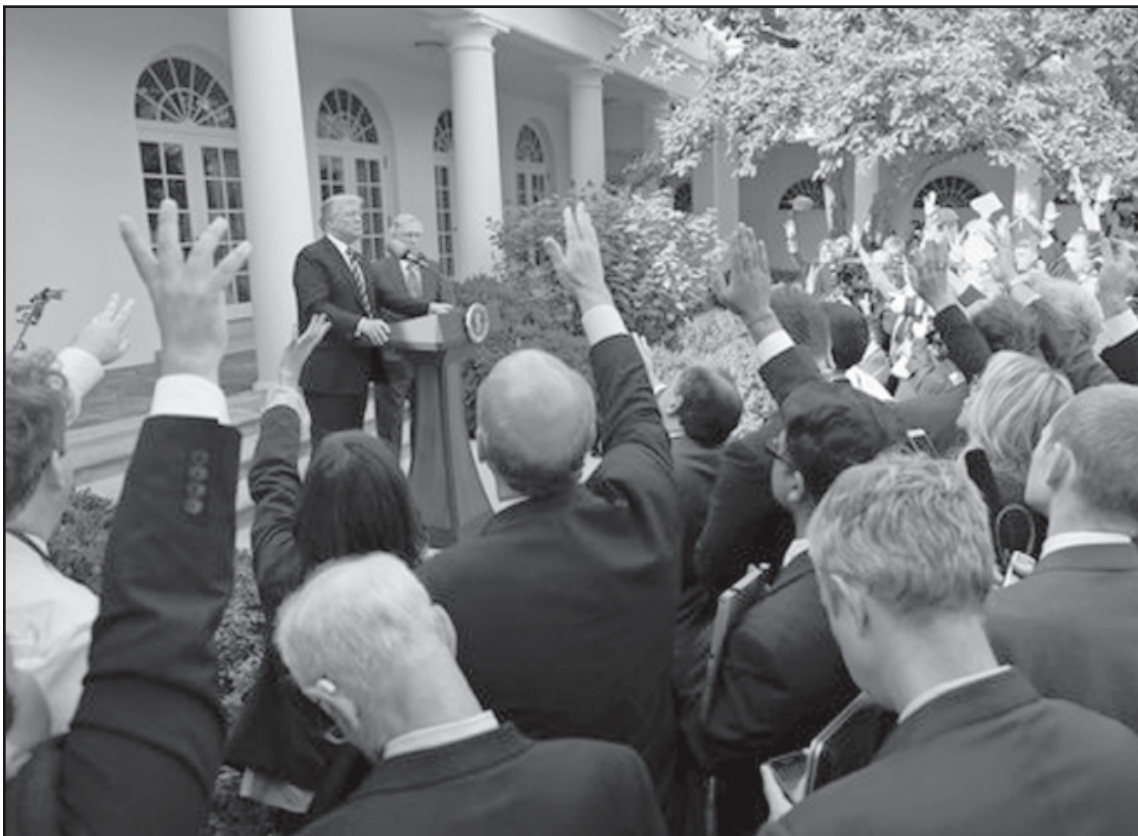
Reporters hold their hands up as they attempt to ask President Donald Trump and Senate Majority Leader Mitch McConnell of Ky., a question in the Rose Garden at the White House, Monday, Oct. 16, 2017, in Washington.