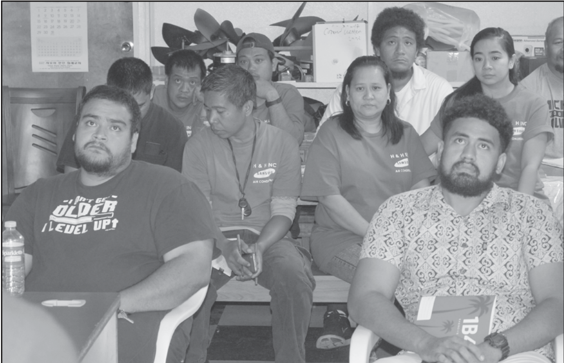
Members of H&H and Samsung Air Conditioning participated in the 2017 Samsung Seminar that was held at their local office in Tafuna.

Samoa News notes that ASH-Cable is minority owned by ASG, as part of its $9 million investment, while Bluesky's off island owner holds the majority share of ownership.