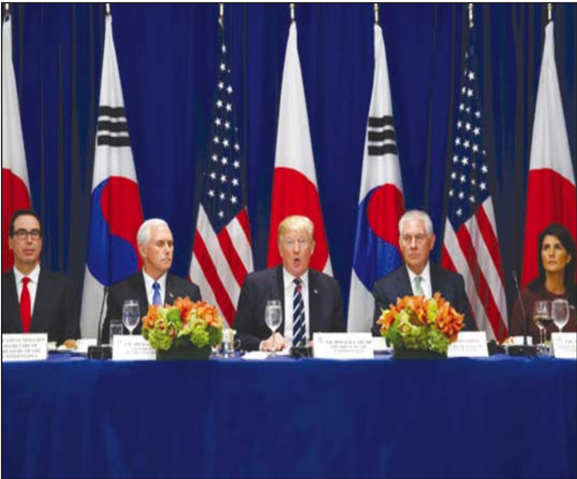
President Donald Trump speaks during a luncheon with South Korean President Moon Jae-in and Japanese Prime Minister Shinzo Abe, at the Palace Hotel during the United Nations General Assembly, Thursday, Sept. 21, 2017, in New York. From left, Treasury Secretary Steve Mnuchin, Vice President Mike Pence, Trump, Secretary of State Rex Tillerson, and US Ambassador to the United Nations Nikki Haley.