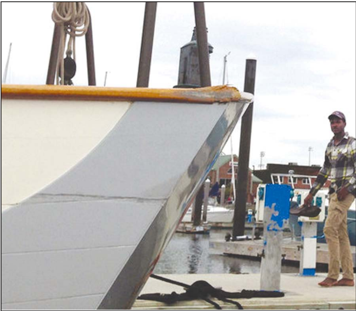
CORRECTS NAME OF THE BOAT FROM MAIN COURSE TO TRADE WIND -- Damage is visible on the boat Trade Wind in Newport Harbor, Monday, Oct. 16, 2017, in Newport, R.I., after it was struck Sunday evening by the tall ship SSV Oliver Hazard Perry, which lost power and began to drift in the harbor.