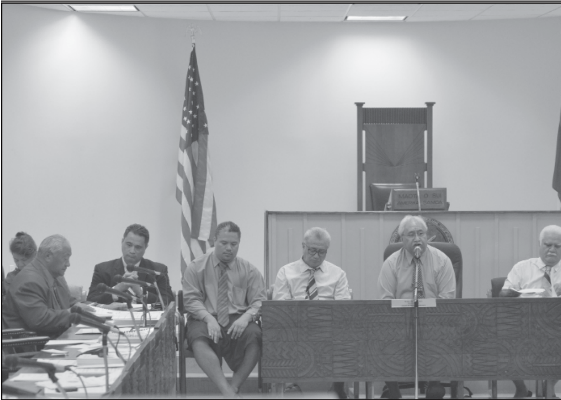
The House Budget and Appropriations Committee held a hearing yesterday with members of the ASG task force to discuss the 7% sales tax. See story for full details.