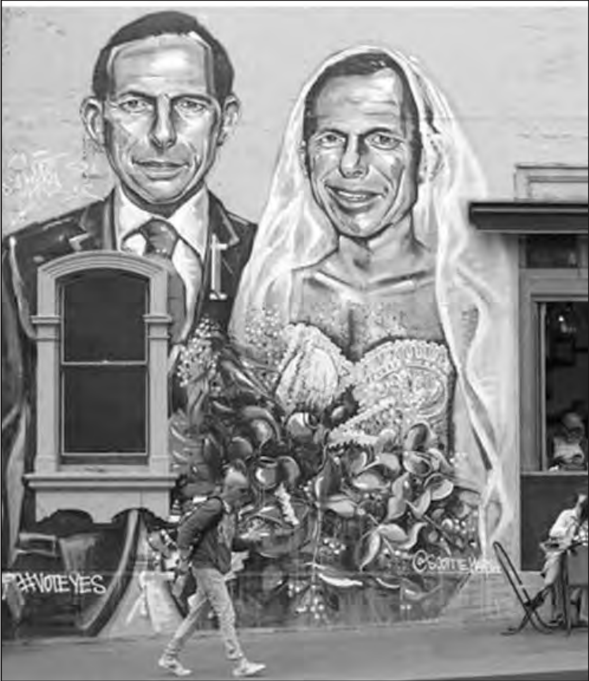
A mural depicting former Australian Prime Minister Tony Abbott during a wedding ceremony where he is both the groom and bride is displayed on a cafe wall in Sydney, Tuesday, Sept. 12, 2017. More than 16 million registered voters among Australia’s population of 24 million will receive ballots in the coming days requesting their opinion on whether same-sex couples should be allowed to wed. Abbott, who remains a government lawmaker, opposes the change.