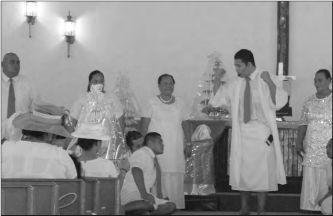
A moving spiritual skit was performed this past Sunday by members of the Ave o le Fetu Ao Methodist Church at Fagaima.

The ASG Revenue Task Force estimates that $3 million is collected annually from the wage tax. Under the hospital's FY 2018 proposed budget, LBJ is forecasting $5 million to be collected from the wage tax, according to budget documents.