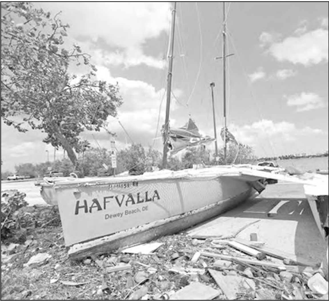
A sailboat washed ashore at Watson Island in the Hurricane Irma aftermath Monday, Sept. 11, 2017 in Miami.

the governor said damage on the southwest coast, including in Naples and Fort Myers, was not as bad as feared. In the Keys, though, he said "there is devastation." "It's horrible, what we saw," Scott said. "I know for our entire state, especially the Keys, it's going to be a long road." He said the Navy dispatched the USS Iwo Jima, USS New York and the aircraft carrier Abraham Lincoln to help with relief efforts. Emergency managers in the islands declared Monday "the Keys are not open for business" and warned that there was no fuel, electricity, running water or cell service and that supplies were low and anxiety high. "HELP IS ON THE WAY," they promised on Facebook.