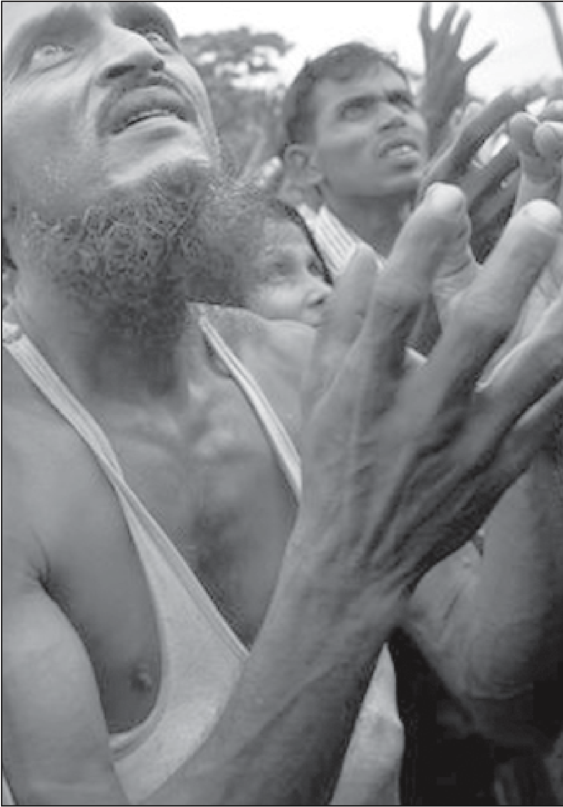
A Rohingya man stretches his arms out for food distributed by local volunteers, with bags of puffed rice stuffed into his vest at Kutupalong, Bangladesh, Saturday, Sept. 9, 2017. With Rohingya refugees still flooding across the border from Myanmar, those packed into camps and makeshift settlements in Bangladesh are becoming desperate for scant basic resources and dwindling supplies. Fights are erupting over food and water. Women and children are tapping on car windows or tugging at the clothes of passing reporters while rubbing their bellies and begging for food.

Before Aug. 25, Bangladesh had already been housing more than 100,000 Rohingya who arrived after bloody anti-Muslim rioting in 2012 or amid earlier persecution drives in Myanmar.