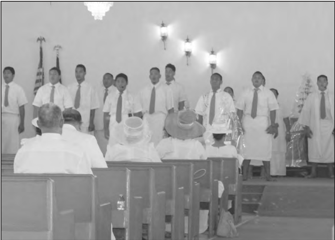
Youth members of the Ave o le Fetu Ao Methodist Church in Fagaima, performing a special skit during service this past Sunday.