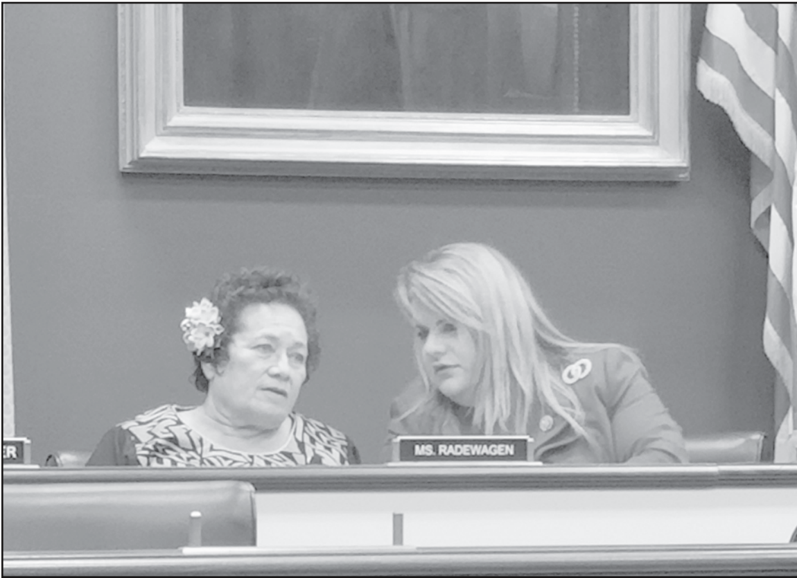
Congresswoman Aumua Amata conferring with Congresswoman Jennifer González-Colón of the territory of Puerto Rico. Aumua has welcomed efforts by the Small Business Committee in examining the need to strengthen small businesses and streamline the federal process of obtaining permits.