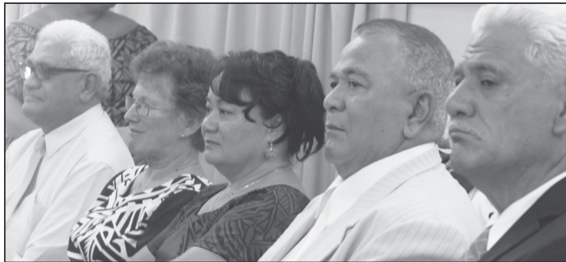
O le va'aiga i nisi o fa'atonu sili sa auai i lea tatalaga aloa'ia o le nofoaiga lona 35 lenei a le fono faitulafono.