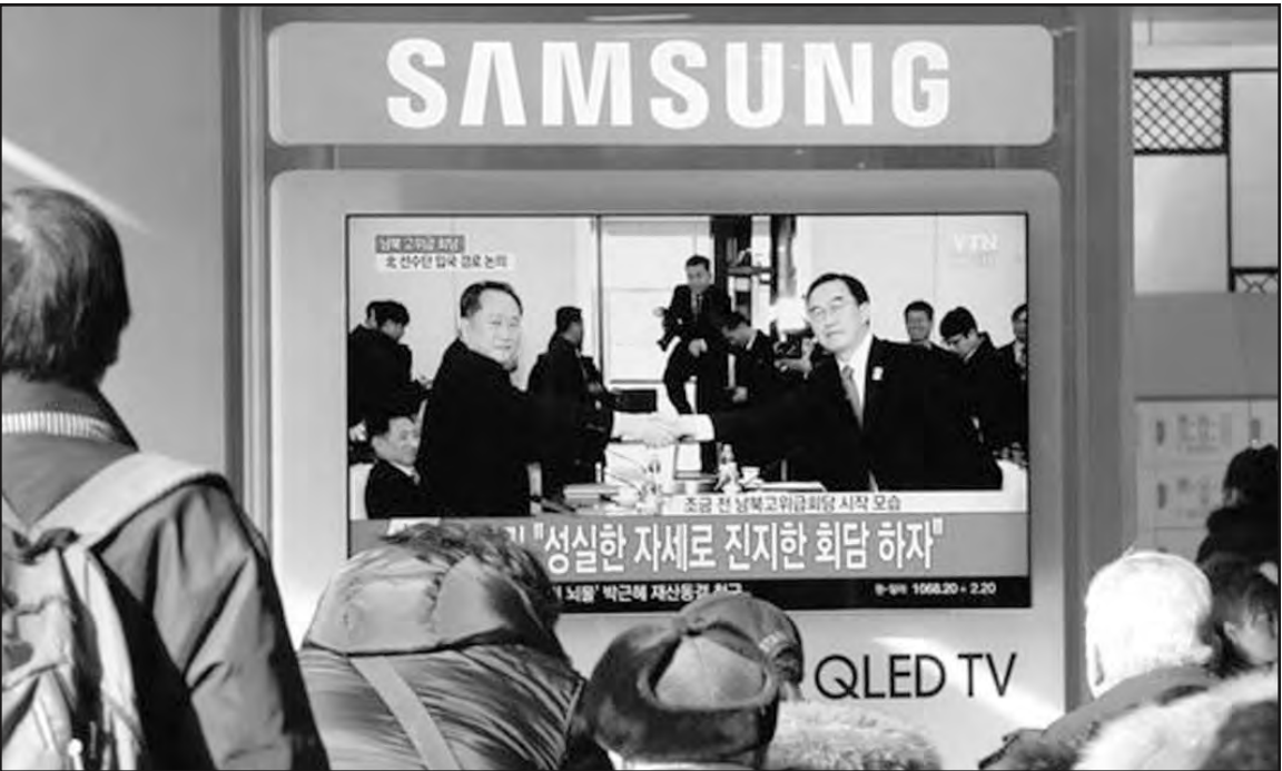
People watch a TV screen showing South Korean Unification Minister Cho Myoung-gyon, right, shakes hands with the head of North Korean delegation Ri Son Gwon during a meeting, at Seoul Railway Station in Seoul, South Korea, Tuesday, Jan. 9, 2018. Senior officials from North and South Korea began the rivals’ first formal talks in about two years Tuesday to discuss how to cooperate in next month’s Winter Olympics in the South and how to improve their long-strained ties. The letters on the screen read: “Let’s start the meeting.”

Suspension of the military drills would be unacceptable for Seoul because that would seriously undermine the alliance with its chief ally the United States, which wants to put more pressures on Pyongyang. The North views the drills as a rehearsal for a northward invasion. “As President Moon has said, the improvement of relations between North and South Korea cannot advance separately from resolving North Korea’s nuclear program,” Brian Hook.