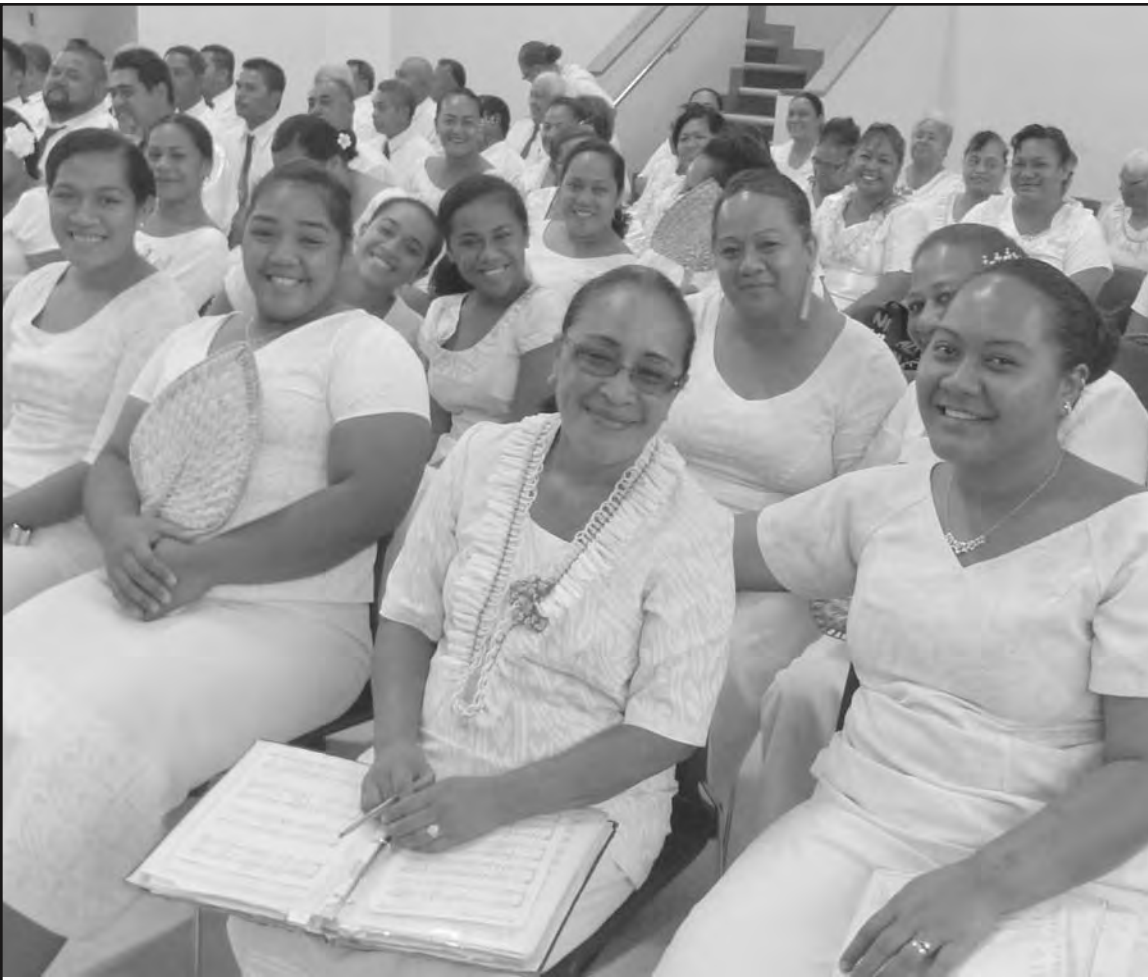
O se va'aiga i le aufaipese siufofoga malie a le EFKAs i Aoloau na malaga atu e vi'ia le Atua i lea sauniga mamalu, tatalaga o le nofoa'iga lona 35 a le Fono Faitulafono a Amerika Samoa. O le latou fa'afeagaiga sa siitia le fa'afetai, tatalo amata ma le tatalo fa'ai'u fa'apea se upu fa'amalosia'u mo ta'ita'i o le atunu'u.