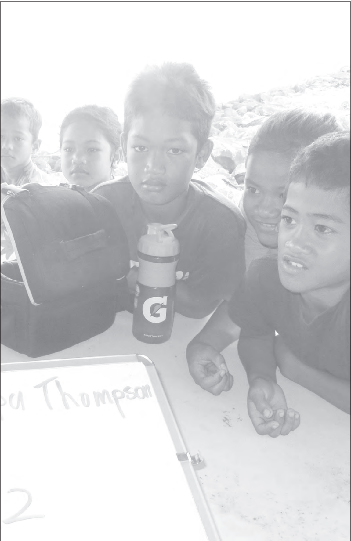
Some of the kids who participated in the Summer Sanctuary Science in the Village (SSSV) program hosted by the National Marine Sanctuary of American Samoa (NMSAS) earlier this month in Aunu’u.

The Klecker Klax is a vital part of my gear for any future CNN Pacific disaster coverage. You military guys know that your gear becomes part of organized chaos in a Coast Guard C-130. Less is so, so much better. The innovative magic and quality are a bargain at $180 for the stainless Klax, $140 for the basic version (attachable with paracord), and for you true Coolios there is a magnificent Titanium version Ti-Klax for $595. Order yours at Kleckerknives.com Check out their solid knives listed on their website... really unique, very strong... and as only you Coolios know, inspired by dreams. We at Cool Stuff having saved all our Samoa News two tala bonuses to pick up my Ti-Klax later this month if ya’ll don’t buy all the stock. You Coolios probably will... and you will use and enjoy the heck out of it!