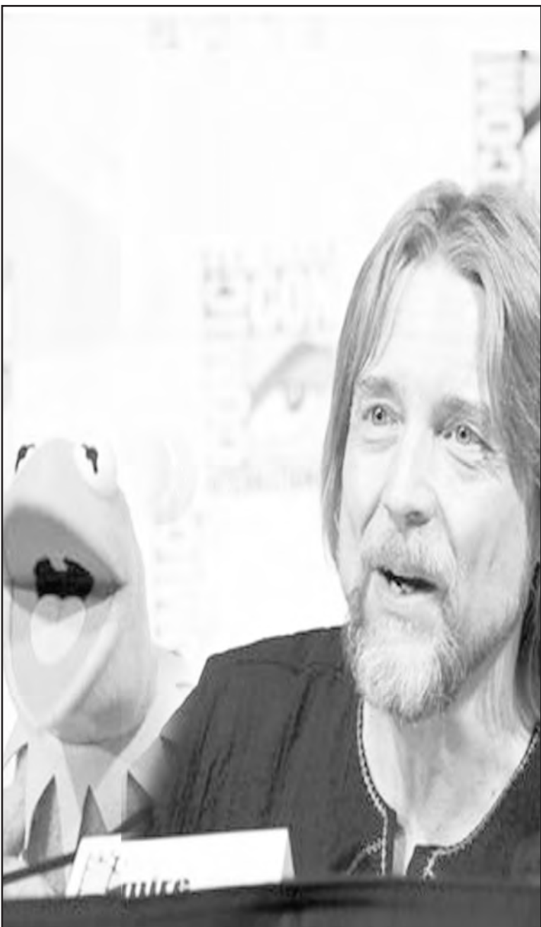
FILE - In this July 11, 2015, file photo, Kermit the Frog, left, and puppeteer Steve Whitmire attend “The Muppets” panel on day 3 of Comic-Con International in San Diego. ABC News and The Hollywood Reporter reported July 10, 2017, that Whitmire is no longer performing the character.

The Tasnim news agency reported later Monday that Fereidoun was released on $15 million bail.