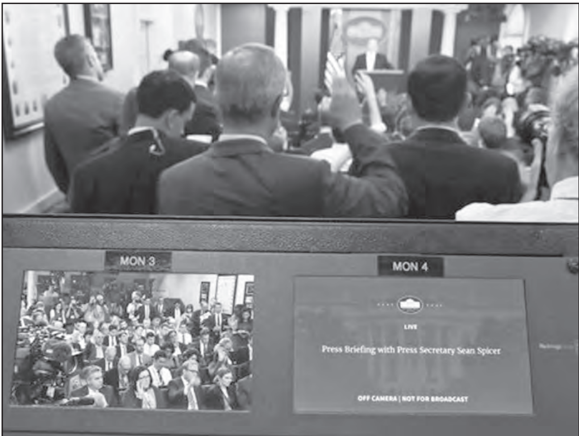
White House press secretary Sean Spicer speaks during an off camera daily briefing at the White House in Washington, Monday, June 26, 2017.