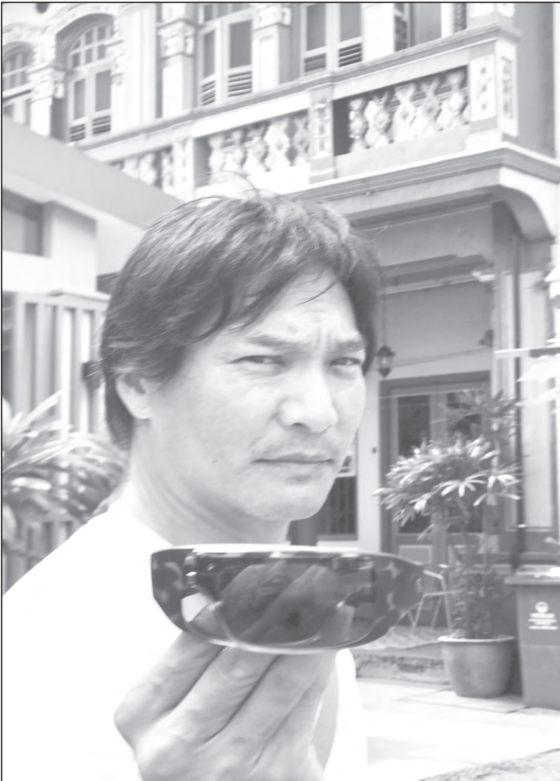
Movie actor, Jason Scott Lee displays the Popgear version of Popticals in Little India, Singapore.