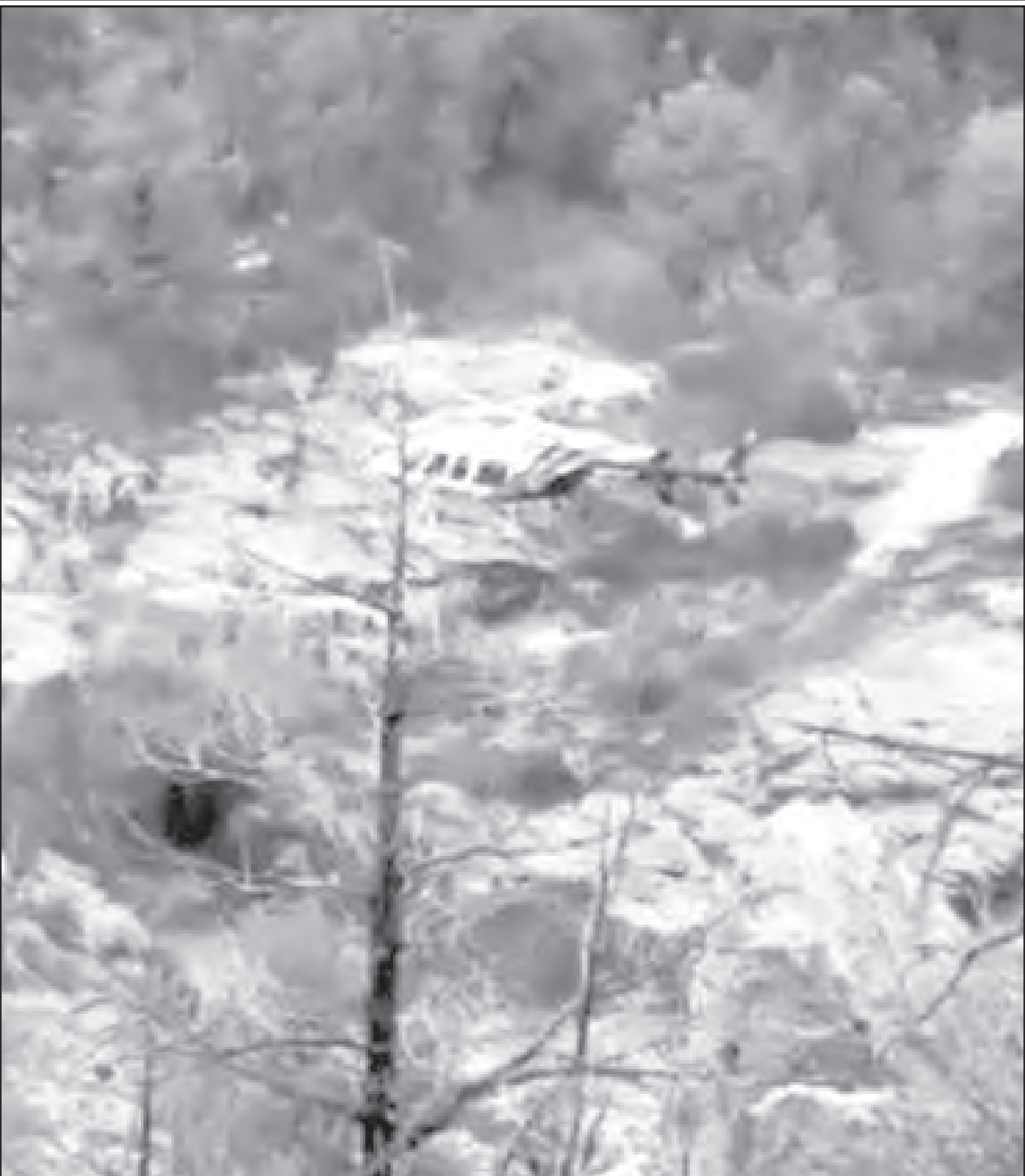
This Saturday, July 15, 2017, image taken from video provided by Mindy Russell shows a rescue helicopter picking up people who survived a flash flood at a popular swimming hole that swept several people to their deaths in the Tonto National Forest near Payson, Ariz. The flooded area is at lower right. The flood was the result of a thunderstorm that dumped heavy rainfall just upstream, unleashing 6-foot-high floodwaters, dark with ash from a summer wildfire.

Muller began making a video with his phone from the river bed, and comfortably scampered to the bank before water clogged with debris whooshed past. The river was wide enough that the water was not the inescapable wall it