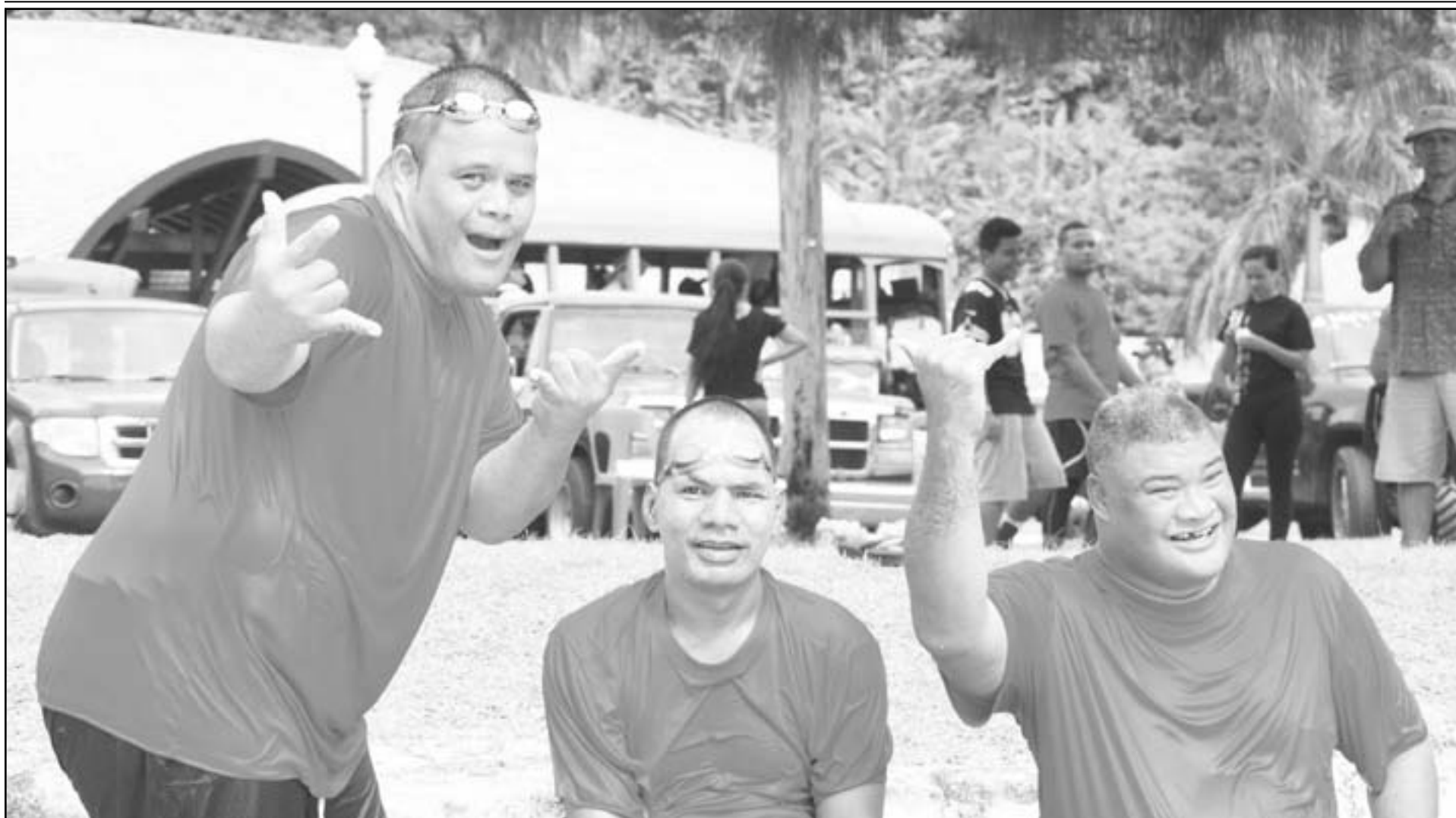
Three athletes with special needs excitedly pose for the camera after racing in one of the heats of the first adaptive aquatic swim meet in American Samoa held last Saturday in Utulei.