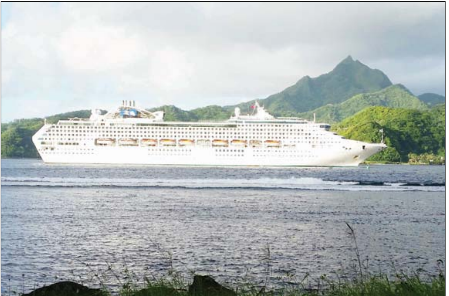
The Sea Princess, carrying an estimated 3,000 passengers and crew members docked at the Fagatogo wharf for several hours last Thursday. Pictured is the cruise ship as it made its way into the Pago Pago Harbor at 7:30a.m. In the background is beautiful Matafao Mountain.

Meanwhile efforts to get a comment from the owner of Asian Pacific Engineering & Construction Services (APECS) Company in Malaeimi who was contracted by Manu’a’s Store for their crane services to build their warehouse has been unsuccessful. Unconfirmed reports say the crane operator was also injured during the electrocution incident.