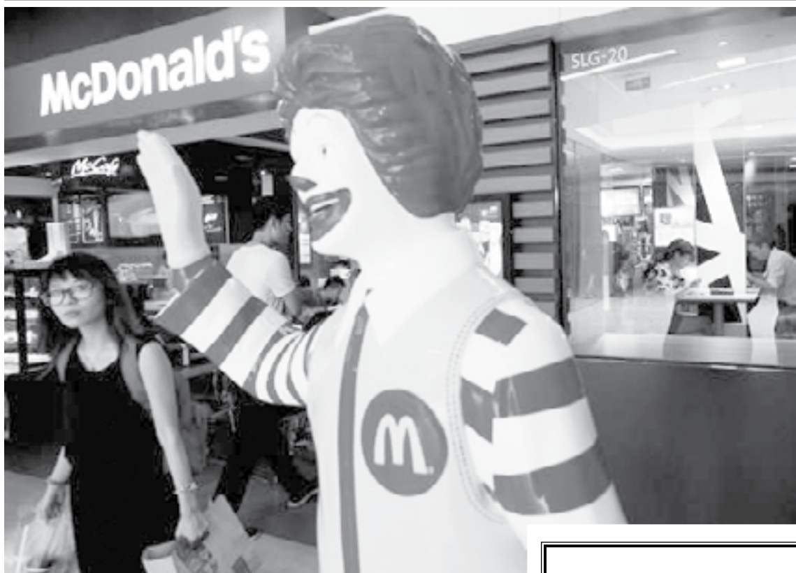
FILE - In this July 31, 2014, file photo, a customer walks past a statue of Ronald McDonald on display outside a McDonald's restaurant in Beijing. Fast food giant McDonald's said in a statement Monday, Jan. 9, 2017 it is selling a controlling stake in its China business to a group of investors led by state-owned Chinese conglomerate Citic in a deal worth up to $2.1 billion.