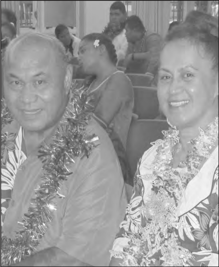
O nisi o le galuega i Ma’ama’a CCCAS lea sa auai atu i le latou pesega o le Kerisimasi 2017, malo le fai o le faiva.