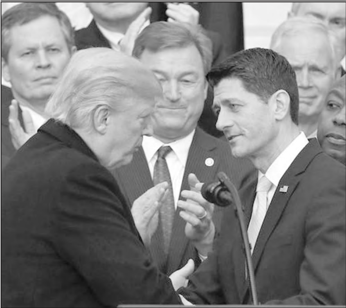
President Donald Trump shakes hands with House Speaker Paul Ryan of Wis., during an event to acknowledge the final passage of tax overhaul legislation by Congress on the South Lawn of White House in Washington, Wednesday, Dec. 20, 2017.