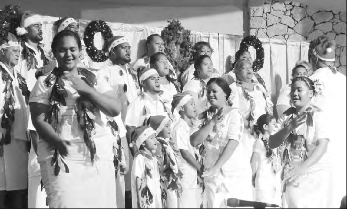
O se vaaiga i le taimi na oso ai le skid a Alao Catholic i le taimi o le latou pesega o le Kerisimasi 2017.