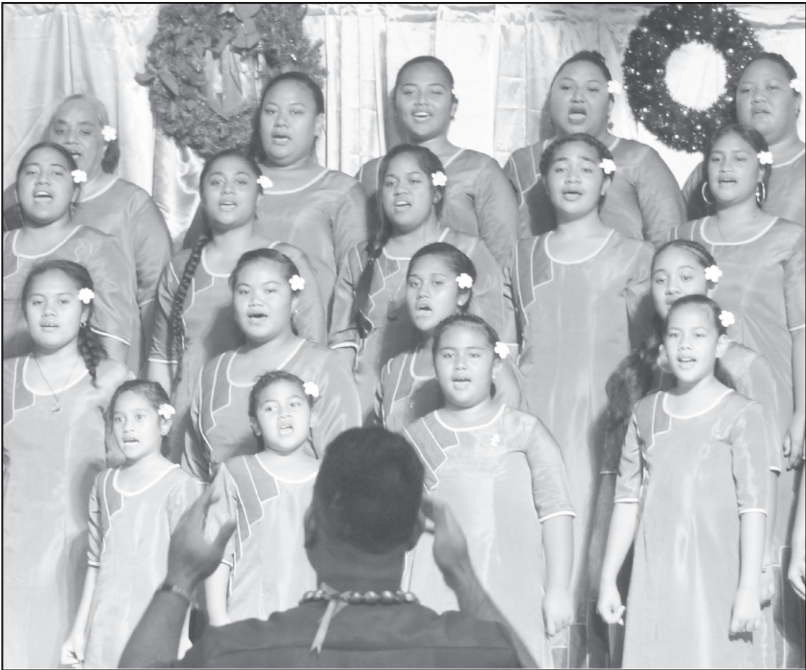
Female members of the Vaitogi CCCAS choir performed Tuesday night at the Gov. H. Rex Lee Auditorium during the third night of the 40th Annual Territorial Holiday Music Festival sponsored by the Arts Council of American Samoa, and funded by the National Endowment of the Arts with additional funding from Special Programs under the Governor's Office. The program ended last night.