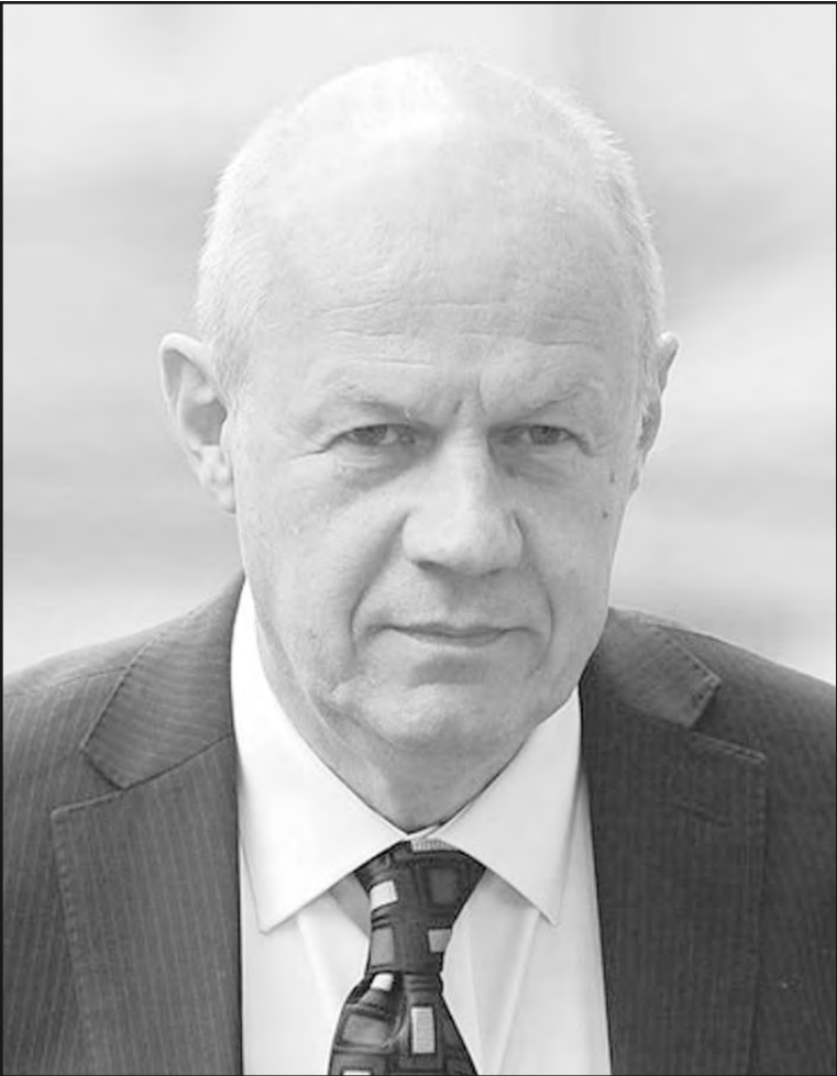
FILE - A Dec. 1, 2017 file photo of First Secretary of State, Damian Green, in London. Damian Green has been asked to resign from the Government by Prime Minister, Theresa May, Wednesday, Dec. 20, 2017, and admitted he made “misleading” statements about allegations pornography was found on his Commons computer in 2008.

Green had claimed earlier he was the victim of a smear campaign. The pornography was found on his office computer during a police investigation of government leaks. The Cabinet investigation did not yield a conclusion about sexual misconduct allegations writer Kate Maltby made against Green.