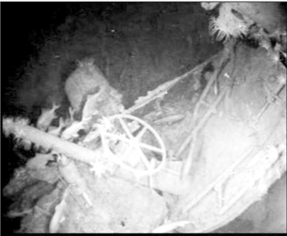
In this undated image provided by the Australian Department of Defense, fish swim around the helm of the Australian submarine HMAS AE1 off the coast of the Papua New Guinea island of New Britain. One of Australia's oldest naval mysteries has been solved after the discovery of the wreck of the country's first submarine more than 103 years after its disappearance in World War I.

"This case is not about physician who holds discriminatory animus toward HIV+ patients," the lawyers wrote. "Importantly, this case is not about fear of infection by the physician or his staff when treating HIV+ patients." The lawyers called it an instance of judicial first impression and noted the government did not cite any U.S. case in which a court had applied the ADA or federal or local law to overrule a physician's medical decision not to treat an HIV-positive patient. The judge acknowledged the issue had not been addressed before in the courts but said there was precedent in a Supreme Court case that found a teacher living with tuberculosis was unjustly fired. In that case, the trial judge did not conduct an individualized inquiry into the health risks, if any, posed by the teacher's disease. Torres wrote that the medical practice at Advanced Cosmetic Surgery violated federal law in HIV-related cases by failing to investigate whether drugs taken by the three men would threaten health as a result of surgery.