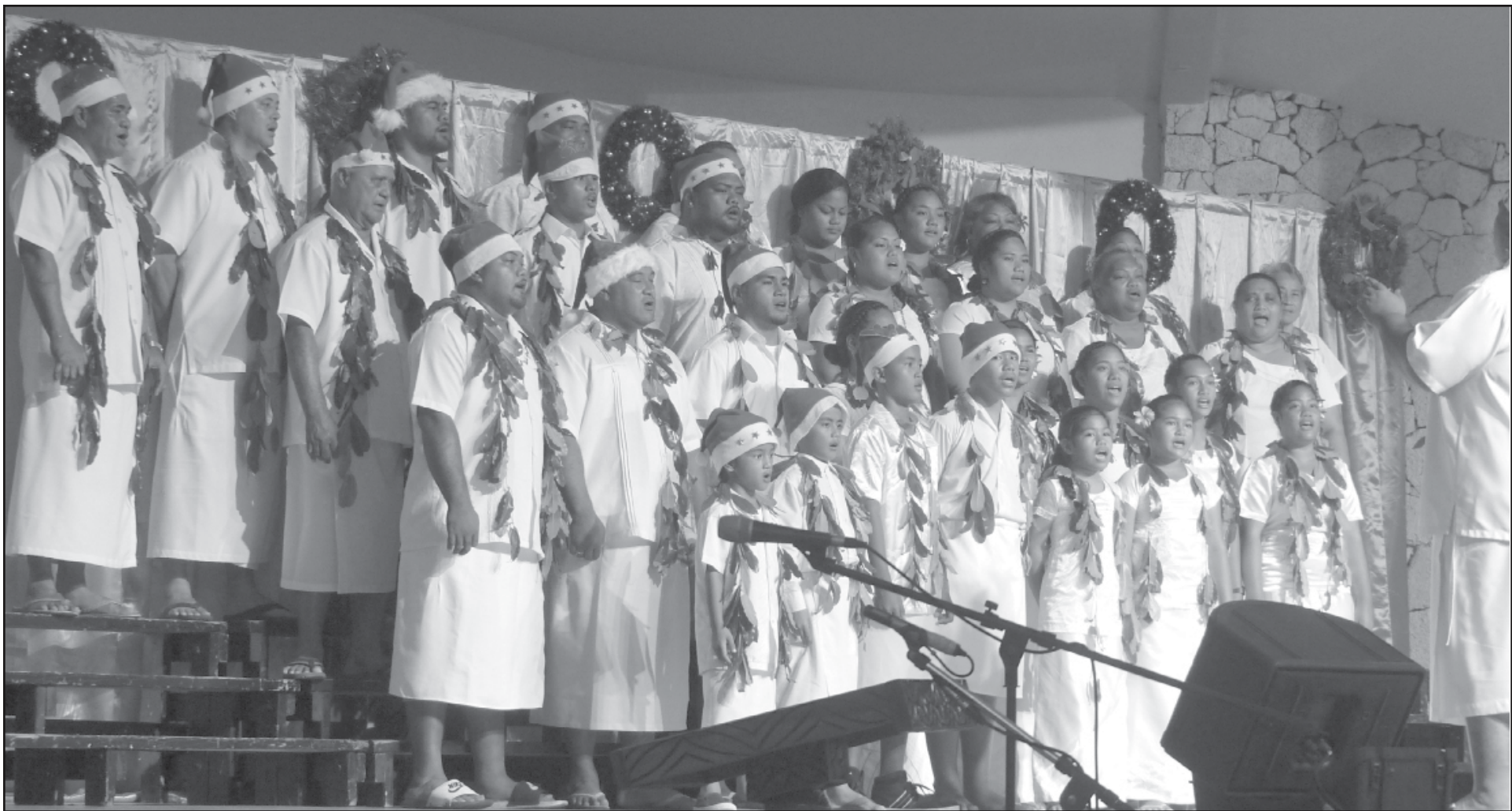
Alao Catholic Church choir performed Tuesday night at the Gov. H. Rex Lee Auditorium during the third night of the 40th Annual Territorial Holiday Music Festival sponsored by the Arts Council of American Samoa, and funded by the National Endowment of the Arts with additional funding from Special Programs under the Governor's Office. The program ended last night.