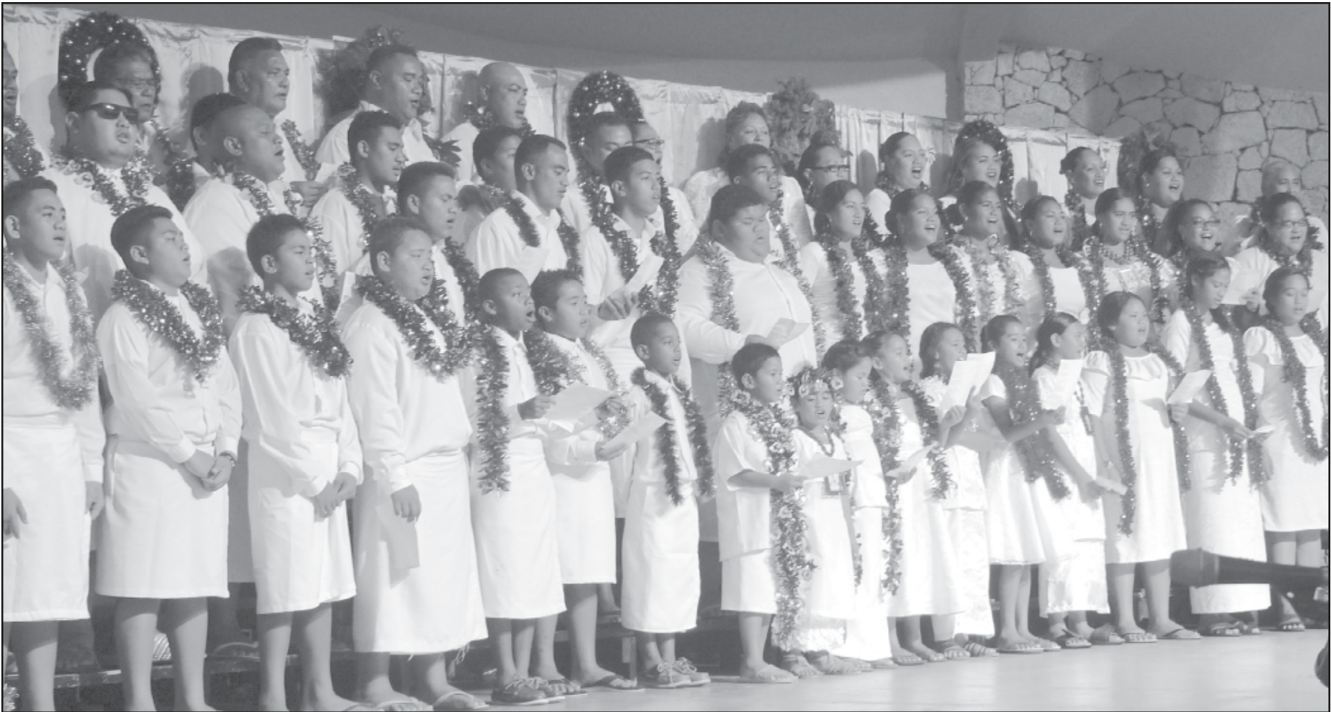
Masefau CCCAS Choir performed Tuesday night at the Gov. H. Rex Lee Auditorium during the third night of the 40th Annual Territorial Holiday Music Festival sponsored by the Arts Council of American Samoa, and funded by the National Endowment of the Arts with additional funding from Special Programs under the Governor’s Office. The program ended last night.