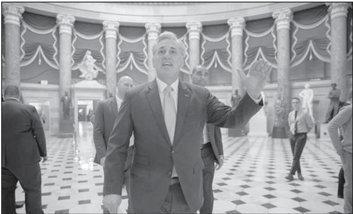
House Majority Leader Kevin McCarthy, R-Calif., walks through Statuary Hall for final passage of the Republican tax reform bill, at the Capitol in Washington, Tuesday, Dec. 19, 2017. Republicans muscled the most sweeping rewrite of the nation's tax laws in more than three decades through the House. In a last-minute glitch, however, Democrats said three provisions in the bill, including one that would allow parents to use college savings accounts for home-schooling expenses for young children, violate Senate budget rules. McCarthy said the House would vote on the package again on Wednesday.