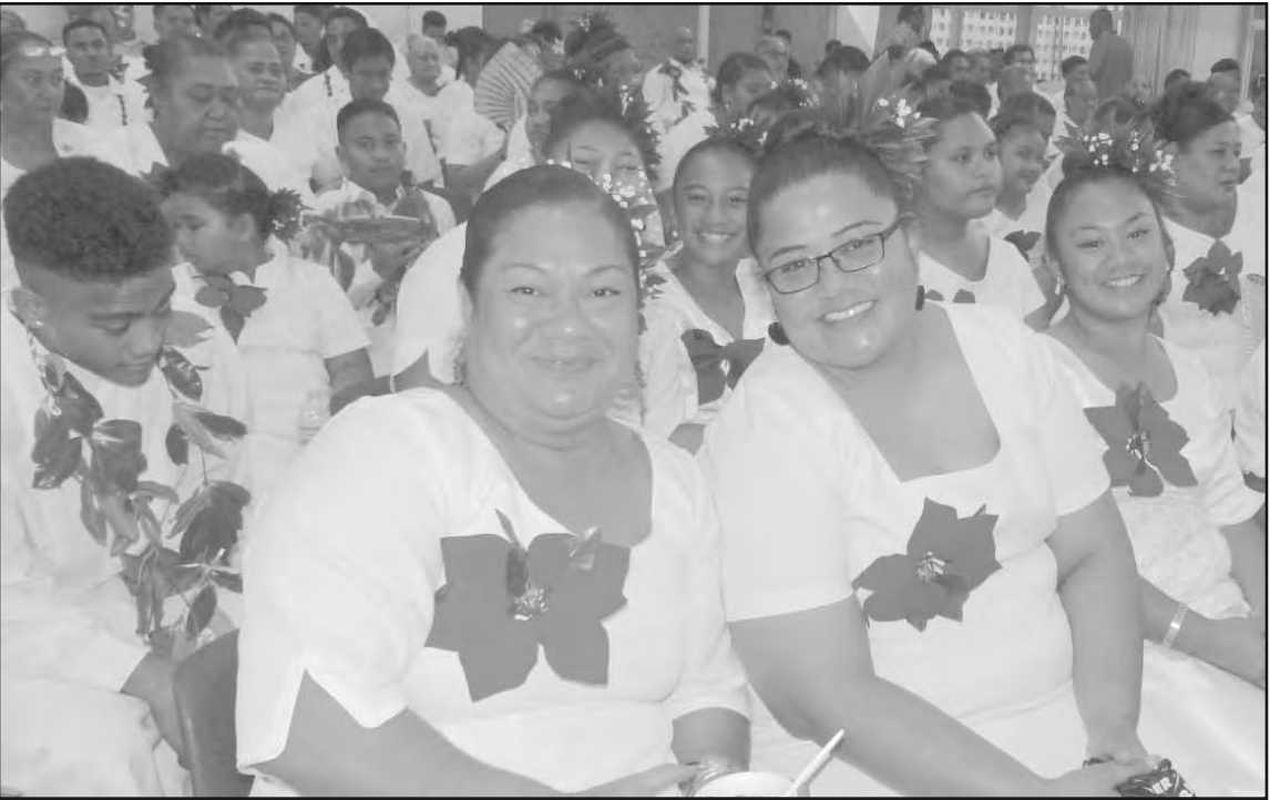
O nisi na o tama'ita'i lalelei sa auai mai i le aufaipese matagofie a Atuu CCCAS.