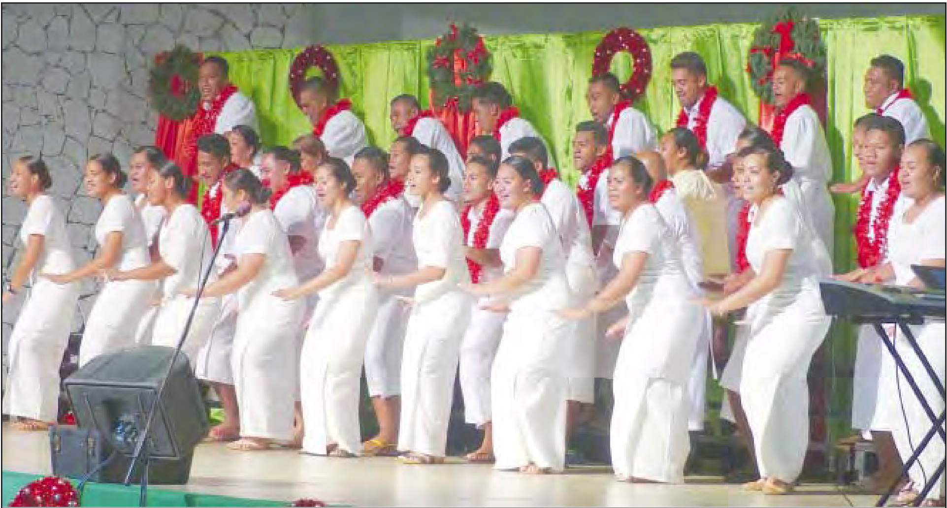
Malaeloa Methodist Choir performed Tuesday night at the Gov. H. Rex Lee Auditorium during the third night of the 40th Annual Territorial Holiday Music Festival sponsored by the Arts Council of American Samoa, and funded by the National Endowment of the Arts with additional funding from Special Programs under the Governor’s Office. The program ended last night.