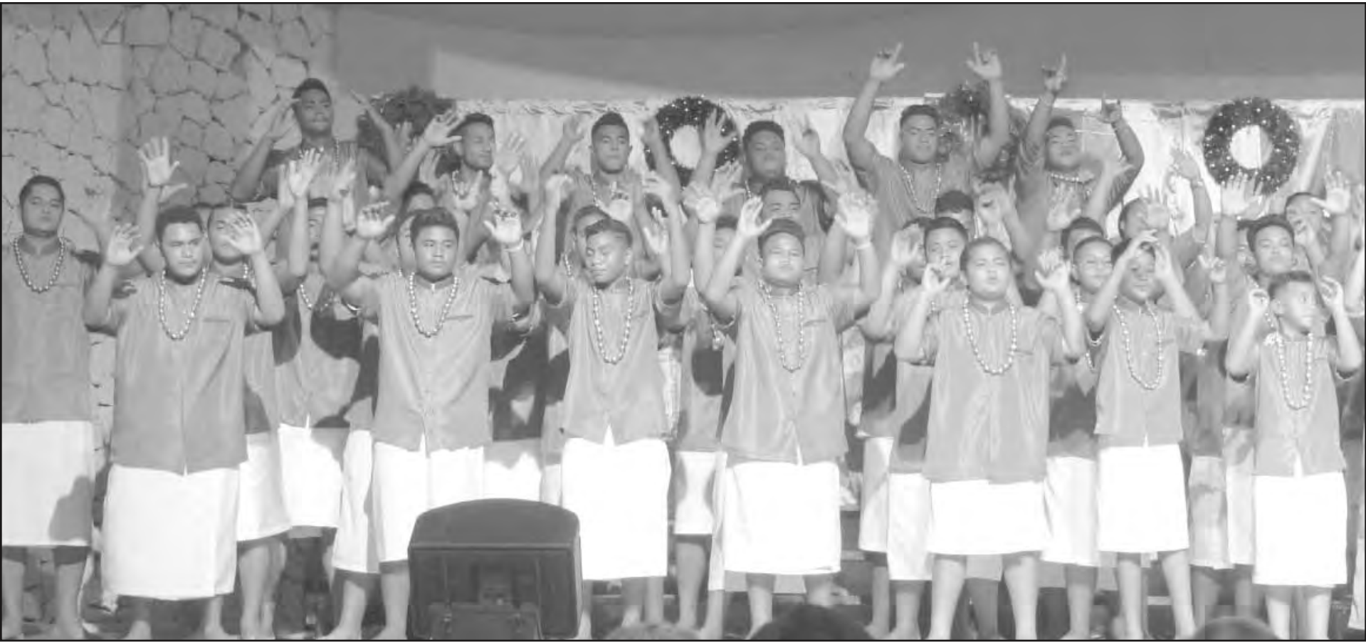
O le sao lena o Vaitogi i le fa’afiafiaga o le Kerisimasi e ala i pesega ma skids 2017