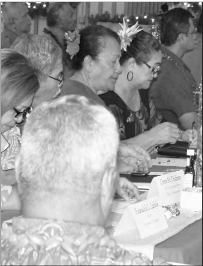
Nisi o sui o le kapineta a le kovana i le fonotaga i le vaiaso ua te'a i le taimi sa amata ai le sauniga i le tatalo.