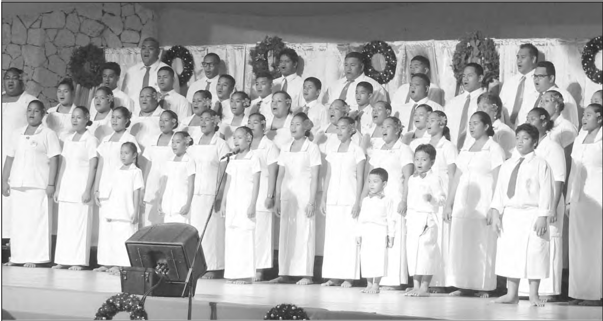
Aua Catholic choir performed Tuesday night at the Gov. H. Rex Lee Auditorium during the third night of the 40th Annual Territorial Holiday Music Festival sponsored by the Arts Council of American Samoa, and funded by the National Endowment of the Arts with additional funding from Special Programs under the Governor's Office. The program ended last night.