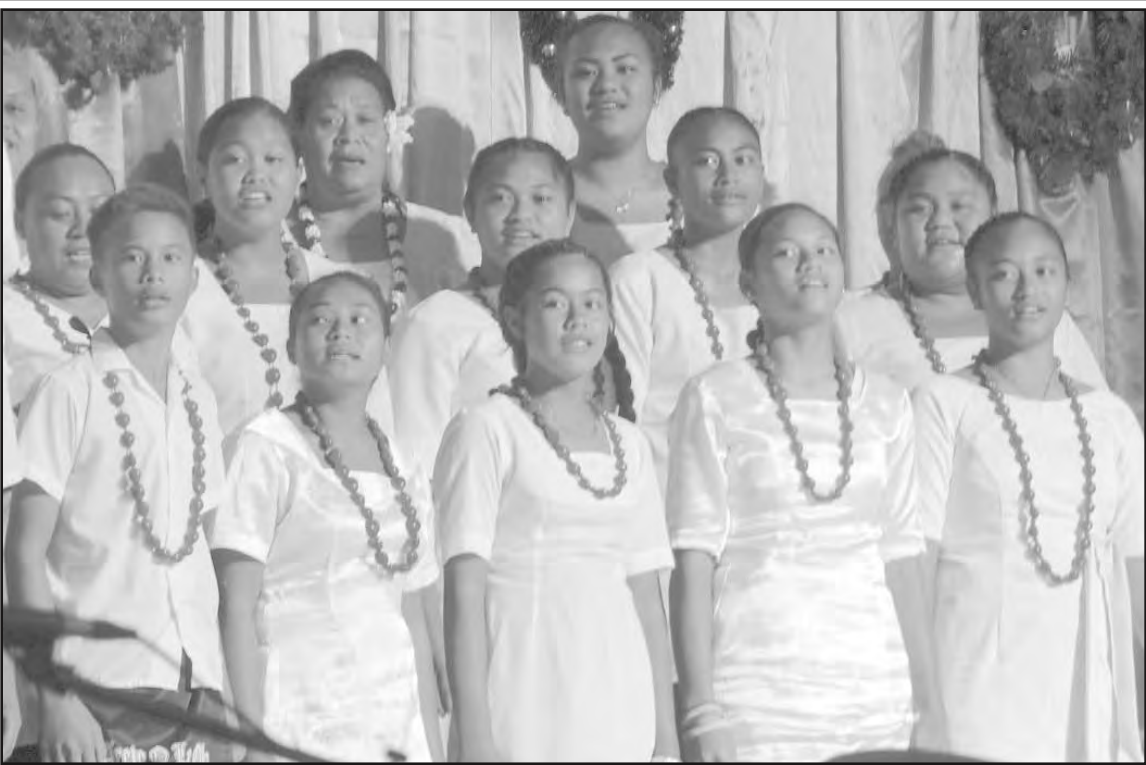
O tama'ita'i siufofoga matagofie mai le aufaipese a Leone Metotisi.