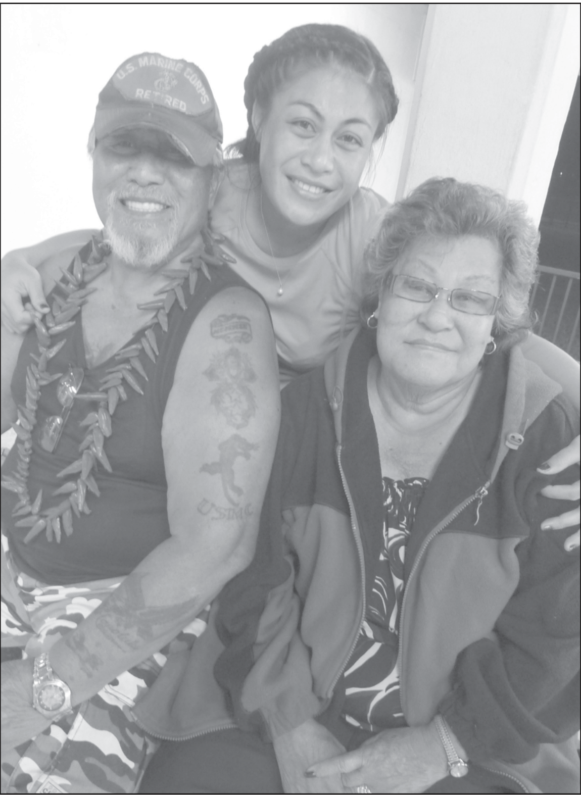
GYSGt Meaole, Ketesemane (itu tauagavale) o le US Marine Corps, atoa lelei lana tautua e 20 tausaga litaea ai, ma e fa’atolu ona fa’auia o ia e tau i le taua i Viet Nam mai ia Chu-Lai 1965 se’ia o’o 1969.

Mo le solitulafono o le faia o fa’amaumauga tau fa’asese, e 5 tausaga lea ua fa’asala ai o ia i le toese i Tafuna. Mo le moliaga o le gaoi, e 5 tausaga e fa’asala ai o ia i le toese i Tafuna. O ia fa’asalaga uma e tolu e tuli fa’atasi, lona uiga e na o le 5 tausaga lea o le a taofia ai o ia i le falepuipui.