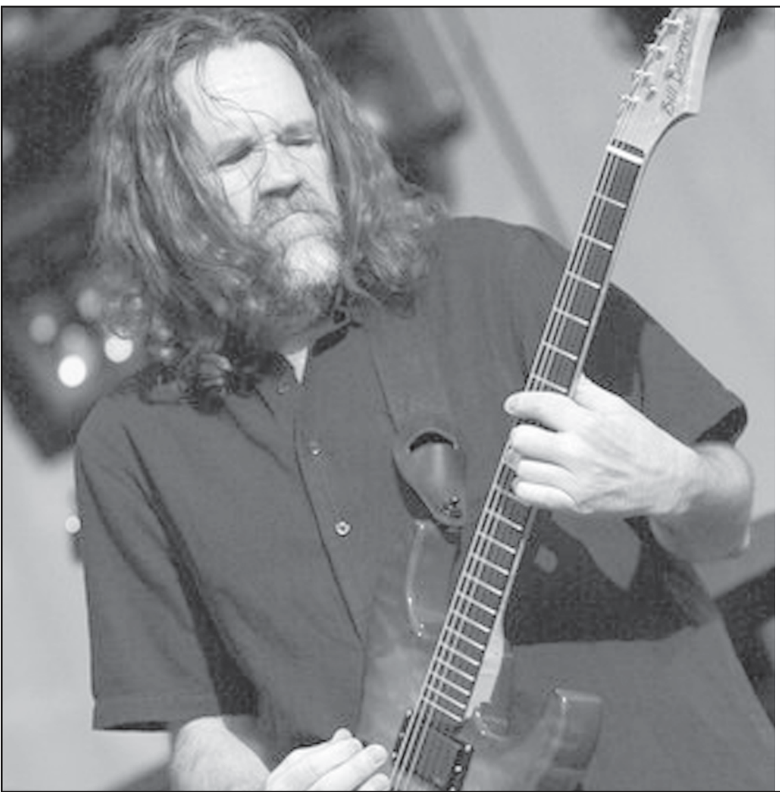
FILE - In this July 24, 2004 file photo, Boston lead singer and guitarist Brad Delp performs at the Outdoor Star Arena at Ameristar Casino and Hotel in Council Bluffs, Iowa. Fans of the rock band Boston can get more than a feeling at an upcoming auction - they can get their hands on the personal belongings of Delp. Delp,Âs concert grand piano, an electric guitar, silver glitter platform stage shoes and even his New Hampshire driver,Âs license are among the items for sale by Boston-based RR Auction starting Dec. 7, 2017.