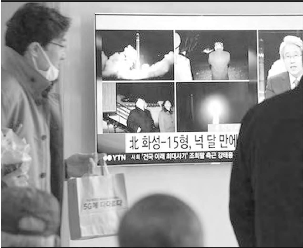
People watch a TV screen showing a local news program reporting about North Korea’s missile launch, at the Seoul Railway Station in Seoul, South Korea, Thursday, Nov. 30, 2017. After 2 –3 months of relative quiet, North Korea launched its most powerful weapon yet early Wednesday, claiming a new type of intercontinental ballistic missile that some observers believe could put Washington and the entire eastern U.S. seaboard within range. The signs read “North Korea’s Hwasong-15 missile.”