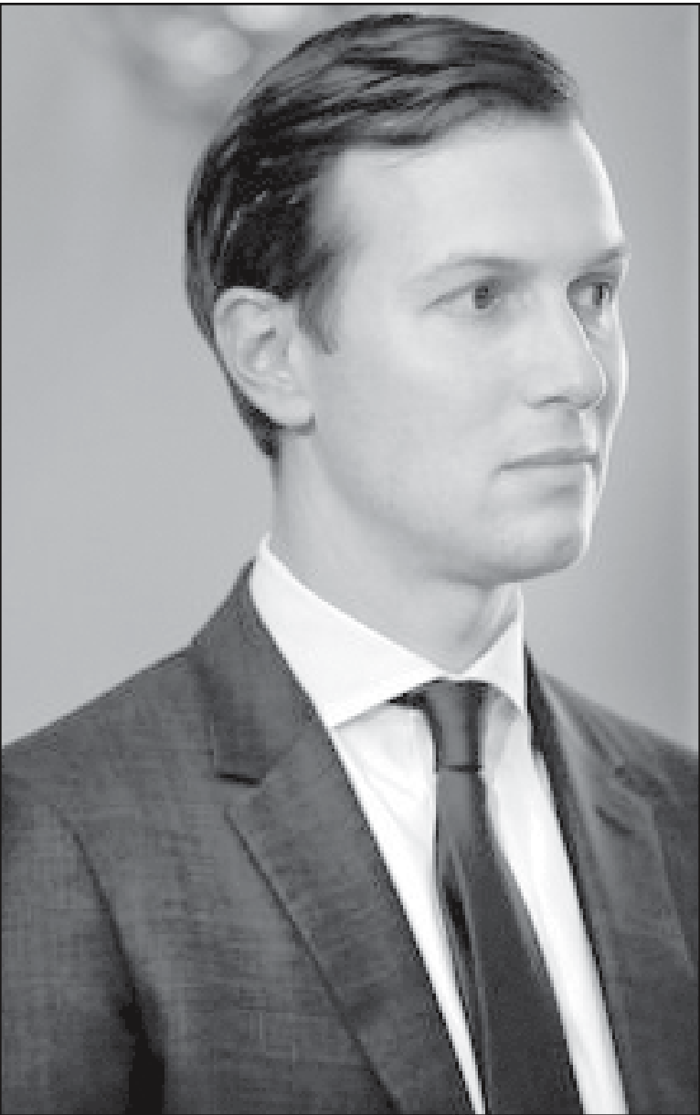
In this Friday, Aug. 11, 2017, file photo, White House senior adviser Jared Kushner listens as President Donald Trump answers questions at a news conference, in Bedminster, N.J. Kushner has been questioned by special counsel Robert Mueller's team of investigators about former national security adviser Michael Flynn. That's according to a person familiar with the investigation who spoke to the AP.