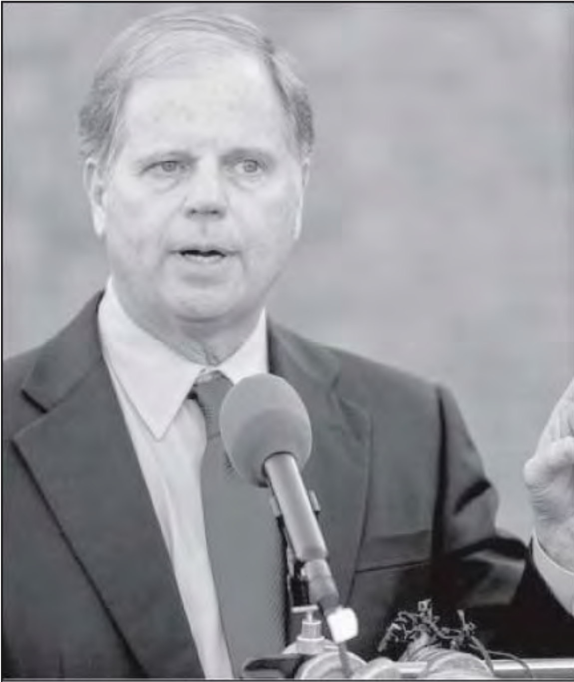
Alabama U.S. Senatorial candidate Doug Jones talks with the media after touring the Northport Medical Center, Tuesday, Nov. 28, 2017, in Northport, Ala. Jones is the democratic candidate facing republican Roy Moore for Alabama's U.S. Senate seat in the Dec. 12 special election.