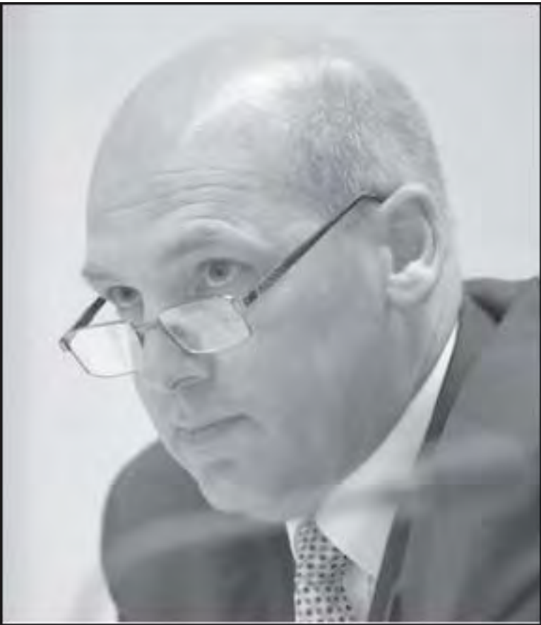
FILE - In this Feb. 8, 2016 file photo, President of the Senate Stephen Parry speaks during a Senate Estimates Committee at Parliament House in Canberra, Australia. Despite a High Court decision thought to have ruled a line under the saga last Friday, the dual citizenship crisis that has rocked Australia's parliament took another twist on Tuesday, Oct. 31 2017, with a senior member of the governing Liberal Party saying he may have to quit parliament. Senator Stephen Parry said he had contacted British authorities to see if he held dual nationality because of his UK-born father.