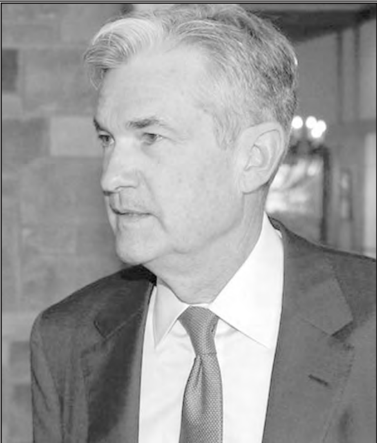
FILE - In this Thursday, Aug. 21, 2014, file photo, Jerome Powell, governor of the Board of Governors of the Federal Reserve, arrives for a dinner during the Jackson Hole Economic Policy Symposium in Grand Teton National Park near Jackson, Wyo. Two senior administration officials said Thursday, Nov. 2, 2017, that Powell is President Donald Trump's choice to succeed Janet Yellen.