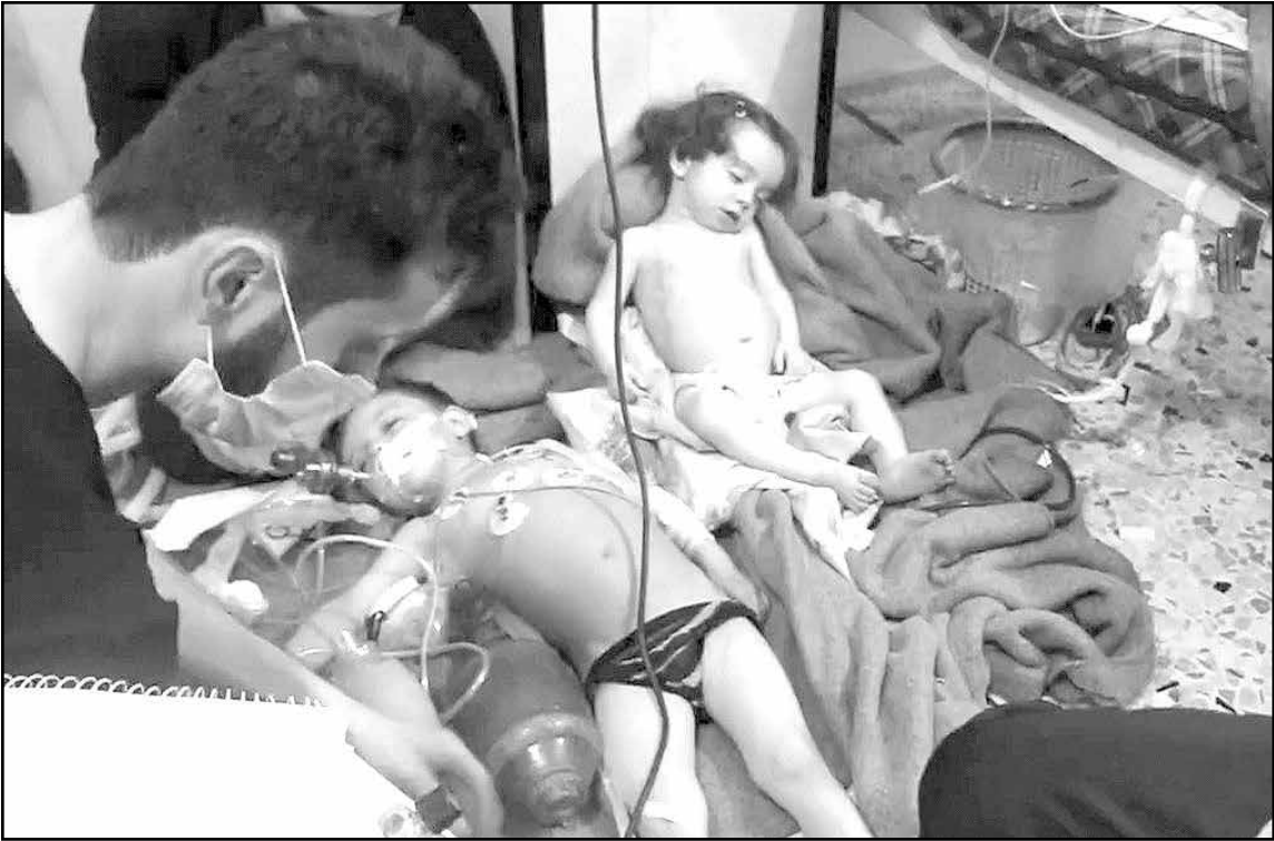
This image made from video released by the Syrian Civil Defense White Helmets, which has been authenticated based on its contents and other AP reporting, shows medical workers treating toddlers following an alleged poison gas attack in the opposition-held town of Douma, in eastern Ghouta, near Damascus, Syria, Sunday, April. 8, 2018. The Civil Defense said patients were having difficulty breathing and burning in their eyes. Syrian opposition activists and rescuers said Sunday that a poison gas attack on a rebel-held town near the capital. The Syrian government denied the allegations, which could not be independently verified.

Those in Ottoville already visited by DSA, with slips that have DSA written on them, do not have to come to the DRC, as they are already registered with FEMA.