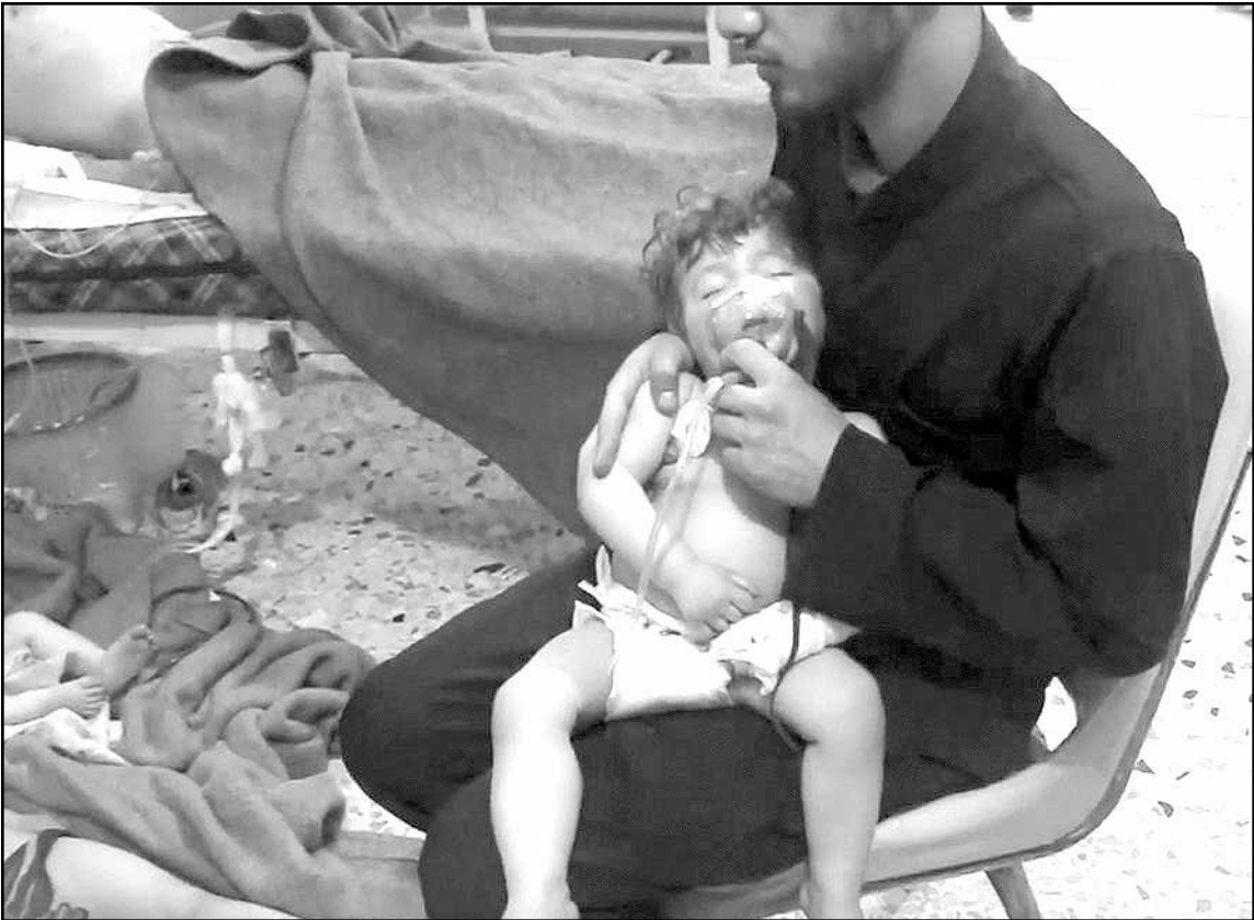
This image made from video released by the Syrian Civil Defense White Helmets, which has been authenticated based on its contents and other AP reporting, shows a medical worker giving toddlers oxygen through respirators following an alleged poison gas attack in the opposition-held town of Douma, in eastern Ghouta, near Damascus, Syria, Sunday, April 8, 2018. Syrian opposition activists and rescuers said Sunday that a poison gas attack on a rebel-held town near the capital. The Syrian government denied the allegations, which could not be independently verified.