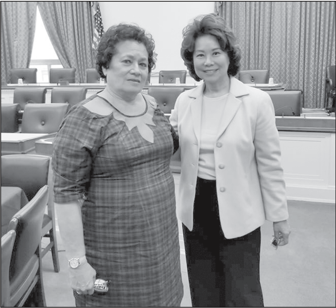
Congresswoman Amata with Transportation Secretary Elaine Chao in a committee room on Capitol Hill.