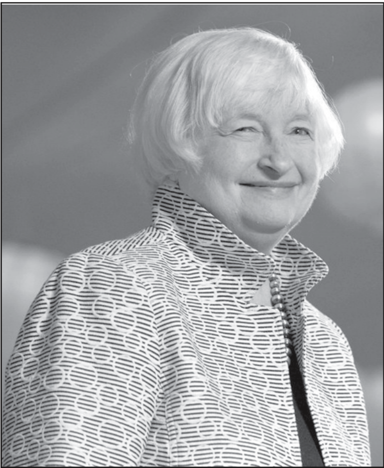
FILE - In this Friday, May 5, 2017, file photo, Federal Reserve Chair Janet Yellen smiles before giving a speech during a conference at Brown University in Providence, R.I. Yellen's last day at the Fed is Friday, Feb. 2, 2018. Then she will start a new job on Monday, Feb. 5 at the Brookings Institution.

Before becoming Fed chair in 2014, Yellen had served as the central bank’s vice chair and was president of the Fed’s San Francisco regional bank. “I’ve been in high level positions in the Federal Reserve for many years, where I think I’ve had a seat at the table to make the arguments that I thought needed to be made and to advocate for good policy,” Yellen said. Yellen was asked whether she believed the economy was under threat because stocks had risen too high, creating an asset bubble that could burst, with disastrous results. “I don’t want to say too high. But I do want to say high,” Yellen said, adding that it was “a source of some concern that asset valuations are so high.”