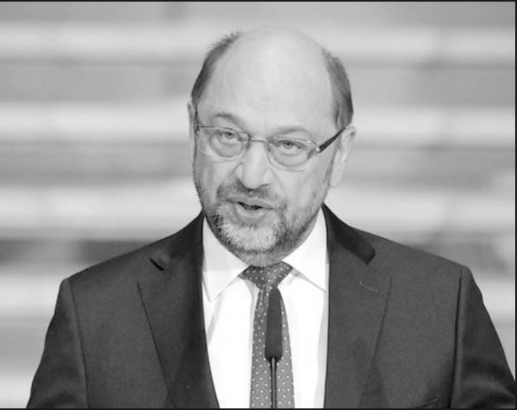
Martin Schulz, head of Germany's Social Democratic Party, SPD, speaks to journalists at the start of a new round of coalition talks in Berlin, Sunday, Feb. 4, 2018. Chancellor Angela Merkel's conservatives and the center-left Social Democrats embarked Sunday on what they hope is their last round of talks on forming a new German government, although the negotiations could take up to two more days.

BERLIN (AP) — Chancellor Angela Merkel's conservatives and the center-left Social Democrats embarked Sunday on a final push for an agreement on a new German government, but negotiators adjourned for the night without resolving all their differences.