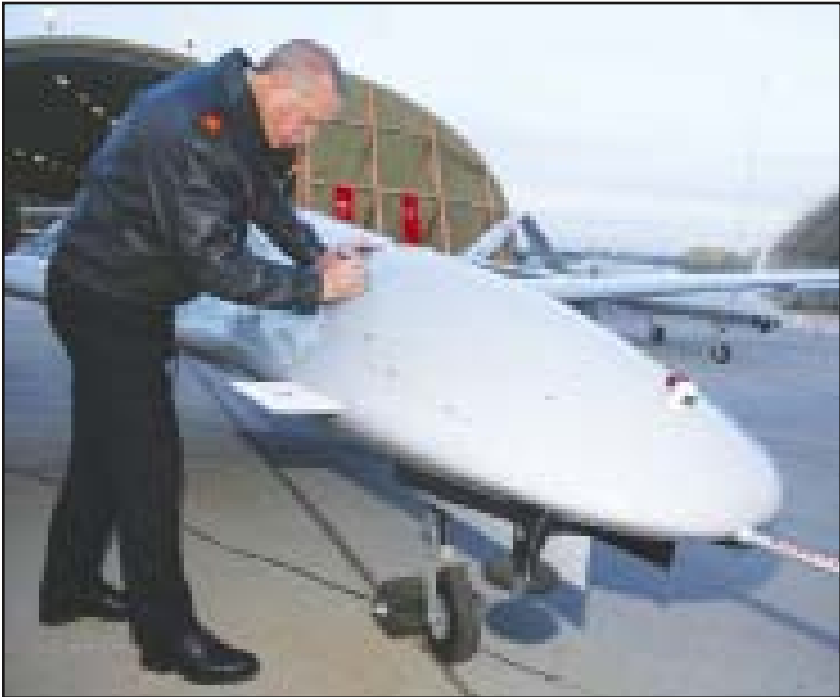
Turkey's President Recep Tayyip Erdogan signs a drone at a military airbase in Batman, Turkey, Saturday, Feb. 3, 2018. The Turkish military says two of its soldiers have been killed in Syria and a third was killed on the Turkish side of the border in an attack by Syrian Kurdish militiamen, saying Saturday's deaths were related to Turkey's operation against the Syrian Kurdish-held enclave of Afrin.