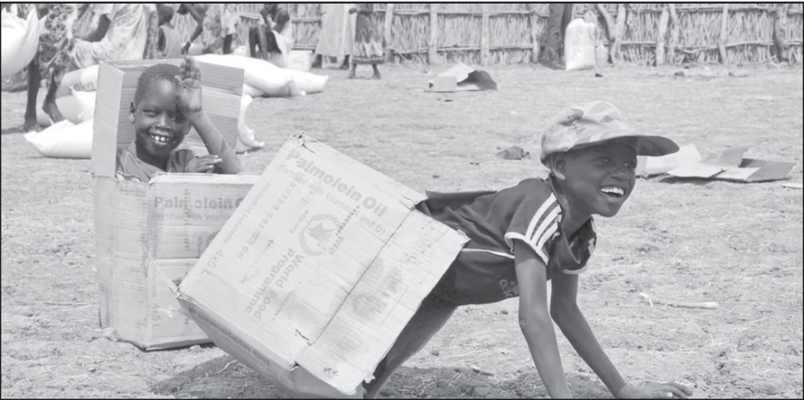
In this photo taken Saturday, Jan. 20, 2018, children play in empty cardboard boxes during a food distribution by Oxfam outside Akobo town, one of the last rebel-held strongholds in South Sudan. Child abductions have risen during South Sudan’s civil war as desperate people try to make a living, and one child, no matter the age, is said to sell for 20 cows, worth about $7,000.