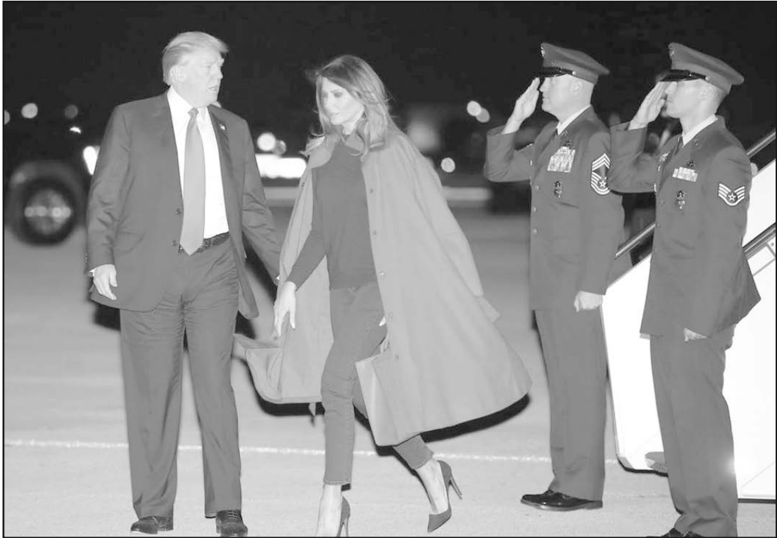
President Donald Trump and first lady Melania Trump arrive on Air Force One at Palm Beach International Airport, in West Palm Beach, Fla., Friday, Feb. 2, 2018.