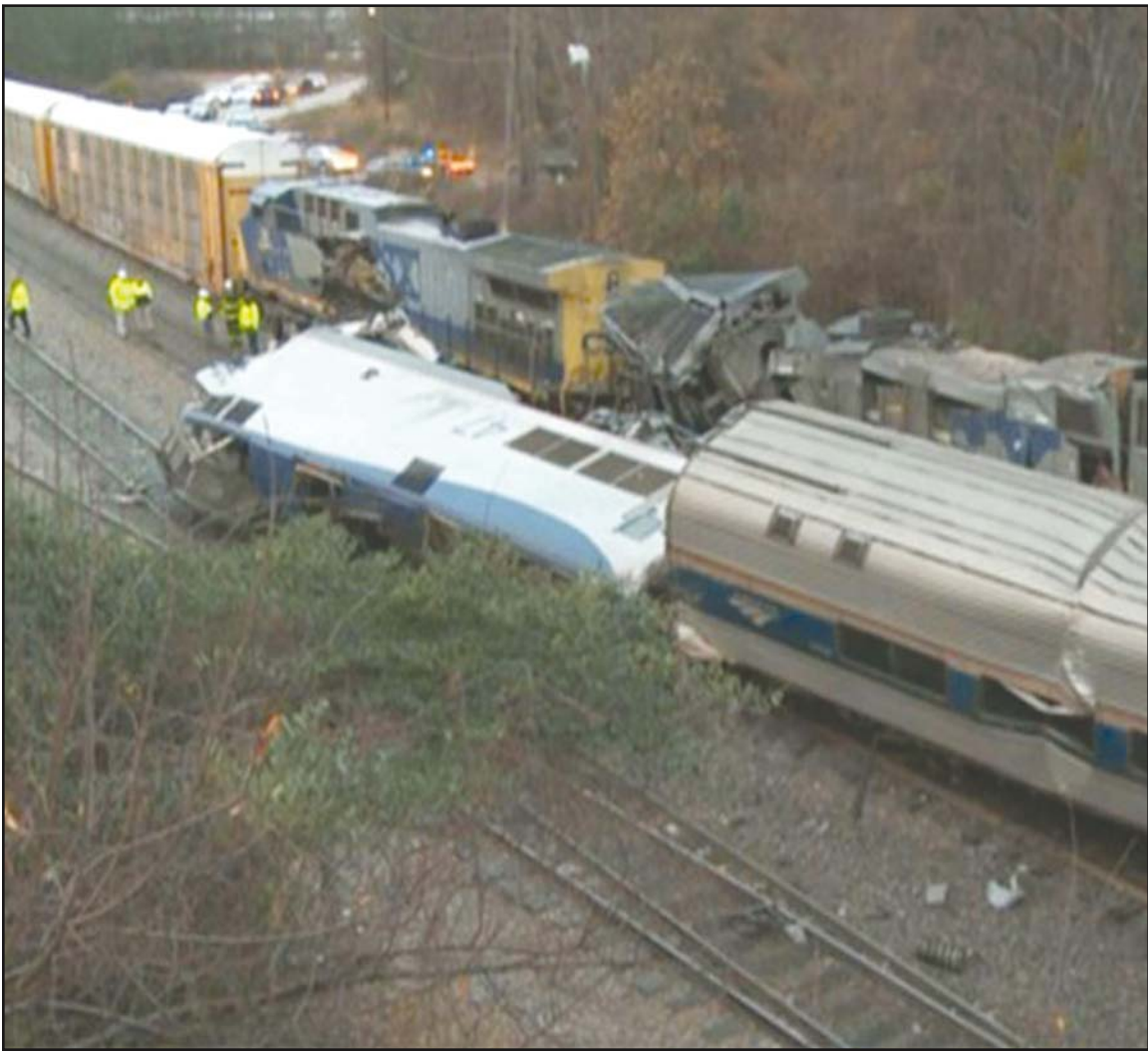
In this image from video, train cars are smashed and derailed Sunday, Feb. 4, 2018 near Cayce, S.C. The crash left multiple people dead and dozens of people injured.