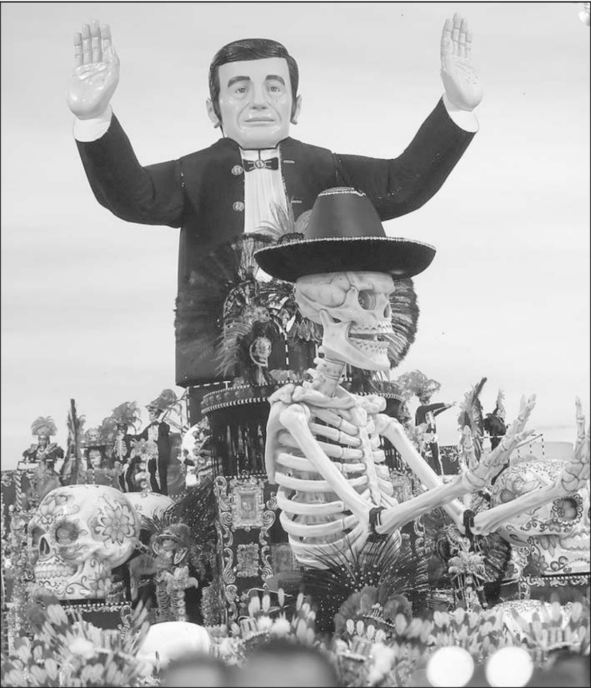
Dancers from the Vila Maria samba school perform on a float during a carnival parade in Sao Paulo, Brazil, Sunday, Feb. 11, 2018.