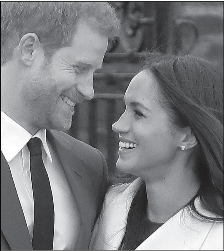
FILE - In this file photo dated Monday Nov. 27, 2017, Britain's Prince Harry and his fiancée Meghan Markle pose for photographers in the grounds of Kensington Palace in London, following the announcement of their engagement. Speculation is mounting over who will be invited to the May 19, 2018, royal wedding of Prince Harry and Meghan Markle, with some high profile people openly saying they would like to attend, though the actual guest list is a closely guarded secret.