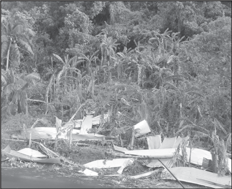
O le taimi nei, ua mae'a soloia fale, ae o lo ua avea o latou taualuga ma fa'aletonu, pe afai ae toe alia'i mai se isi matagi malolosi, e toe sau tama ia e toe faia nisi fa'alavelave matuia atu i tagata feoai fa'apea ma nisi o aiga tulata ane i lea fa'ato'aga fa'i ua fola i apa.