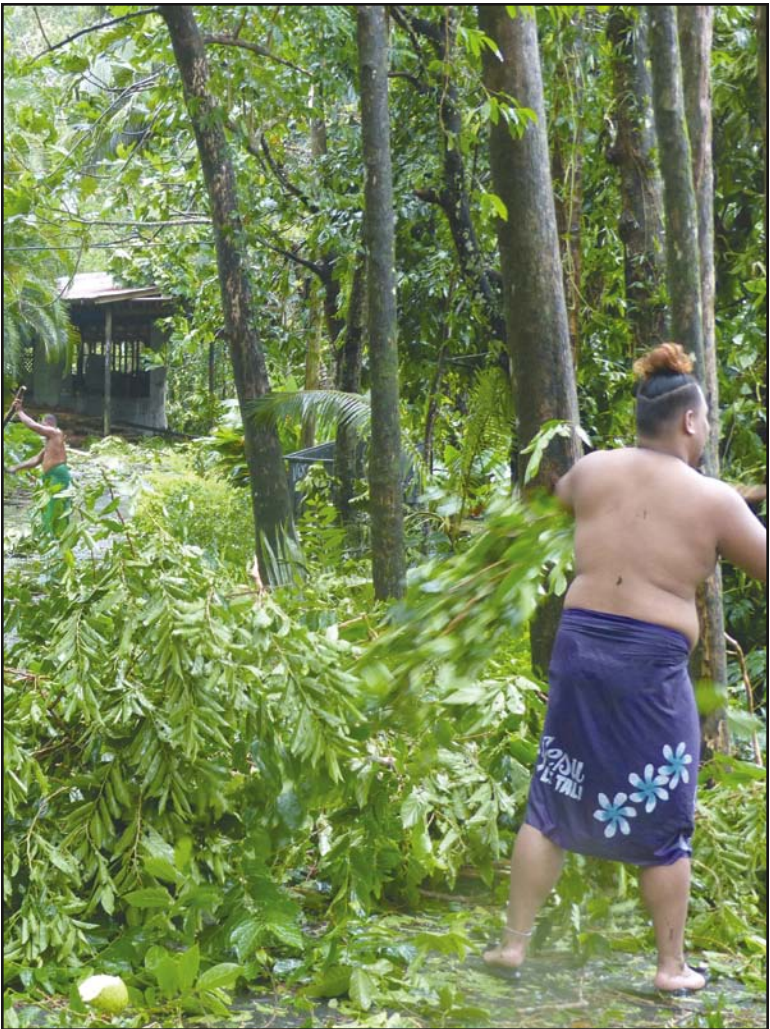
O nisi o uaea eletise ma telefoni ta'atitia i luga o ala e feoa'i ai ta'avale ma tagata. O nisi o nei aiga e feoa'i e le manatu ina ia fa'aletonu i latou pe a o'o ina ki mai le eletise a le Malo. O i latou ia ua taumafai e soloia na ituaiga o fa'aletonu.