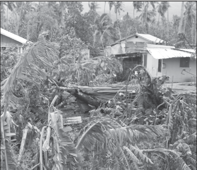
Tropical Storm Gita caused severe damage to many houses, businesses and greenery in American Samoa with its wind gusts of up to 85 mph on Friday. A monsoonal trough followed on its heels pouring rain and high winds on to an already disastrous situation.