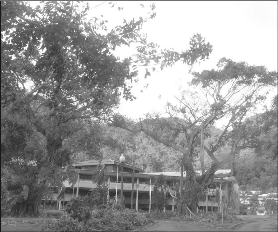
Strong winds from Tropical Storm Gita last Friday stripped off branches of a huge tree in front of the A.P. Lutali Executive Office Building in Utulei.

Power is on to all areas except for parts of Olosega due to a down transformer.