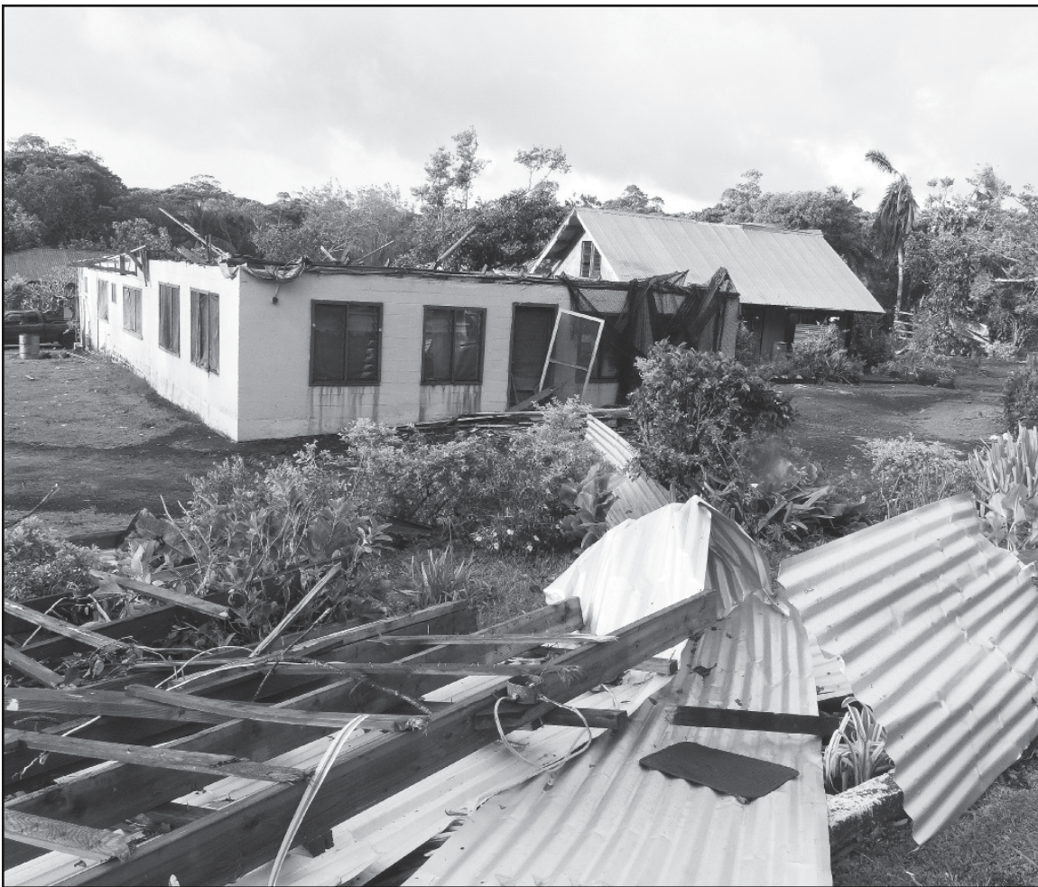
This family home in Nu'uuli had its roof ripped off by strong winds from Tropical Storm Gita last Friday.