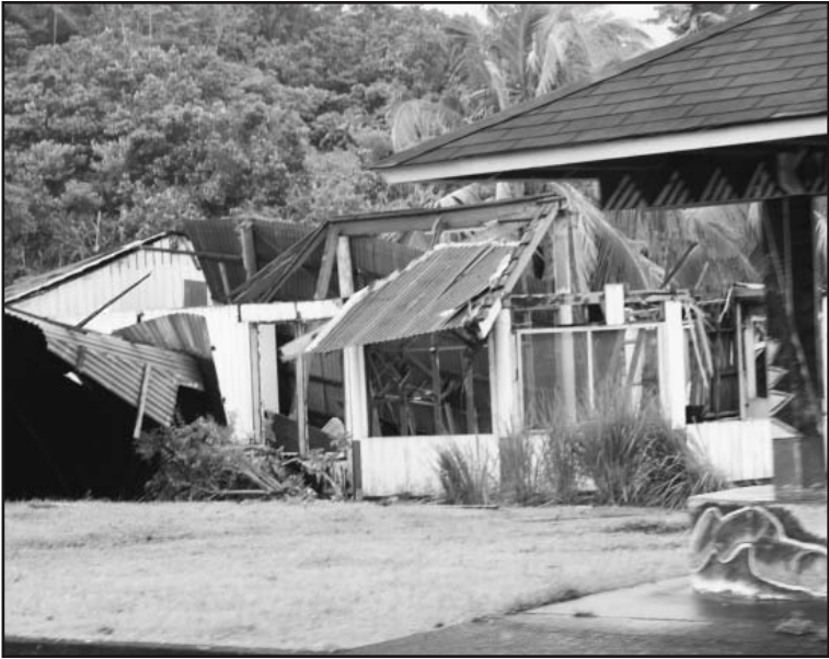
Tropical Storm Gita caused severe damage to many houses, businesses and greenery in American Samoa with its wind gusts of up to 85 mph on Friday. A monsoonal trough followed on its heels pouring rain and high winds on to an already disastrous situation.