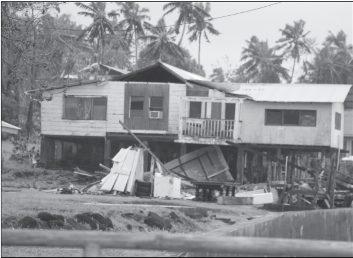
Tropical Storm Gita caused severe damage to many houses, businesses and greenery in American Samoa with its wind gusts of up to 85 mph on Friday. A monsoonal trough followed on its heels pouring rain and high winds on to an already disastrous situation.