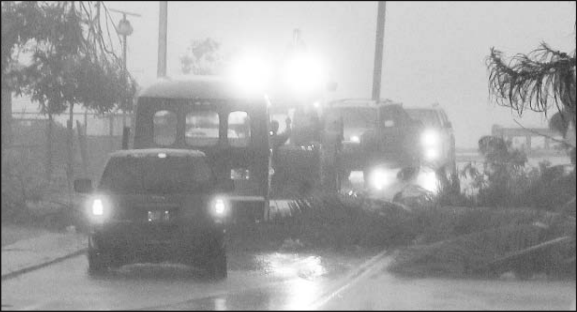
An emergency crew rushed to the scene of a large downed tree at Fagaalu around 7a.m. Friday to clear the road as well as move an aiga bus, affected when the tree fell in the midst of strong gusty winds from Tropical Storm Gati. No one was injured.