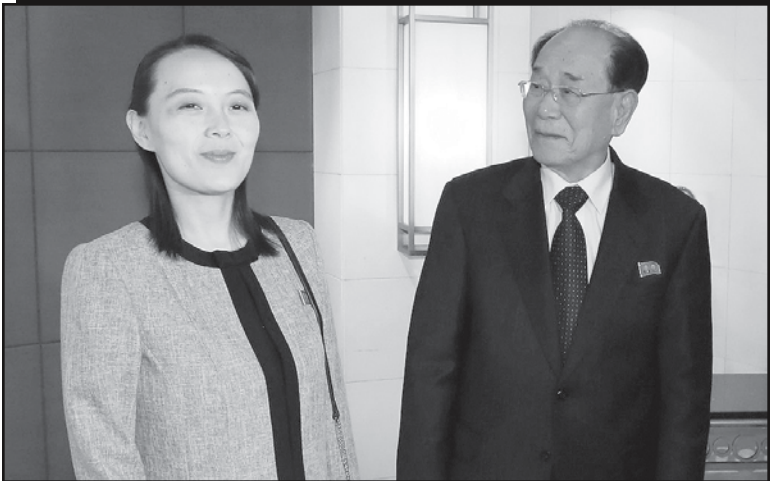
Kim Yo Jong, left, sister of North Korean leader Kim Jong Un, and Kim Yong Nam, North Korea's nominal head of state, arrive to attend a luncheon with South Korean Prime Minister Lee Nak-yeon in Seoul, South Korea, Sunday, Feb. 11, 2018. A rare invitation to Pyongyang for South Korea's president marked Day Two of the North Korean Kim dynasty's southern road tour, part of an accelerating diplomatic thaw that included some Korean liquor over lunch and the shared joy of watching a "unified" Korea team play hockey at the Olympics.

watched their every move. They were whisked back and forth between Seoul and the Olympic towns of Pyeongchang and Gangneung. They shared the VIP box with world leaders at the opening ceremony and joined Moon in cheering for the first-ever inter-Korean Olympic team as it debuted in the women's ice hockey tournament. Saturday's game ended in a crushing 8-0 loss to Switzerland. The most important part of the visit, however, came during one of the quieter moments. Invited by Moon for lunch at Seoul's presidential palace, Kim Yo Jong verbally delivered her brother's hope for a summit with Moon in Pyongyang, a meeting that she said would help significantly improve ties after an extended period of animosity. "We hope that President (Moon) could leave a legacy that would last over generations by leading the way in opening a new era of unification," she said, according to Moon's office.