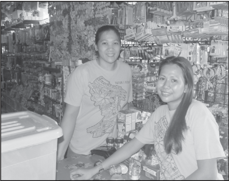
O le aoauli o le aso To'ona'i, ae ua tatala ai faitoto'a o le Tutuila Store i Nuuuli mo fa'atauga, peita'i e leai se eletise i le faleoloa atoa, ona ua motusia talu ai le afa o Gita.