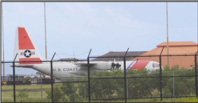
A US Coast Guard C-130 airplane crew from Air Station Barbers Point, Hawai'i, landed Saturday afternoon at Pago Pago International Airport, after conducting an aerial post-storm assessment.