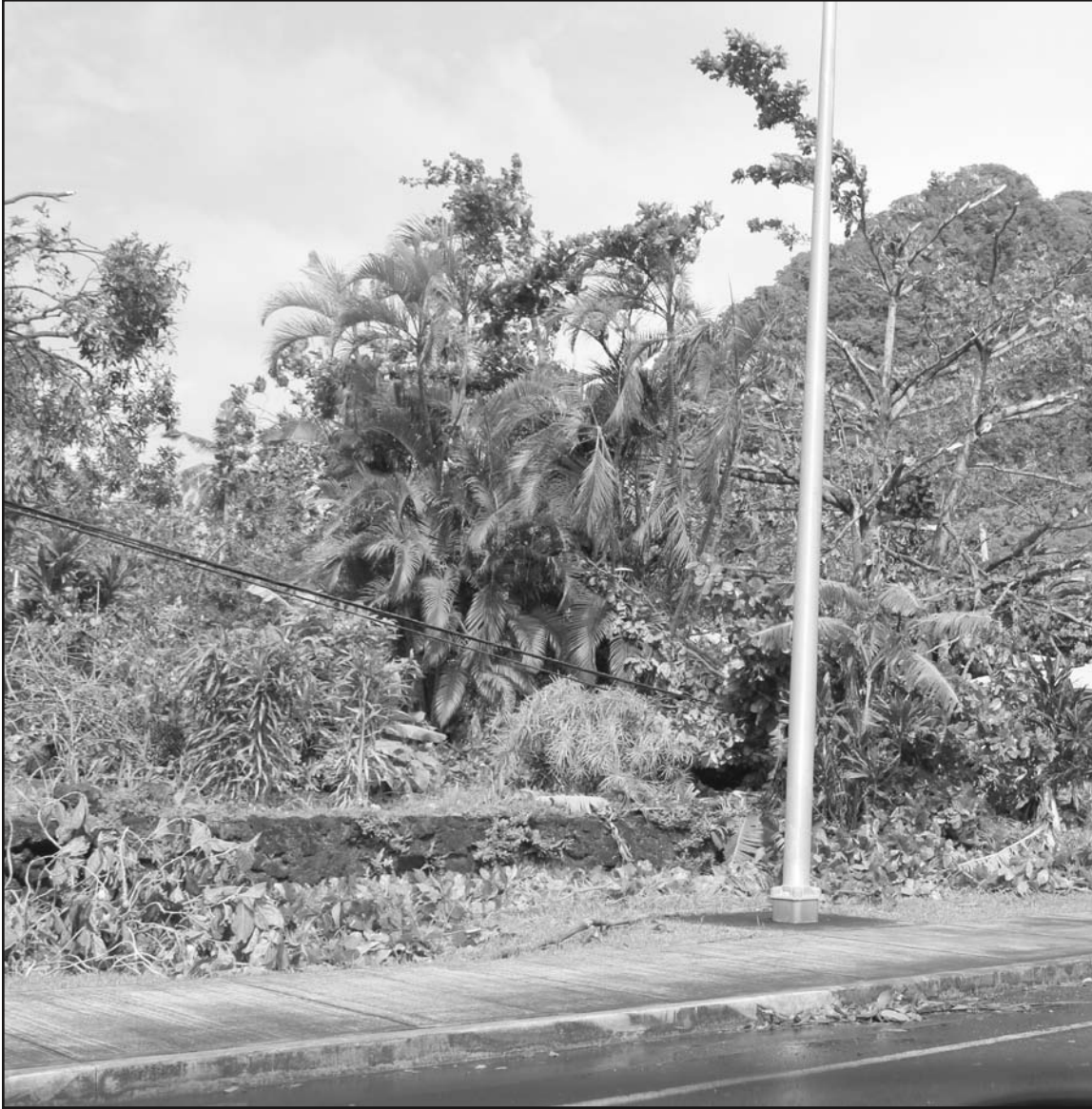
Tropical Storm Gita caused severe damage to many houses, businesses and greenery in American Samoa with its wind gusts of up to 85 mph on Friday. A monsoonal trough followed on its heels pouring rain and high winds on to an already disastrous situation.