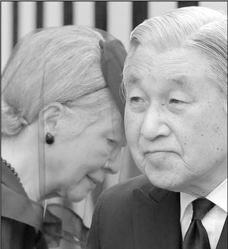
FILE - In this June 19, 2012 file photo, Emperor Akihito and Empress Michiko leave after praying at the altar of the late Prince Tomohito, in Tokyo. Japan’s Prime Minister Shinzo Abe said Emperor Akihito plans to abdicate on April 30, 2019, in the first such abdication in about 200 years. The emperor will be 85 by then and has cited his age as a concern. Akihito’s elder son Crown Prince Naruhito will ascend the throne a day later, on May 1, 2019, beginning a new era.