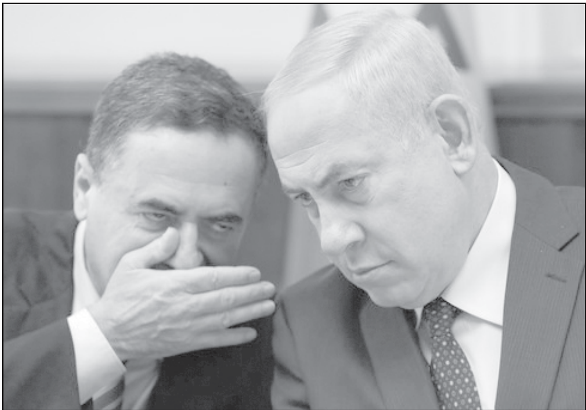
FILE - In this Sept. 26, 2017 file photo, Israeli Prime Minister Benjamin Netanyahu listens to transportation minister Yisrael Katz during the weekly cabinet meeting at his office in Jerusalem. On Monday, Nov. 6, 2017, Netanyahu pledged 200 million shekels ($57 million) to build safe bypass roads for Jewish West Bank settlers, in a move that looks to satisfy a key constituent but anger Palestinians who consider it a further encroachment upon their hoped for future state.