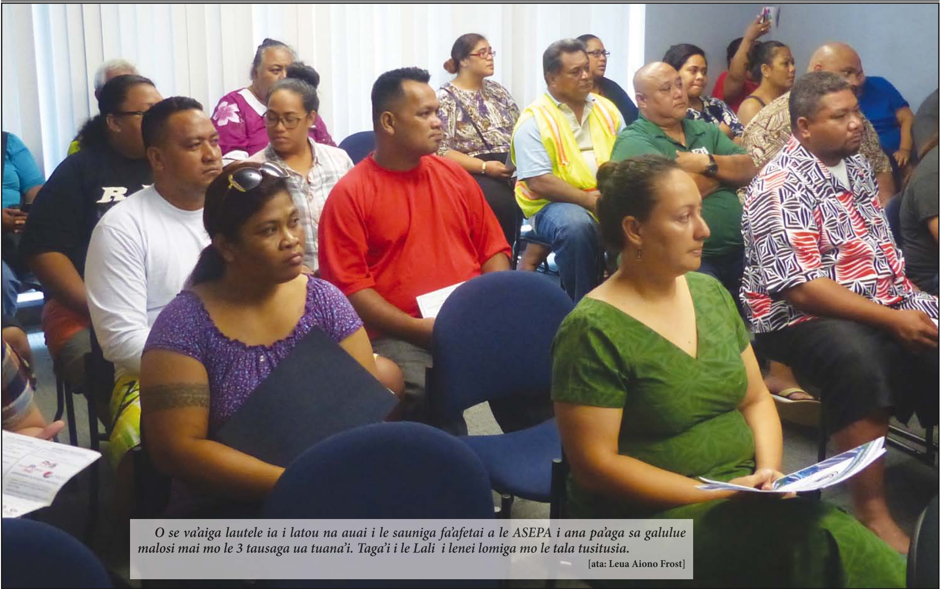
O se vā'iga lautele ia i latou na auai i le sauniga fa'afetai a le ASEPA i ana pa'aga sa galulue malosi mai mo le 3 tausaga ua tuana'i. Taga'i i le Lali i lenei lomiga mo le tala tusitusia.