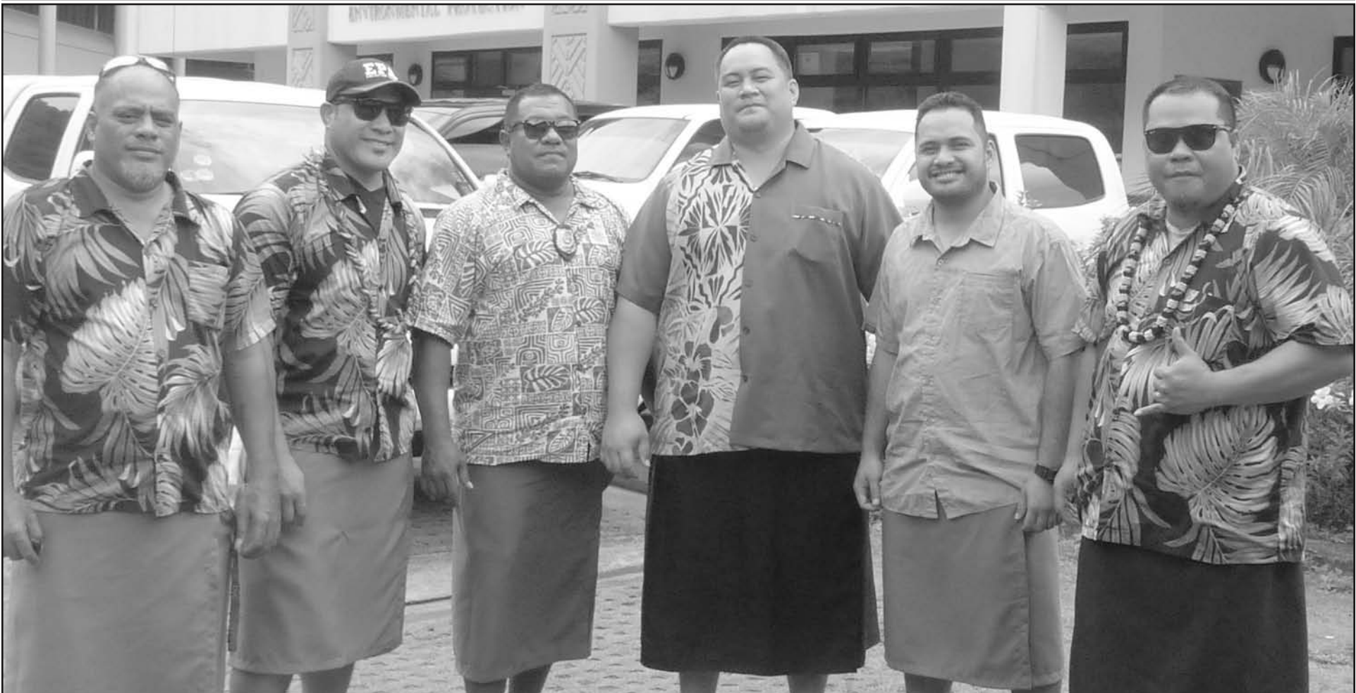
Nisi o le aufaigaluega a le ASEPA, i le aso ananafi sa fa’amanatuina ai le 30 tausaga o le tautua a lea ofisa o le malo i le atunu’u. Taga’i i le Lali i lenei lomiga mo le tala tusitusia.