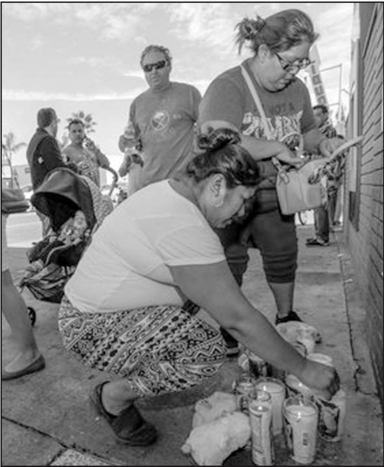
People gather at a makeshift memorial on the corner of Indiana Street and Whittier Blvd. in Boyle Heights, Friday, Nov. 17, 2017, where two boys were killed after they were struck by a Los Angeles County Sheriff’s Department vehicle that was involved in a crash while responding to a radio call of shots fired. One of the boys died at the scene and the other at a hospital. Their mother was critically injured.

Three other people arrested are facing charges in the case, which could go before a grand jury as early as next week.