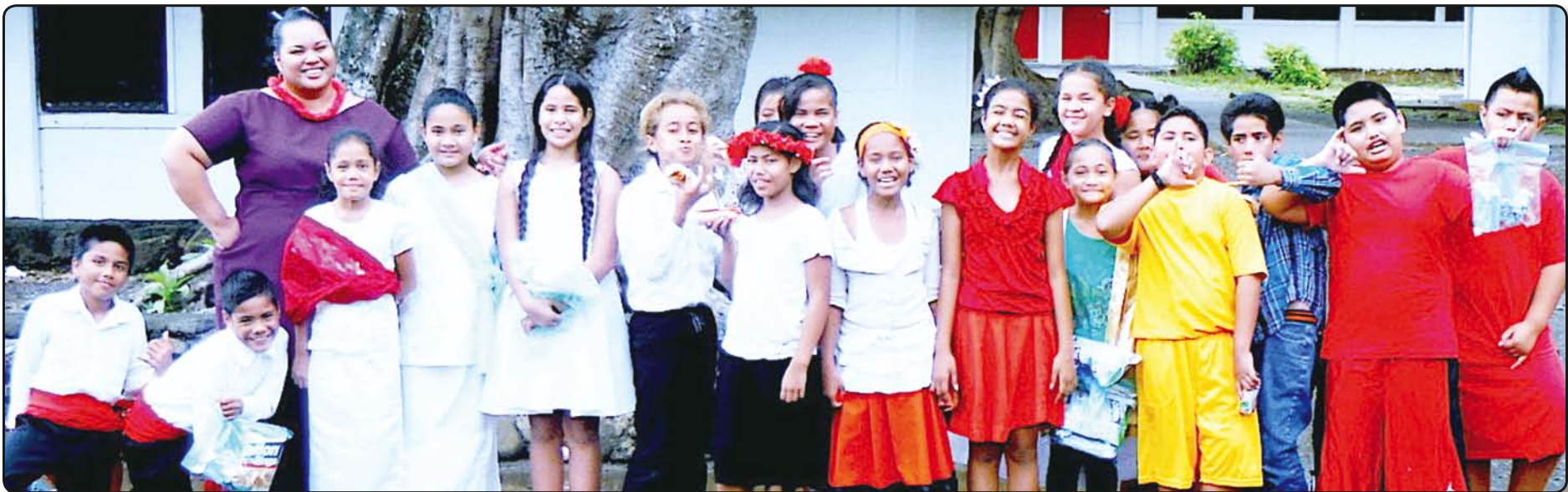
Matafao Elementary School students with their ASCC student teacher on the day of her "Culmination" peer review.