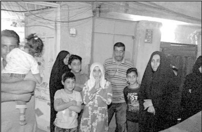
People stand in the street after feeling aftershocks from an earthquake in Baghdad, Iraq, Sunday, Nov. 12, 2017. The deadly earthquake hit the region along the border between Iran and Iraq on Sunday. The U.S. Geological Survey said the quake was centered 19 miles (31 kilometers) outside the eastern Iraqi city of Halabja.

TEHRAN, Iran (AP) — Iran’s state TV is reporting a magnitude 6.1 earthquake has jolted a sparsely populated area in the country’s southeast. There are no immediate reports of damage or casualties. The U.S. Geological Survey has put the magnitude at 6. The Friday quake jolted Hojedk town, about 1,100 kilometers (683 miles) southeast of the capital Tehran. The farming town has a population of 3,000 and is frequently hit by quakes. Last month, a magnitude 7.3 earthquake struck western Iran, killing 530 and injuring more than 9,000 people. In 2003, a magnitude 6.6 quake flattened the historic southern city of Bam, killing 26,000 people. Iran is located on major seismic faults and averages a quake per day.