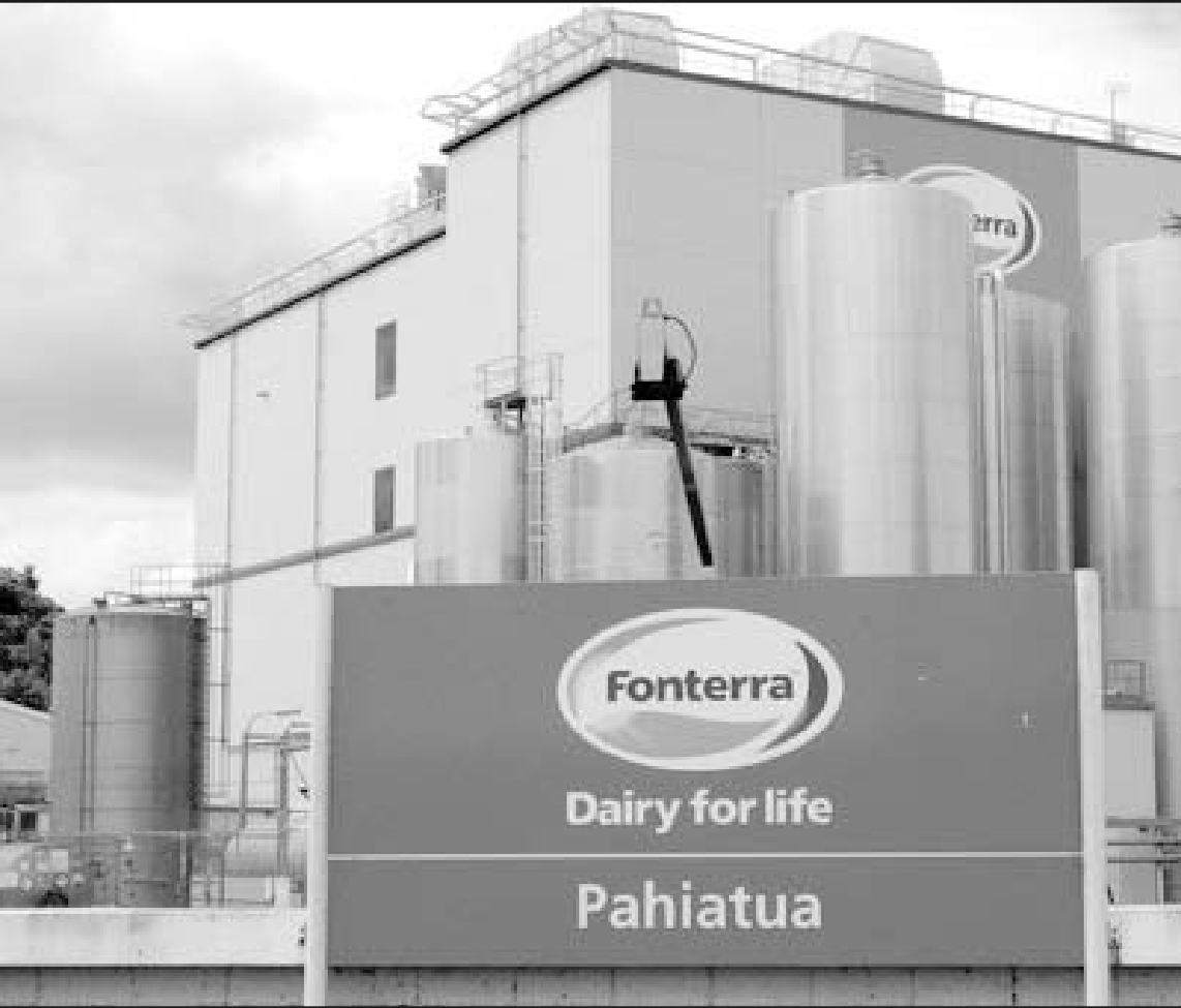
FILE - This Dec. 11, 2013 file photo shows a Fonterra milk powder factory at Pahiatua, New Zealand. An arbitration tribunal has ordered New Zealand dairy giant Fonterra to pay Danone of France US$125 million for recall costs stemming from a 2013 food scare.

ufacturing economy registered 50.8 last month, down from 51.0 in October. WALL STREET: On Thursday, the Dow Jones industrial average finished with its biggest gain since March and pushed it past the 24,000 mark for the first time. The Dow jumped 1.4 percent to 24,272.35. The Standard & Poor’s 500 index climbed 0.8 percent to 2,647.58 and the tech-heavy Nasdaq gained 0.7 percent to 6,873.97. The Russell 2000 index of smaller-company stocks picked 0.1 percent to 1,544.14. OIL: Crude oil prices gained after OPEC and a group of allied oil-producing nations agreed to extend crude output cuts until the end of next year. Benchmark U.S. crude added 20 cents to $57.60 per barrel on the New York Mercantile Exchange. The contract finished at $57.40 per barrel on Thursday, up 10 cents. Brent crude, used to price international oils, gained 34 cents to $62.97 per barrel in London. It finished at $62.63 a barrel, up 10 cents in the previous day. CURRENCIES: The dollar edged higher to 112.57 yen from 112.54 yen while the euro rose slightly to $1.1907 from $1.1904.