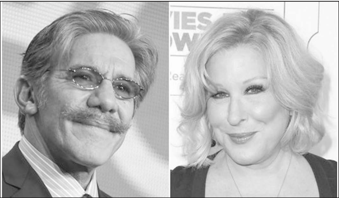
This combination photo shows Geraldo Rivera at “The Celebrity Apprentice” panel at the NBC 2015 Winter TCA in Pasadena, Calif., on Jan. 16, 2015, left, and Bette Midler at the 15th Annual Movies for Grownups Awards in Beverly Hills, Calif., on Feb. 8, 2016. Midler is renewing an allegation of sexual misconduct against Geraldo Rivera, a day after Rivera called the news business “flirty.” In a tweet posted Thursday by Midler and confirmed by her publicist, the actress-singer called on Rivera to apologize for an assault she said occurred four decades ago.

Reprinted with permission from Seafood Source, a leading online source for global seafood industry news, trends, expo coverage and business resources.