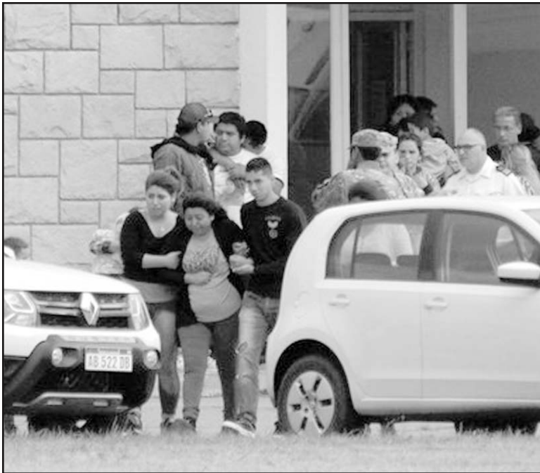
Relatives of crew members of the missing ARA San Juan submarine embrace outside the navy base in Mar del Plata, Argentina, Thursday, Nov. 30, 2017. Argentina has ended a rescue operation for 44 crew members aboard the submarine that went missing on Nov. 15, but it will continue the search for the sub.

During the $12 million retrofitting, the vessel was cut in half and had its engines and batteries replaced. Experts say refits can be difficult because they involve integrating systems produced by different manufacturers, and even the tiniest mistake during the cutting phase can put the safety of the ship and crew at risk.