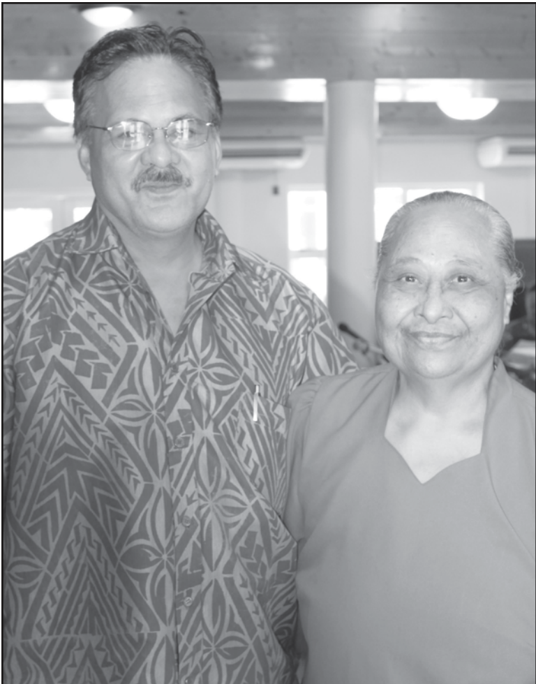
Senator Fonoti Tafa'ifa Aufata with Senator Paepae Iosefa Faiai who was confirmed yesterday by the Senate as an associate judge of the High Court of American Samoa. See story for details.