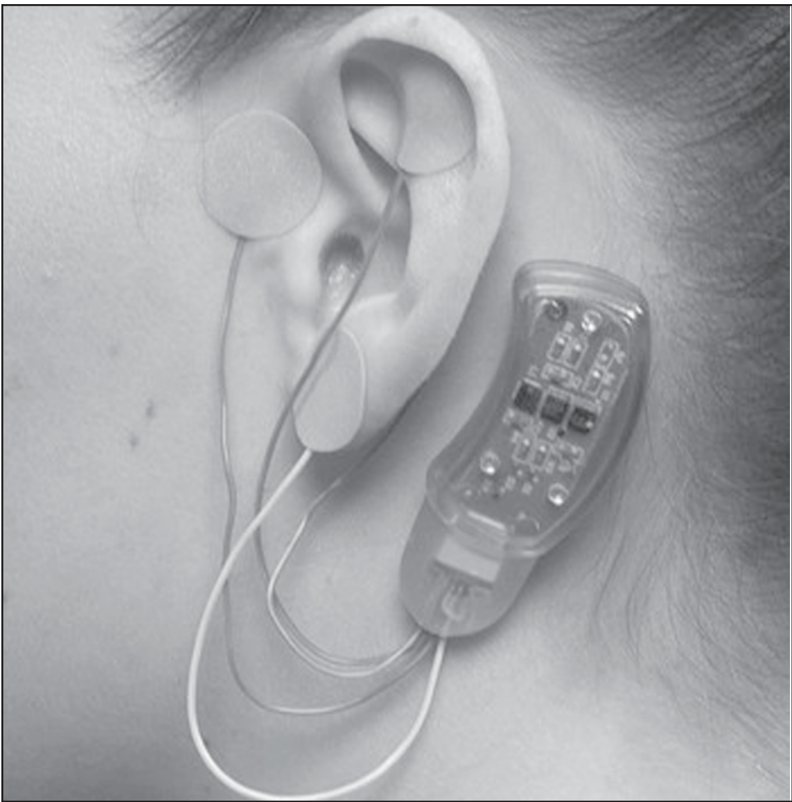
This photo provided by Innovative Health Solutions shows the NSS-2 Bridge. On Wednesday, Nov. 15, 2017, the Food and Drug Administration announced clearance of the NSS-2 Bridge, a brain-stimulating device for patients suffering from debilitating withdrawal symptoms caused by addiction to heroin and other opioids. The nerve stimulator is the first device to treat such symptoms including joint pain, anxiety, stomach aches and insomnia.