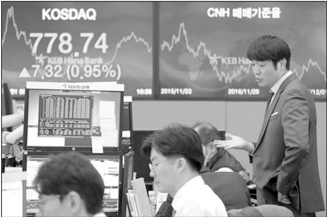
Currency traders work at the foreign exchange dealing room of the KEB Hana Bank headquarters in Seoul, South Korea, Friday, Dec. 1, 2017. Asian stock markets were marginally higher Friday, after an overnight recovery of technology stocks on Wall Street. An agreement among key crude exporting countries to extend oil output cuts boosted sentiment.