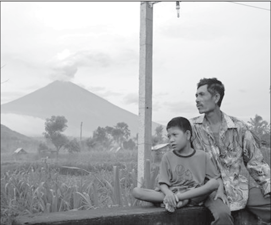
A father sits with his son with a backdrop of the Mount Agung volcano in Karangasem, Bali, Indonesia, Friday, Dec. 1, 2017. The island’s airport reopened Wednesday after being closed for 2 1/2 days and thousands of tourists are now leaving. About 40,000 residents from Mount Agung’s danger zone are staying in shelters. Ash could drift back and force the airport and to close again.

The program, which will air Monday on the Hallmark Channel, was hosted by Kathie Lee Gifford and actor Dean Cain and featured performances by the Beach Boys, Jack Wagner, Wynonna Judd, Craig Campbell and others.