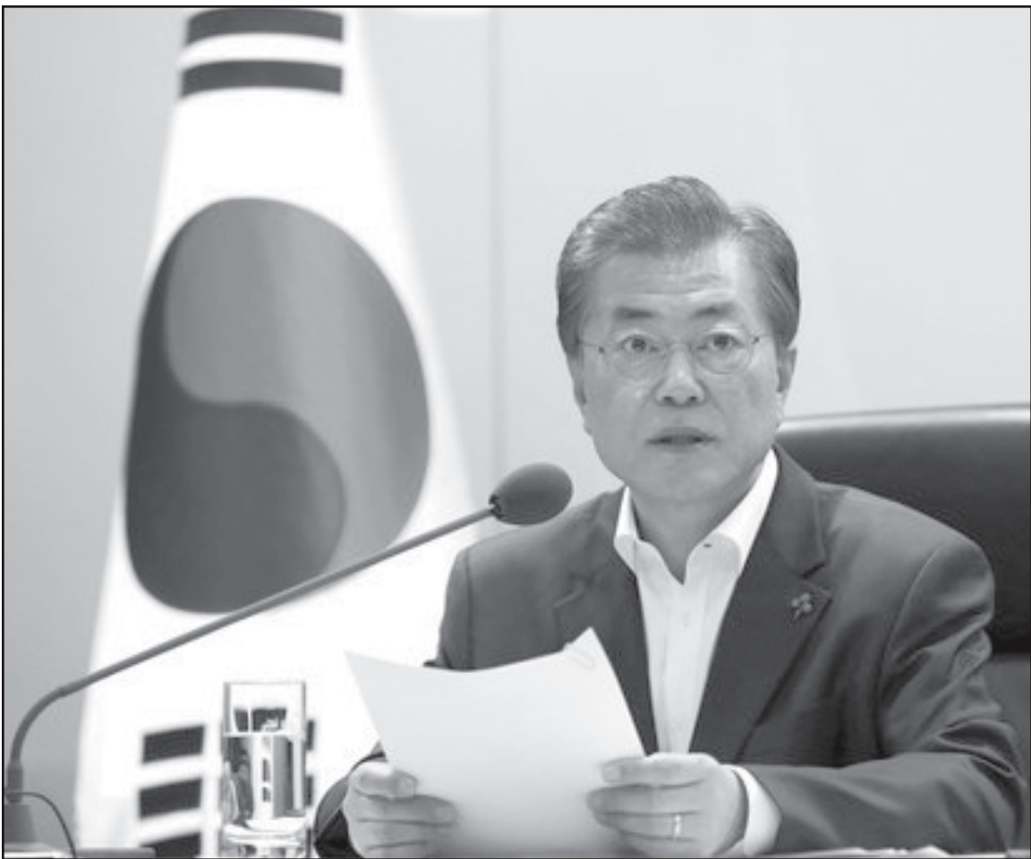
FILE - In this Wednesday, Nov. 29, 2017, file photo, South Korean President Moon Jae-in speaks as he presides over a meeting of the National Security Council at the presidential Blue House in Seoul, South Korea. North Korea,Äôs latest missile launch is a frustrating development for South Korean organizers of the Pyeongchang Winter Olympics, just 10 weeks away from the opening ceremony.