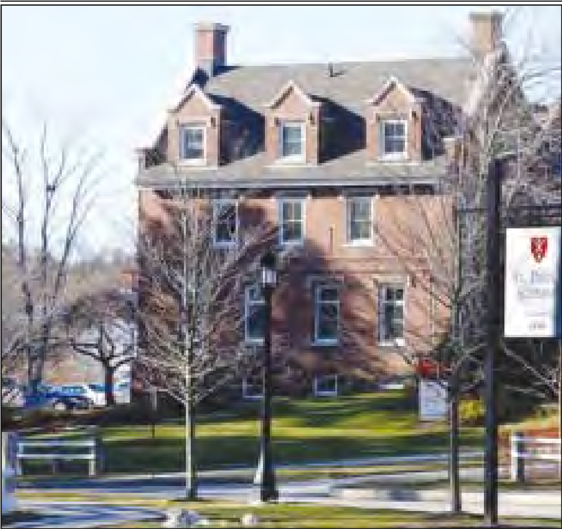
FILE - This Feb. 26, 2016 file photo shows the entrance to St. Paul's School in Concord, N.H. The prep school released a report in May 2017 detailing allegations of sexual abuse against a dozen men and one woman who worked at the school between 1947 and 1999. An addendum released late Wednesday, Nov. 1, 2017, includes five staffers not previously identified, and outlines abuse that occurred up to 2009.