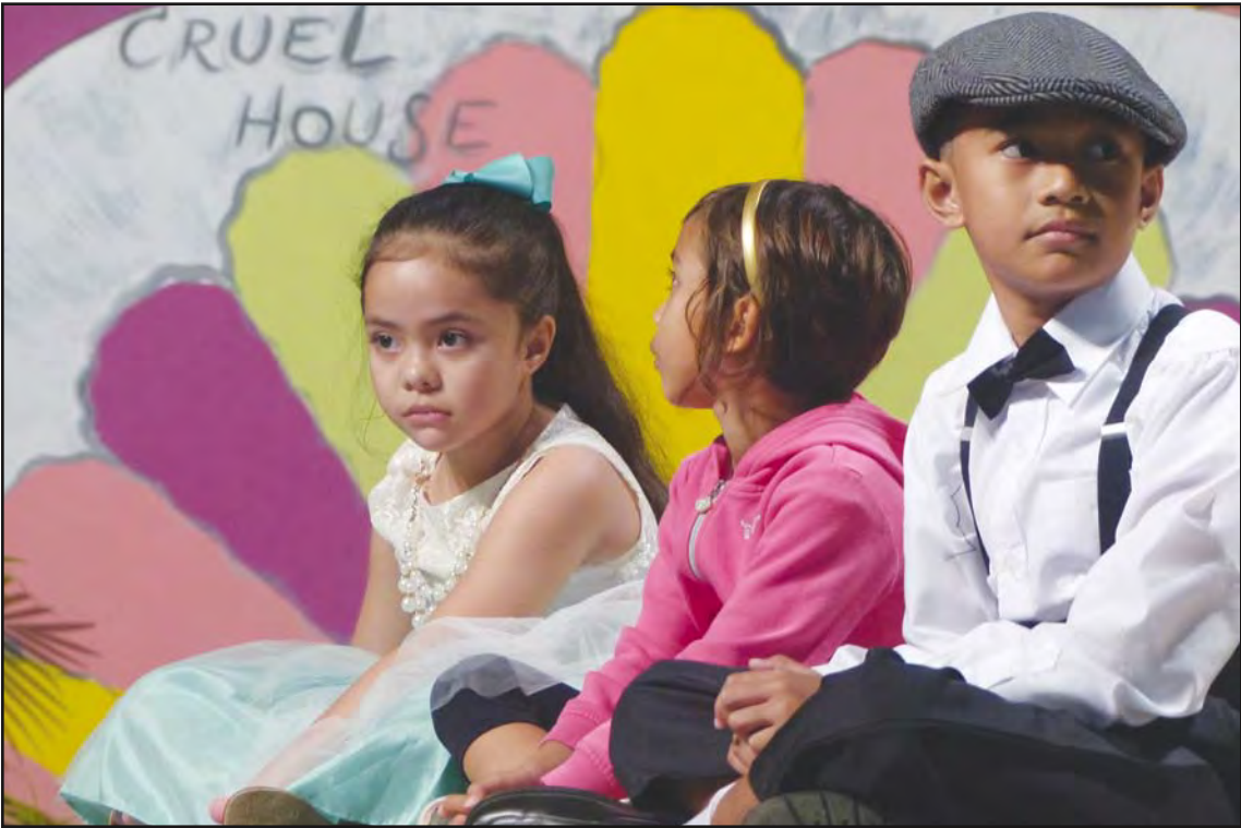
O le vaega amata o le fa'atinoga o le Ata Pese Twinderella, sa va'aia ai le vaega lea, o lo'o fia maimoa ma fa'afogoga i le tala'aga o Cinderella ma le tama o Bob, ma o lo'o fa'asoa i latou i le tala na latou fa'alogo muamua ai.