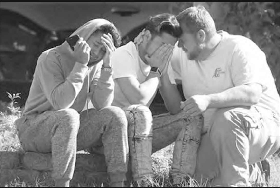
Workers from the Advanced Granite Solutions company console each other as police and Emergency Medical Services respond to a shooting at a business park in the Edgewood area of Harford County, Md., Wednesday, Oct. 18, 2017. A gunman opened fire at the office park killing several co-workers and wounded others, authorities said.