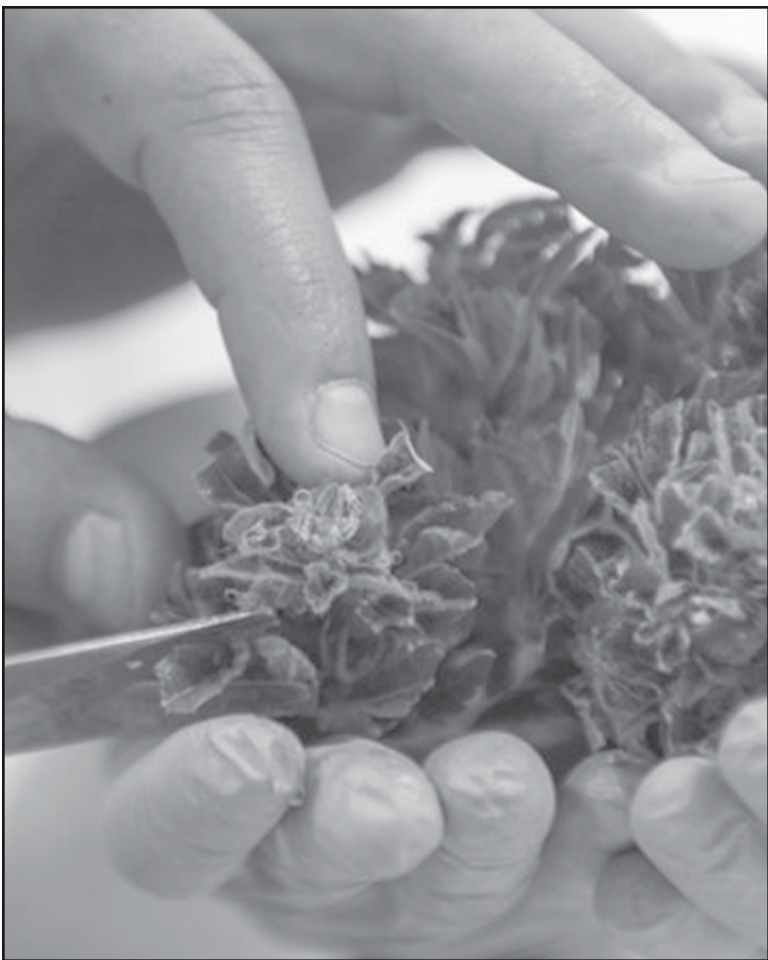
New Zealand will have a referendum on legalizing marijuana for personal use as part of the Greens deal with Labor.