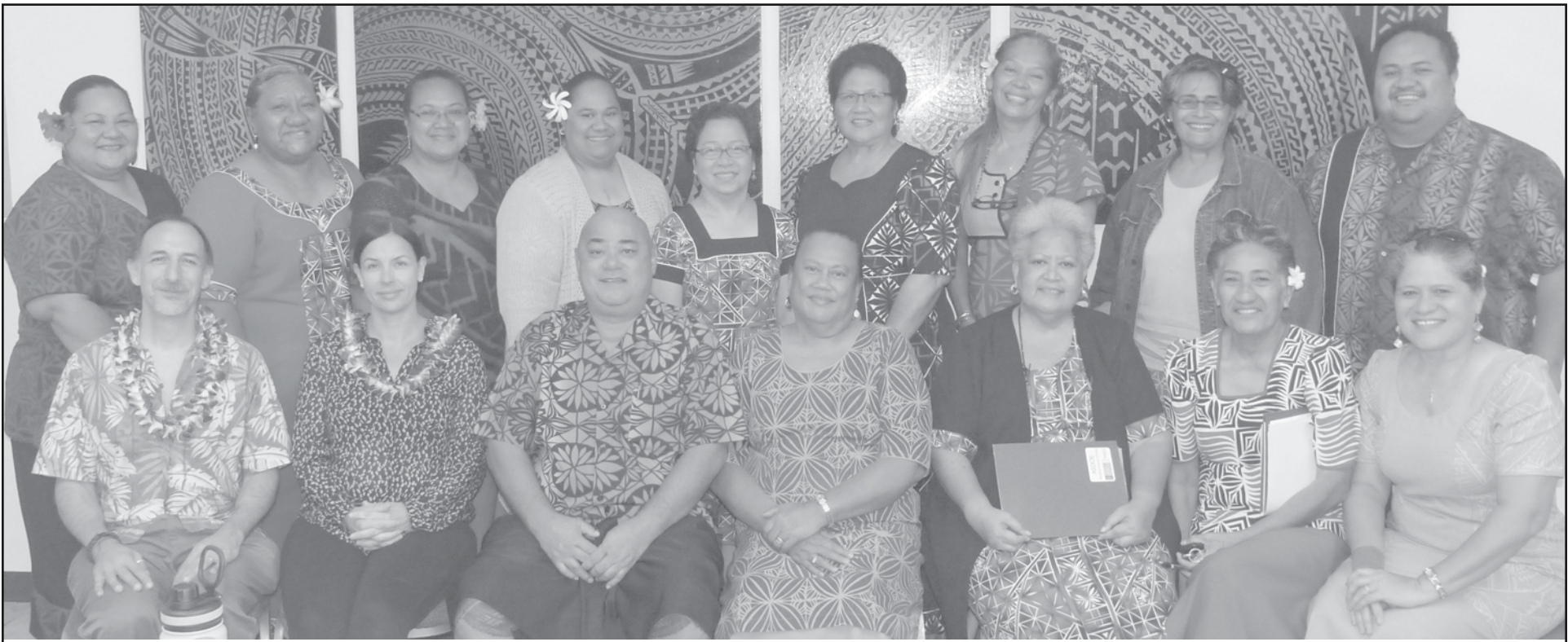
O ta'ita'i o Vaega Eseese o le Matagaluega o A'oga sa soalaupule i ala e mafai ai ona fa'amautu le auivi e ta'iala ai le fa'aulufaleina o le “ESSA” e suia ai le “No Child Left Behind” lea ua mae'a fa'atulafonoina e Peresetene OBama ia Tesema 2015.