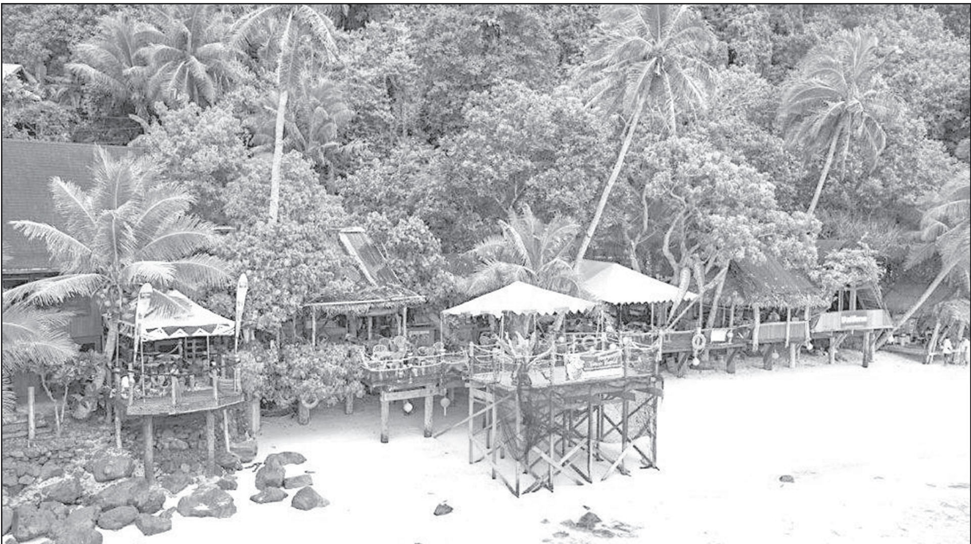
An aerial view of Tisa's Barefoot Bar during the 2016 Tattoo Festival.