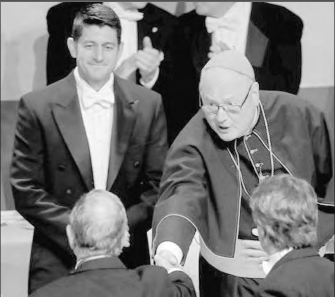
Cardinal Timothy Dolan, right, shakes hands with former New York City Mayor Michael Bloomberg as Speaker of the House Paul Ryan, left, looks on during the 72nd Annual Alfred E. Smith Memorial Foundation dinner Thursday, Oct. 19, 2017, in New York.