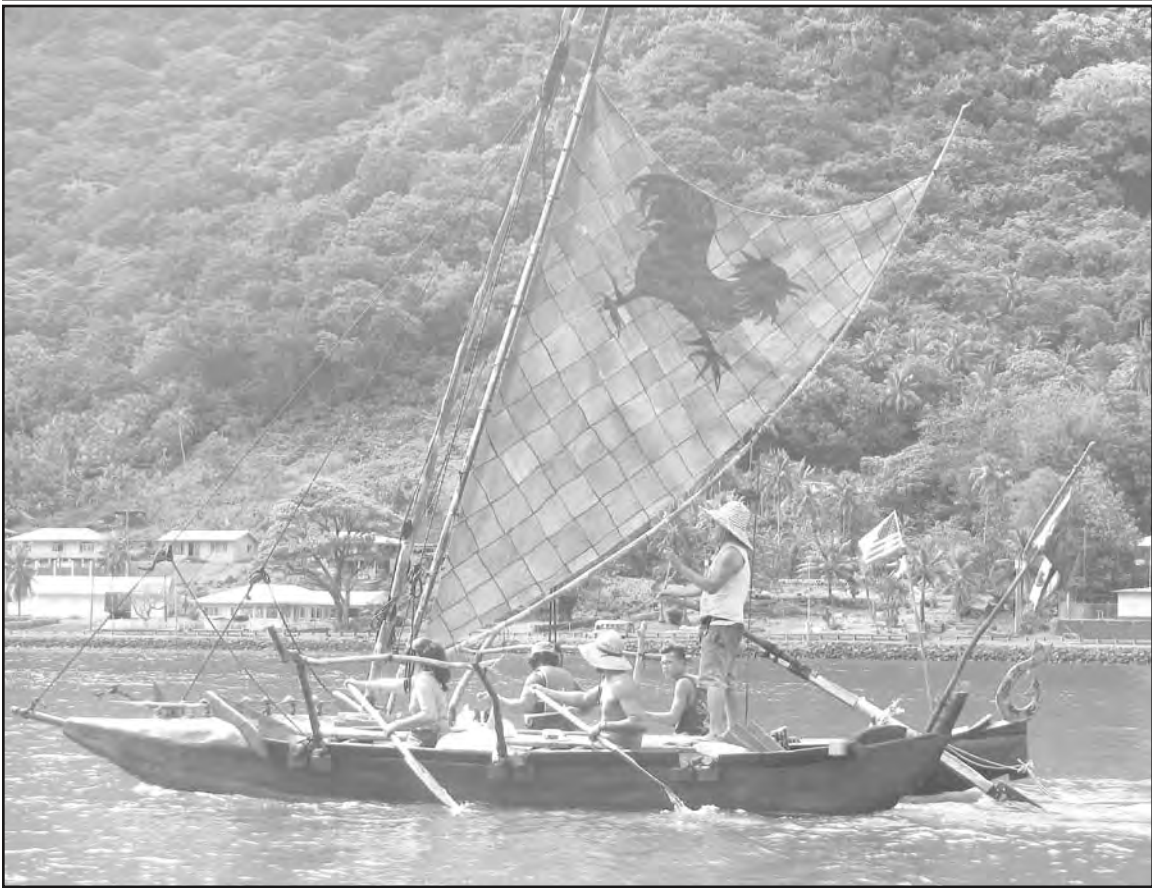
Everyone is excited to welcome the sailing 'alia canoe, 'Apaula' to Tisa's Annual Tattoo Festival 2017.