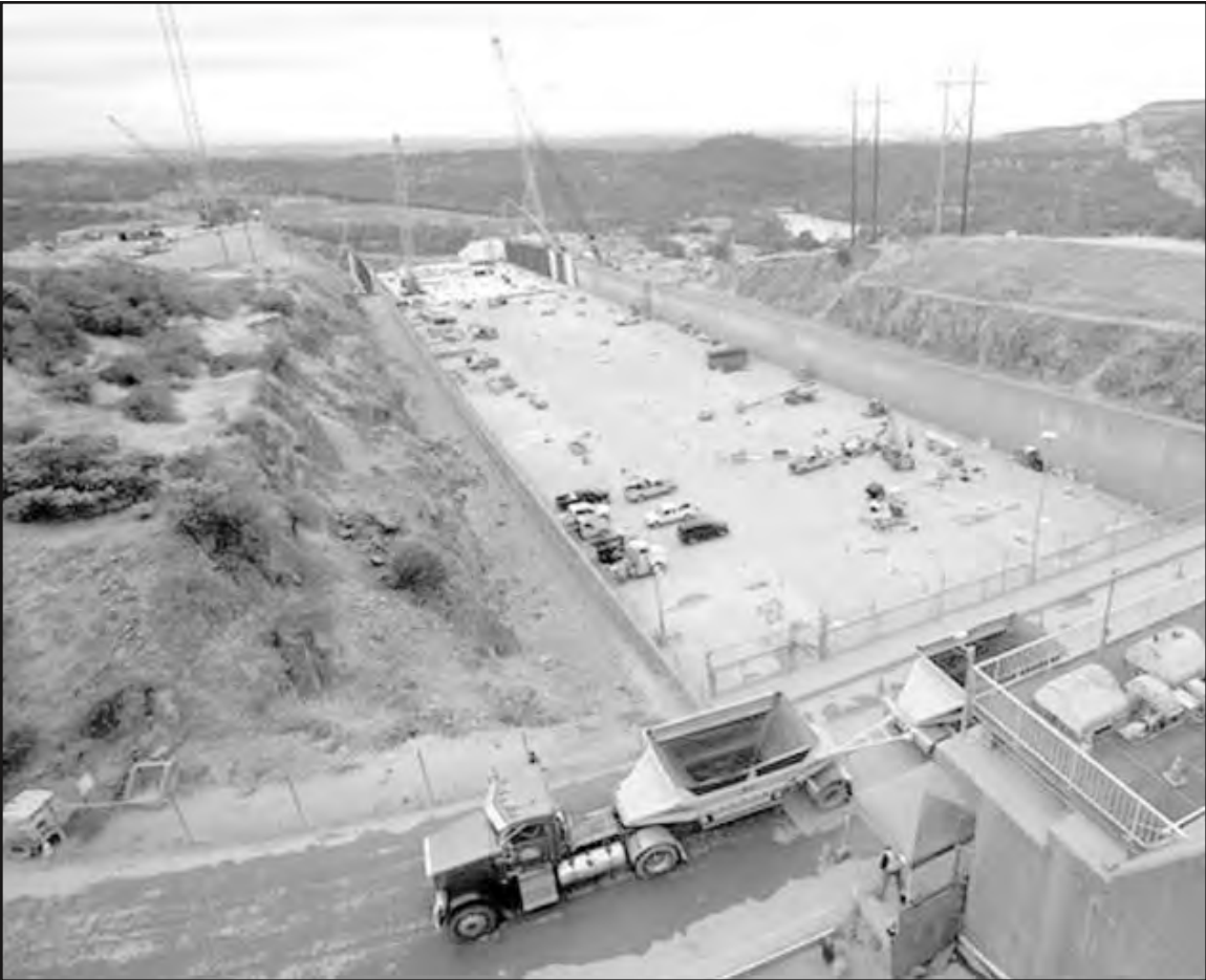
Work continues to repair the damaged main spillway of the Oroville Dam on Thursday, Oct. 19, 2017, in Oroville, Calif. California officials say repair costs at the nation’s tallest dam will be nearly double the original estimate of $275 million. The main spillway and emergency spillway suffered significant damage during storms last February, prompting fears of massive flooding.

Only one Republican, Rand Paul of Kentucky, voted against the budget. He said the measure permits too much spending and abandons the GOP drive to repeal the Obama health law.