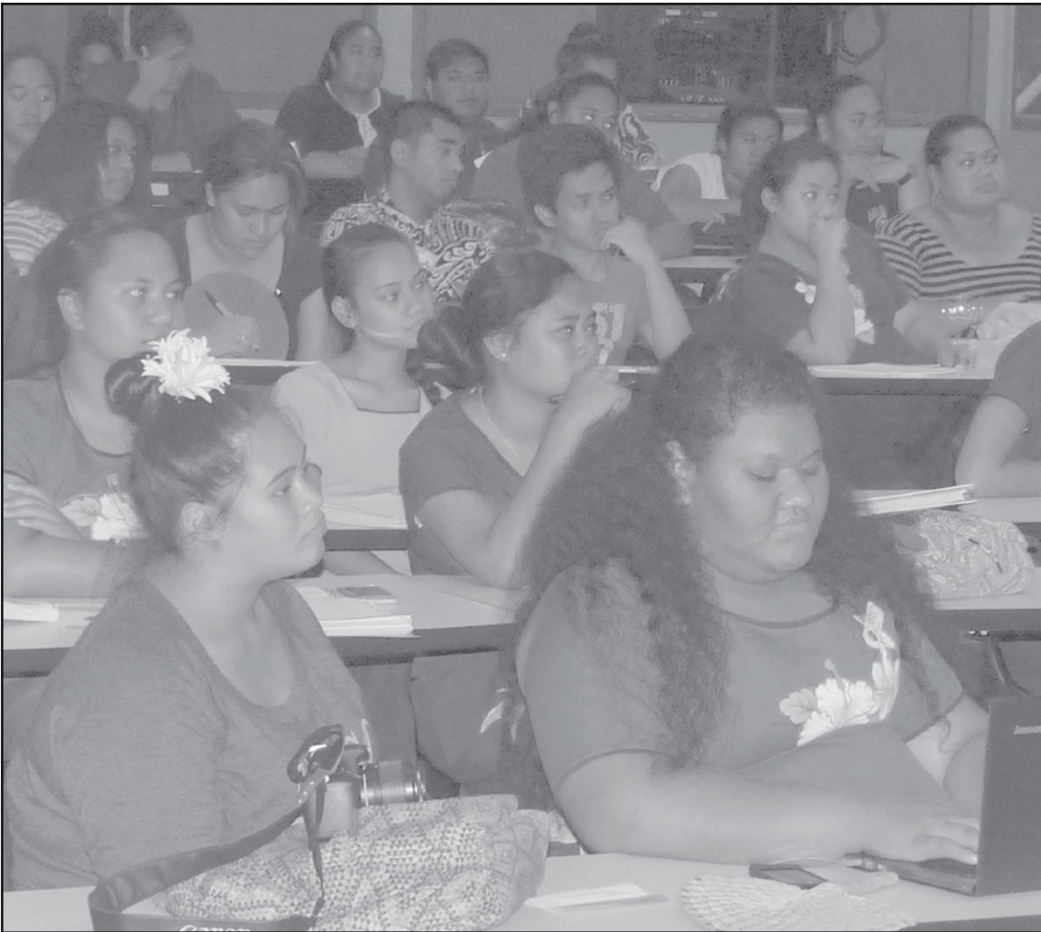
O se va'aiga i nisi o i latou i le vasega pisinisi i le Kolisi Tu'ufa'atasi i le fa'atasiga ma se sui sinia mai le Ofisa o le Kovana, mo le talanoaina o nisi o mataupu e faatatau i le malo.

O ni isi o tuutuuga ua tuuina atu e le fa'amasinoga e usita'i ia i Lomiga pe afai na te totogiina le $5,000, e aofia ai le faasa lea ona ia toe taumafai e faafesootai le alii na aafia, faasa ona ia toe solia se tulafono, a ia avea o ia ma tagatanu'u e tausisi i tulafono a le malo i soo se taimi.