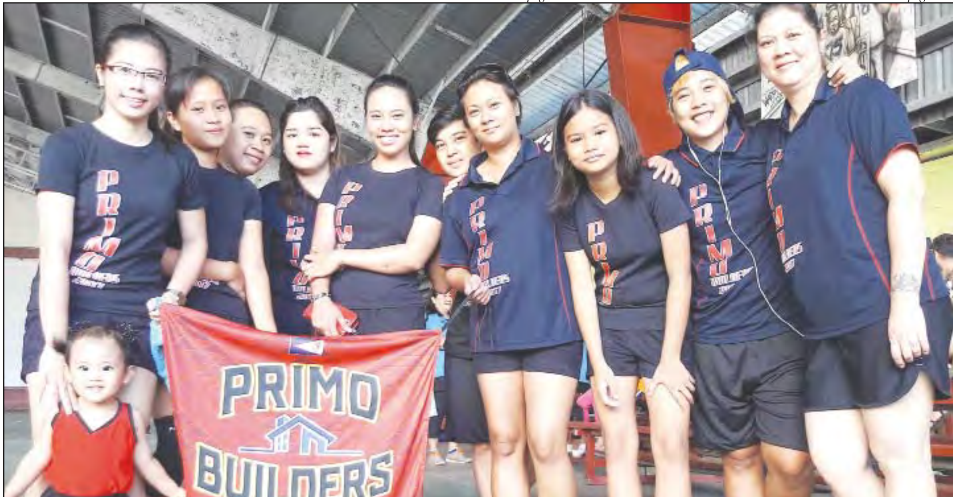
Team Primo Builders is the defending women's volleyball champs from last year's Filipino Community Sports League. The team is defending its title during the Filipino Community of American Samoa Sports League 2017 which kicked off Sunday, October 15.