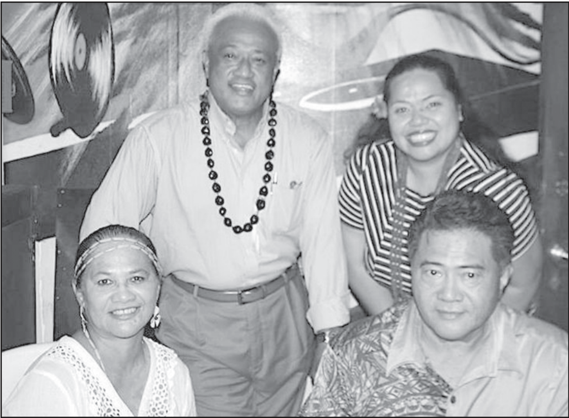
Some members of the Samoa Jazz & Arts Festival Committee during one of their recent fundraisers at the Oasis Nite Club, with the funds raised going toward this year’s festival, set to open in American Samoa on Friday, Nov. 4 thru Sunday, Nov. 6 — and closes in Samoa Friday, Nov. 11 thru Sunday, Nov. 13. The festival seeks to build local partnerships with education, culture, music and art associations in the 2Samoa under the Samoa Festival banner.

Even the conservative estimate of 9 million pollution-related deaths is one-and-a-half times higher than the number of people killed by smoking, three times the number killed by AIDS, tuberculosis and malaria combined, more than six times the number killed in road accidents, and 15 times the number killed in war or other forms of violence, according to GBD tallies. It is most often the world’s poorest who suffer. The vast majority of pollution-related deaths — 92 percent — occur in low- or middle-income developing countries, where policy makers are chiefly concerned with developing their economies, lifting people out of poverty and building basic infrastructure, the study found.