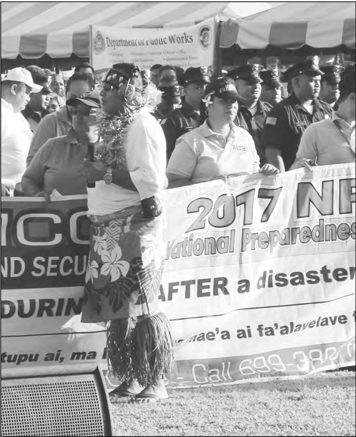
Local Department of Homeland Security personnel came out in full force last Friday during Workforce Appreciation Day which was held at the Veterans Memorial Stadium in Tafuna.

“Military action would certainly be an option,” Trump told a White House news conference. “I would prefer not going the route of the military, but it’s something certainly that could happen.”