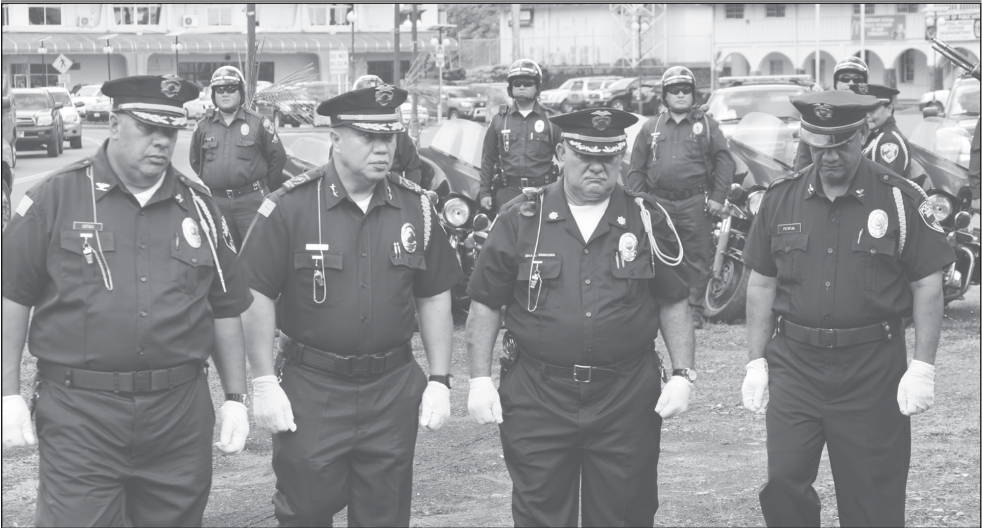
Seniors police officers parading during Police Week celebration earlier this year at Malaeoletalu in Fagatogo. DPS has a new established unit - the Training Division - which is set up to provide training for local police officers. See story for full details.