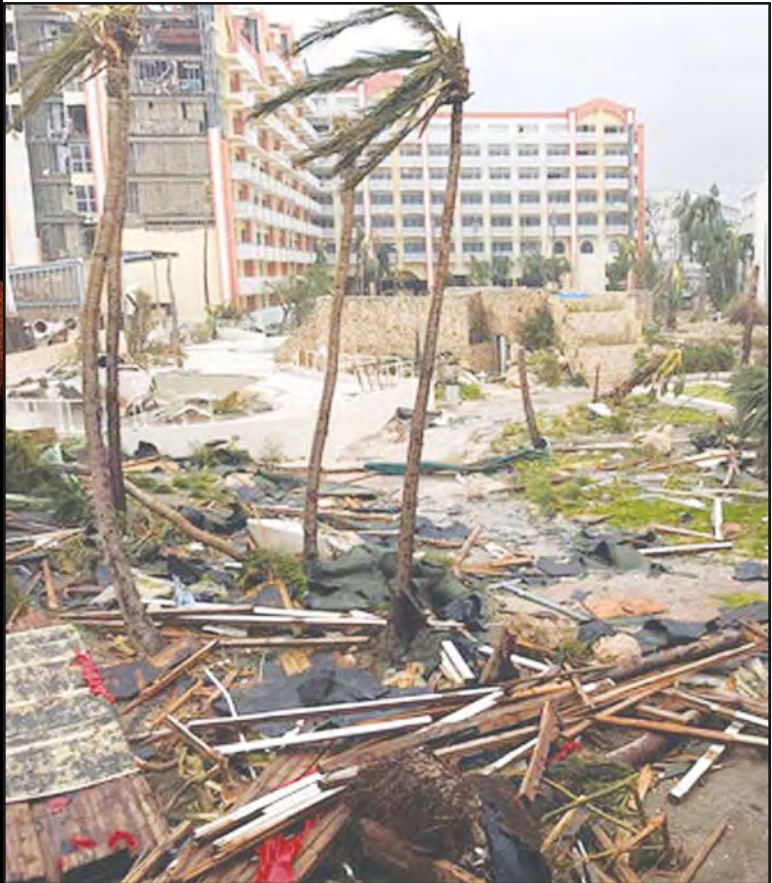
This Sept. 6, 2017 photo shows storm damage in the aftermath of Hurricane Irma in St. Martin. Irma cut a path of devastation across the northern Caribbean, leaving thousands homeless after destroying buildings and uprooting trees. Significant damage was reported on the island known as St. Martin in English which is divided between French Saint-Martin and Dutch Sint Maarten.