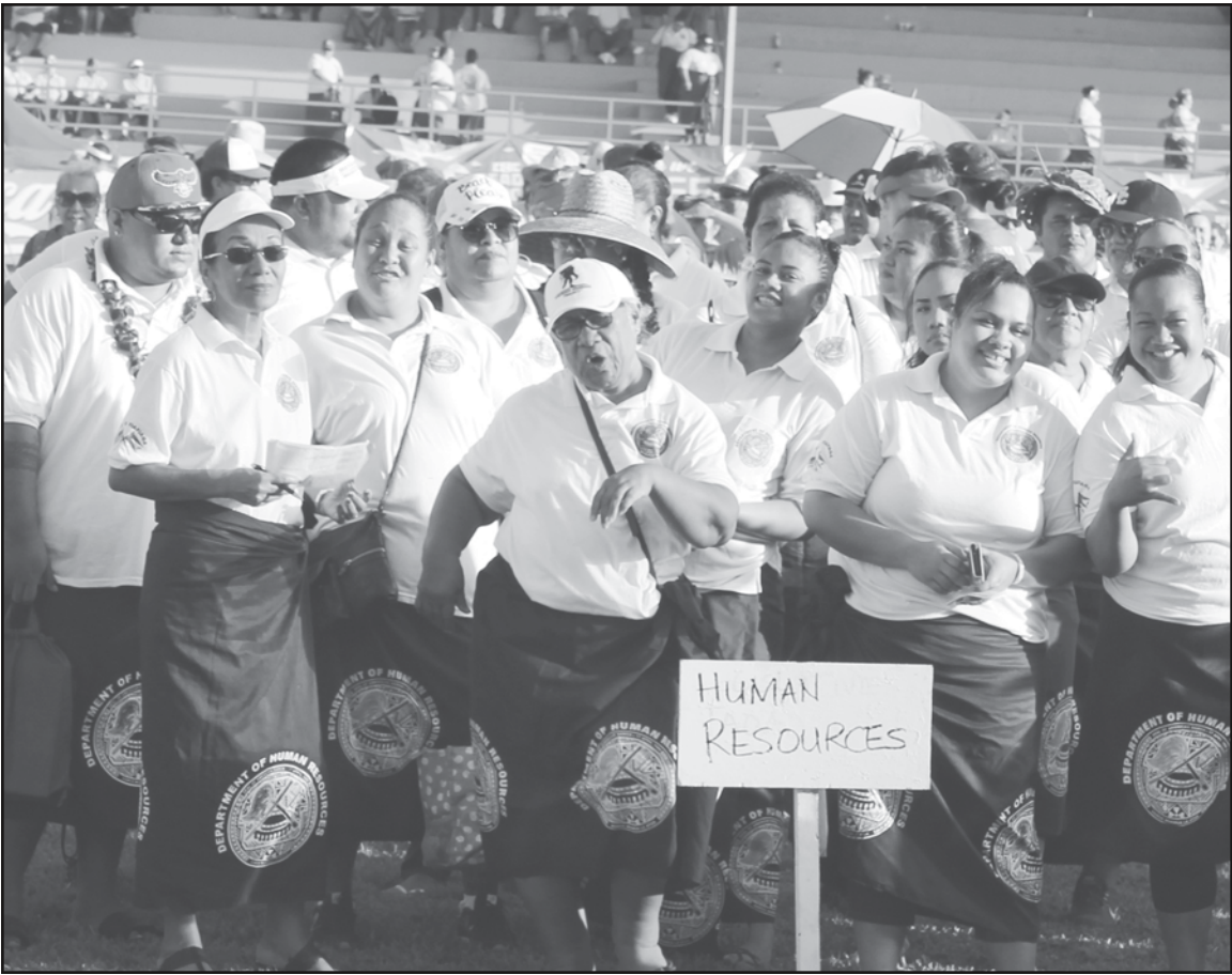
Department of Human Resources with an early morning show for the Samoa News camera as they await the start of Workforce Appreciation Day held at the Veterans Memorial Stadium last Friday.