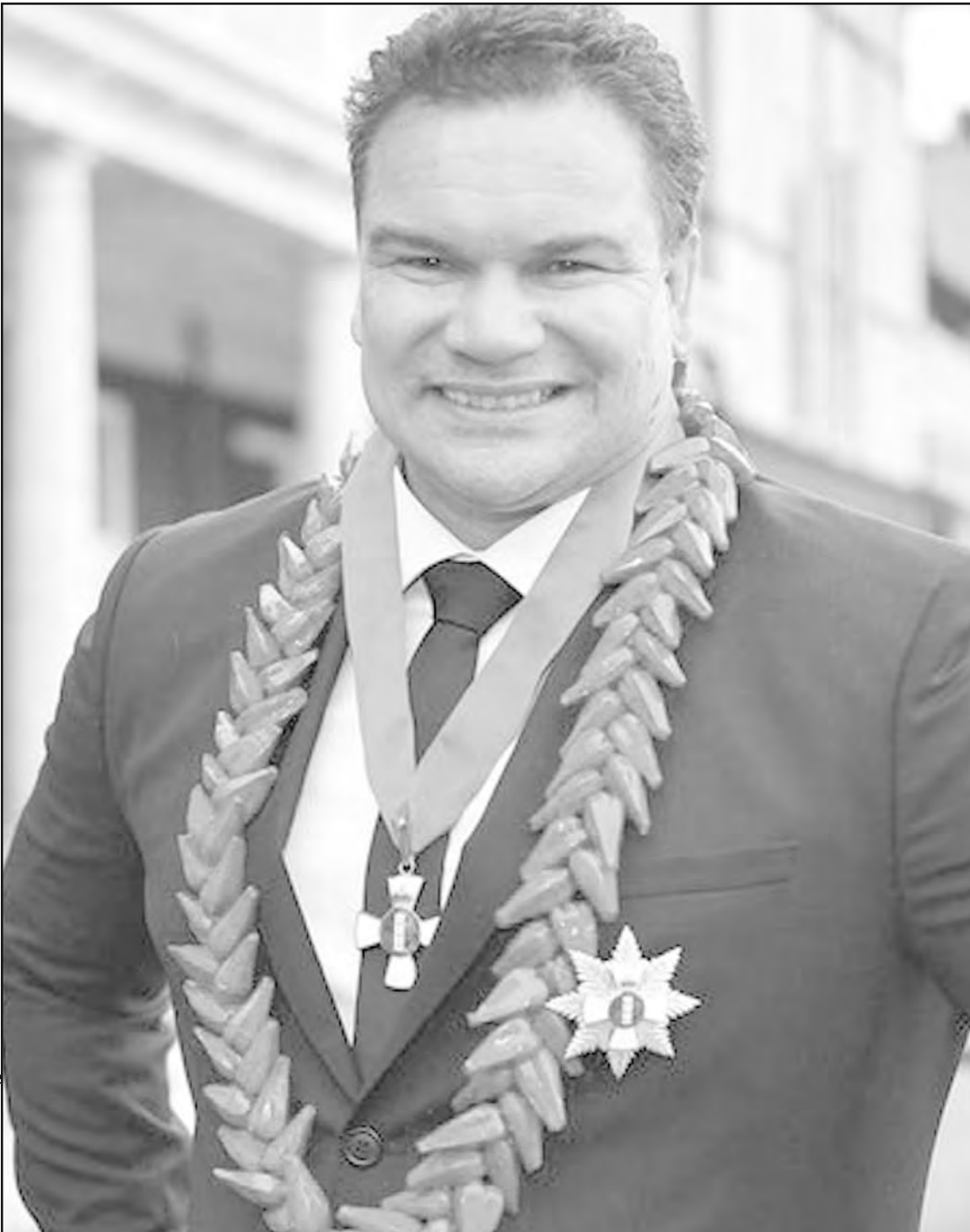
Sir Michael Jones at Government House.

Na taua atili e lea faipule e fa'apea, "Afai o matou o ta'ita'i ua filifilia e itumalo e fai ma o latou sui, e tatau ona matou faia fa'ata'ita'iga lelei ina ia mulimuli ai tupulaga o le lumana'i, aua afai o ituaiga fa'ata'ita'iga nei e faia e i matou nei o ta'it'a'i, o le fai mai o le Fa'avae Toe Teuteu a le atunu'u, e le tatau ona galue se tasi i galuega a le malo ae toe avea fo'i ma faipule poo se senatoa, ae tau solomua ta'ita'i ona le tausisi i le Fa'avae."