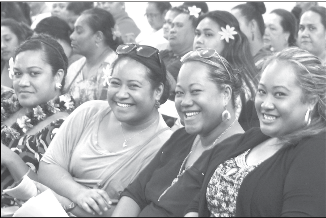
DOE teachers from the eastern district schools attended a special seminar on social issues within schools, this past Wednesday at the Fale Laumei, as part of their annual orientation before the start of the new school year.