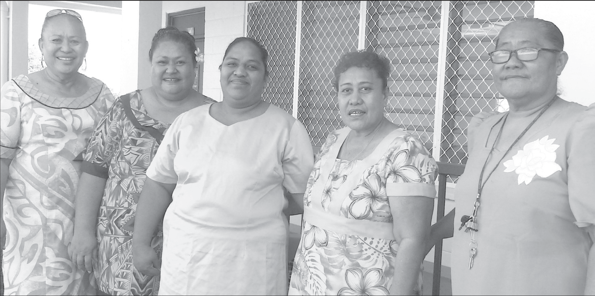
Teachers and PTA members of Fagalii Elementary School, posing for Samoa News prior to the official opening of their school buildings yesterday.