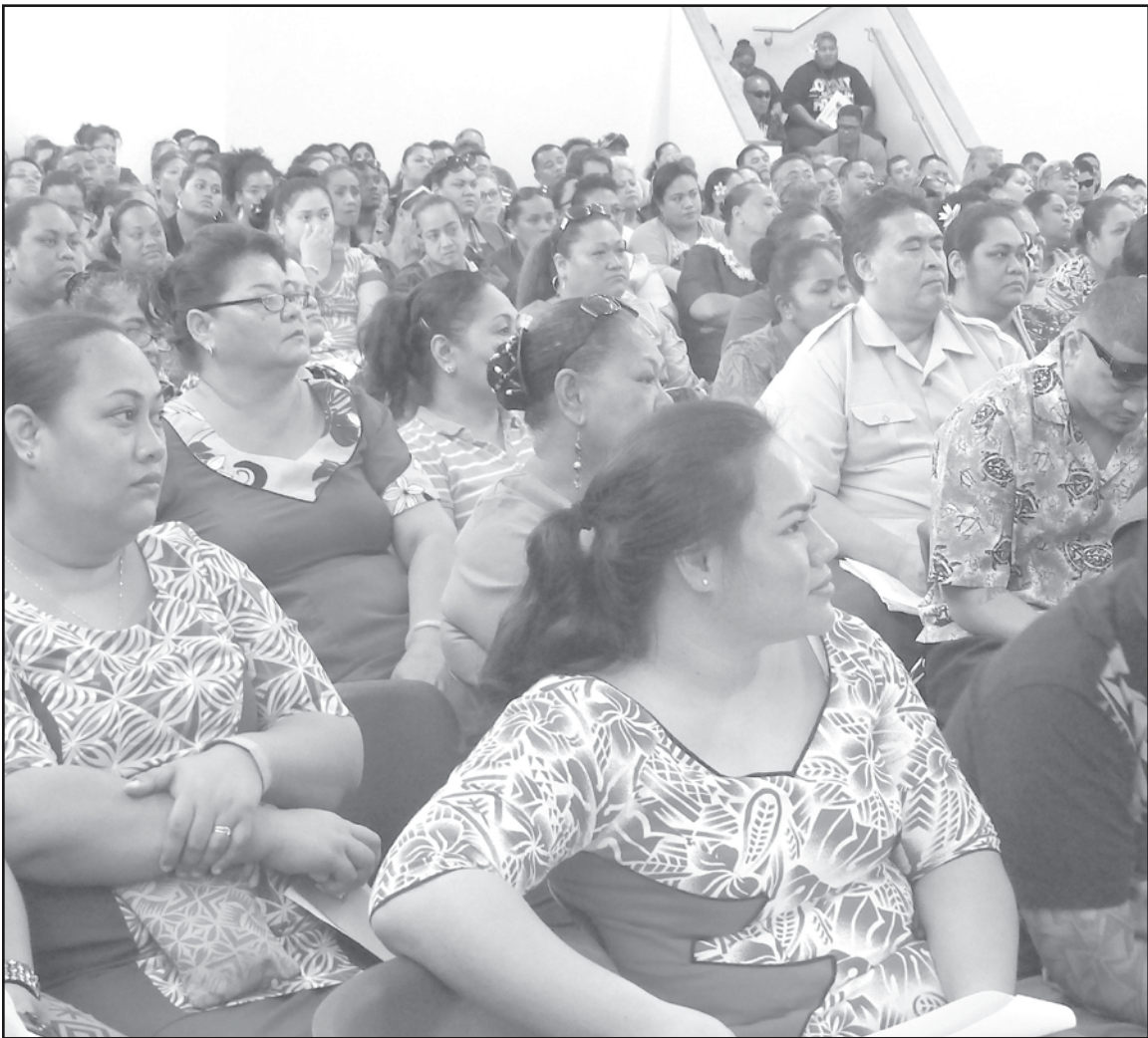
Some of the DOE teachers from the west side who attended the orientation seminars being hosted by the Dept. of Education this week, to prepare the educators for the start of the new school year.