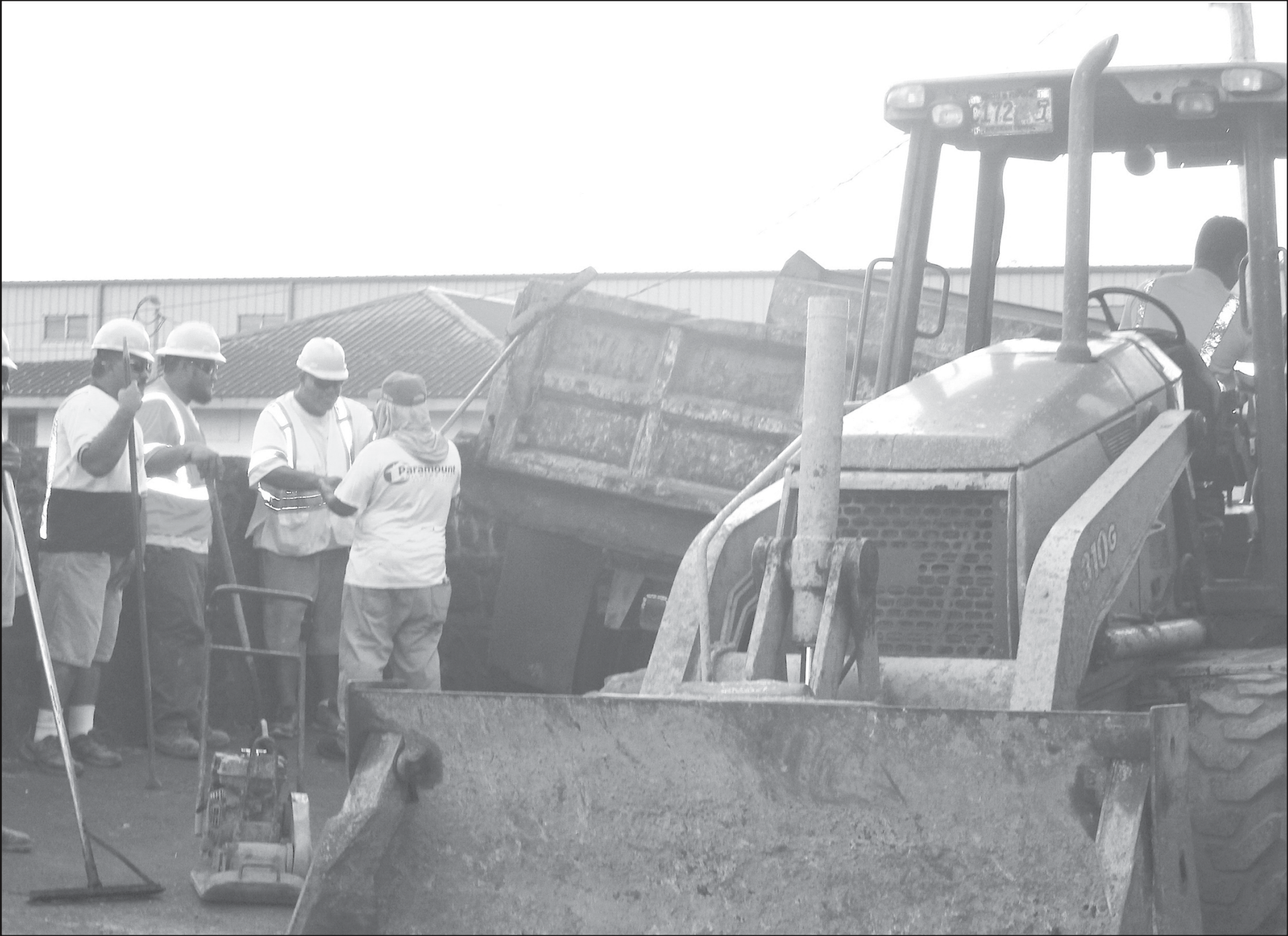
Crew members from Paramount Builders were seen late Wednesday afternoon prepping some of the numerous large pot holes on Fagaima Road, to fill them with tar. The area sees a lot of traffic during morning and afternoon hours; and residents of Fagaima and Ottoville, along with motorists who frequently drive on this road, have long complained about the poor conditions, which gets worse every time it rains.