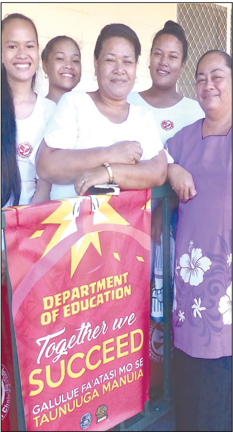
Teachers and students of Fagalii Elementary School in front of one of their three new school buildings dedicated yesterday at the far west side of the territory.