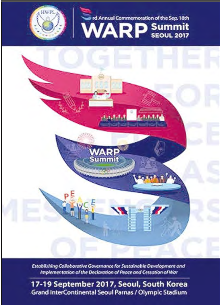
Official poster of the 3rd WARP Summit 2017