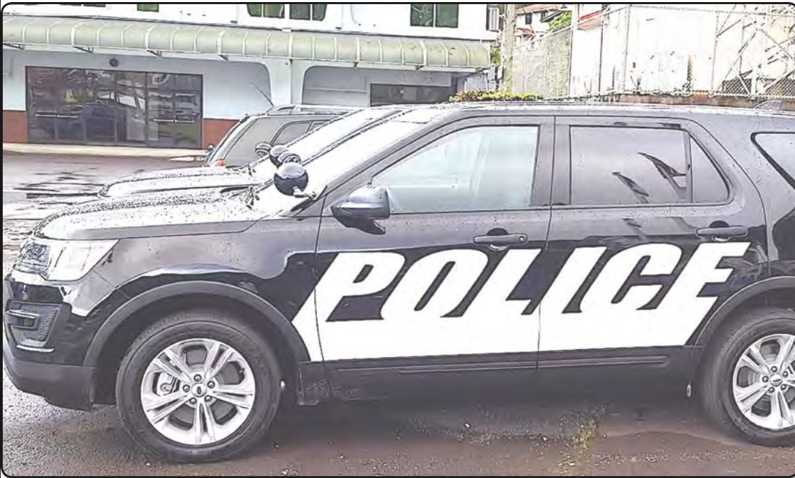
A look at some of the newest additions to the DPS fleet of vehicles — two brand new black Ford 'Interceptors' — now parked in front of the Central Police Station. Samoa News could not confirm as of press time yesterday, which DPS division the cars will go to, but sources say the purchase was a 'special order' that came with an estimated total price tag in excess of $100K. Police vehicles are usually bought with money collected from traffic tickets or grant funds.