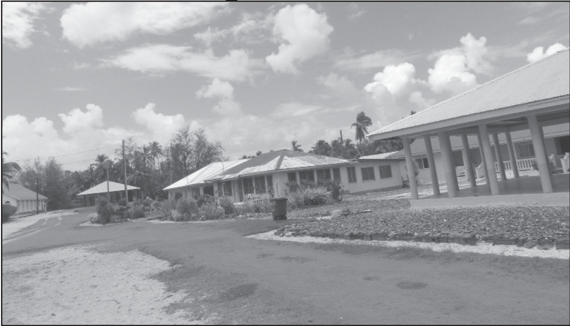
A look at the main area, or 'aai' of the island-village of Aunu'u, last Friday.

by Fili Sagapolutele Samoa News Correspondent