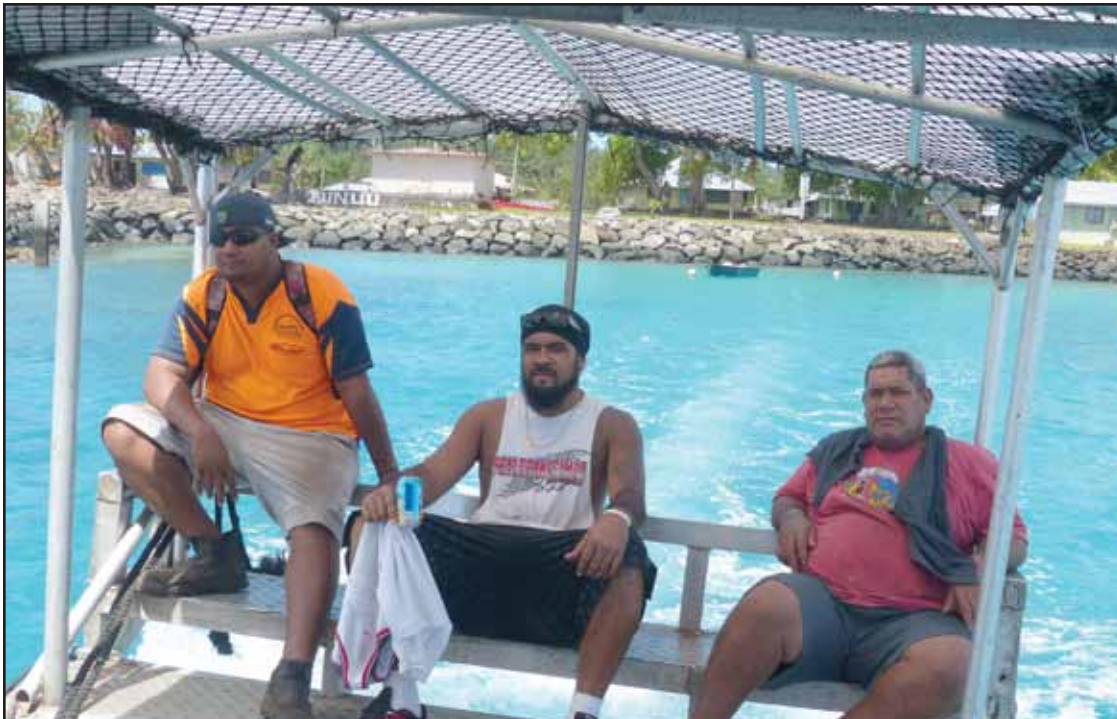
Three ASPA workers on a return boat ride last Friday from Aunu'u to Auasi. See story for details inside.