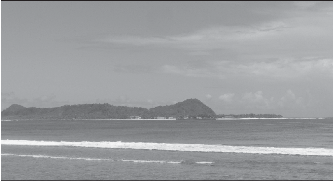
A Friday, March 16, 2018 Samoa News photo of the island-village of Aunu'u, taken during a boat ride from the Auasi wharf on Tutuila island.

Samoa News was told by the individual that he wasn't only going to Aunu'u to visit, he was looking at the possibility of setting up a business on the island-village. No further details were disclosed.