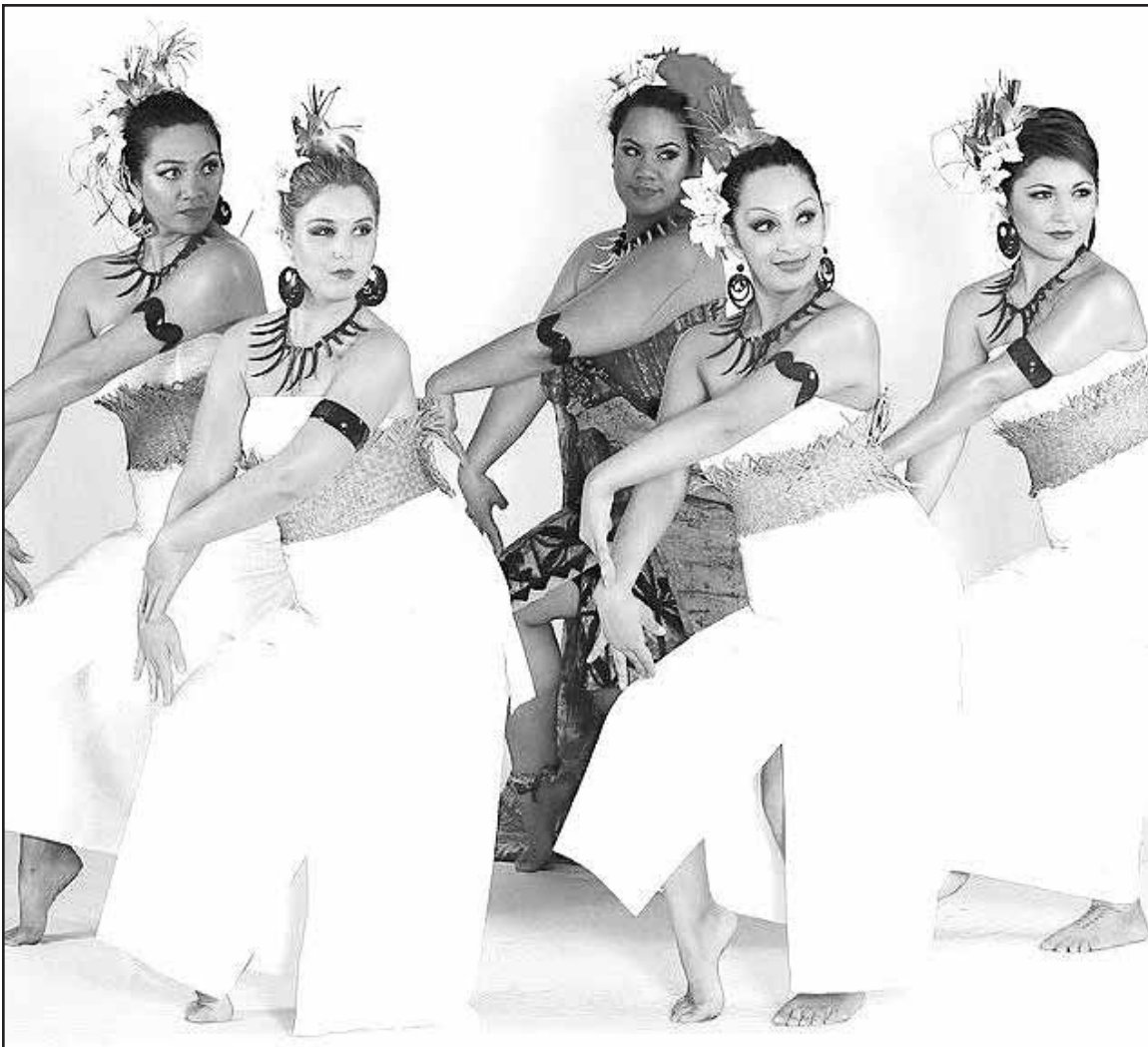
All-female Pacific dance group, Ura Tabu will be performing at this week's Pasifika Festival in Auckland, representing Samoa.