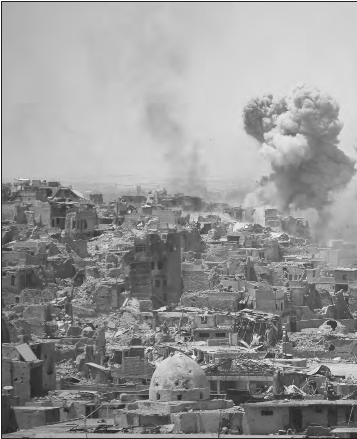
Airstrikes target Islamic State positions on the edge of the Old City a day after Iraq's prime minister declared "total victory" in Mosul, Iraq, Tuesday, July 11, 2017.