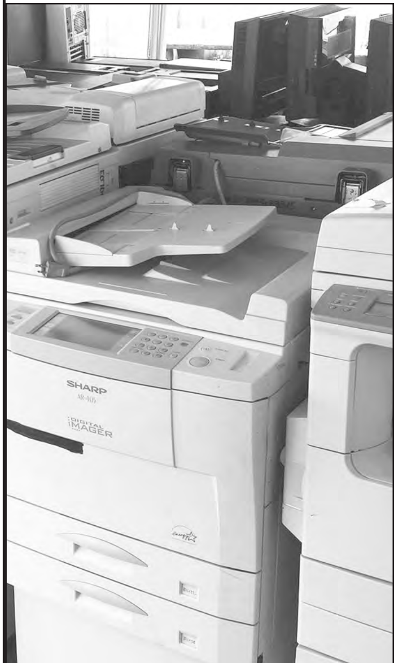
Some of the copy machines being auctioned off this week at the Office of Property Management. Items like used office equipment, kitchen appliances, jet skis and vehicles are being sold for pennies on the dollar during the auction.

Deadline for filing applications with the LBJ Office of Human Resources will be at July 21, 4:00 pm. Application forms are available at the Office of Human Resources.