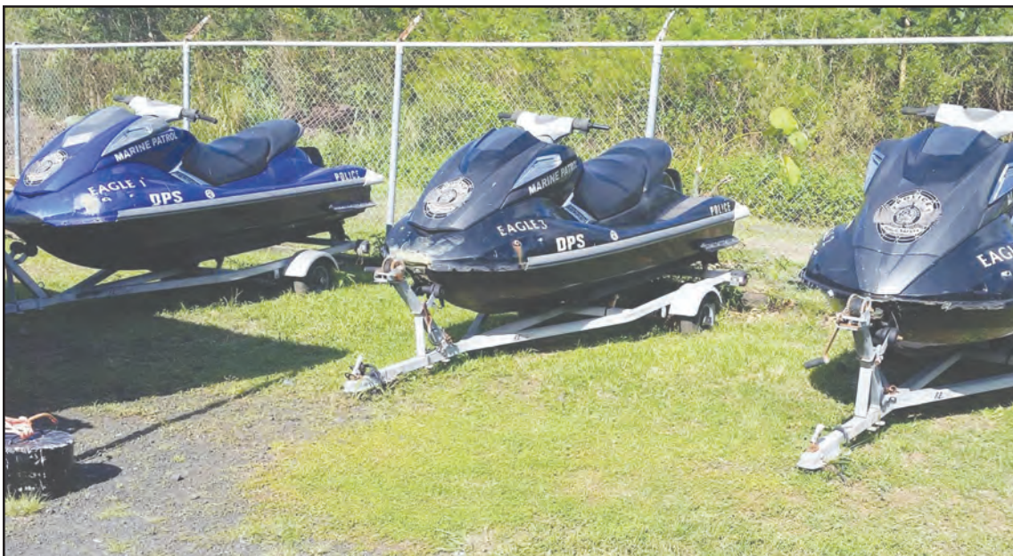
A look at the three jet skis that are being auctioned off at the Office of Property Management compound this week, as part of this quarter's ASG Public Auction. Dozens of used items like office equipment, commercial kitchen appliances, and vehicles from various government departments and agencies are being sold on an 'as is' basis during the event. Read story for full details.