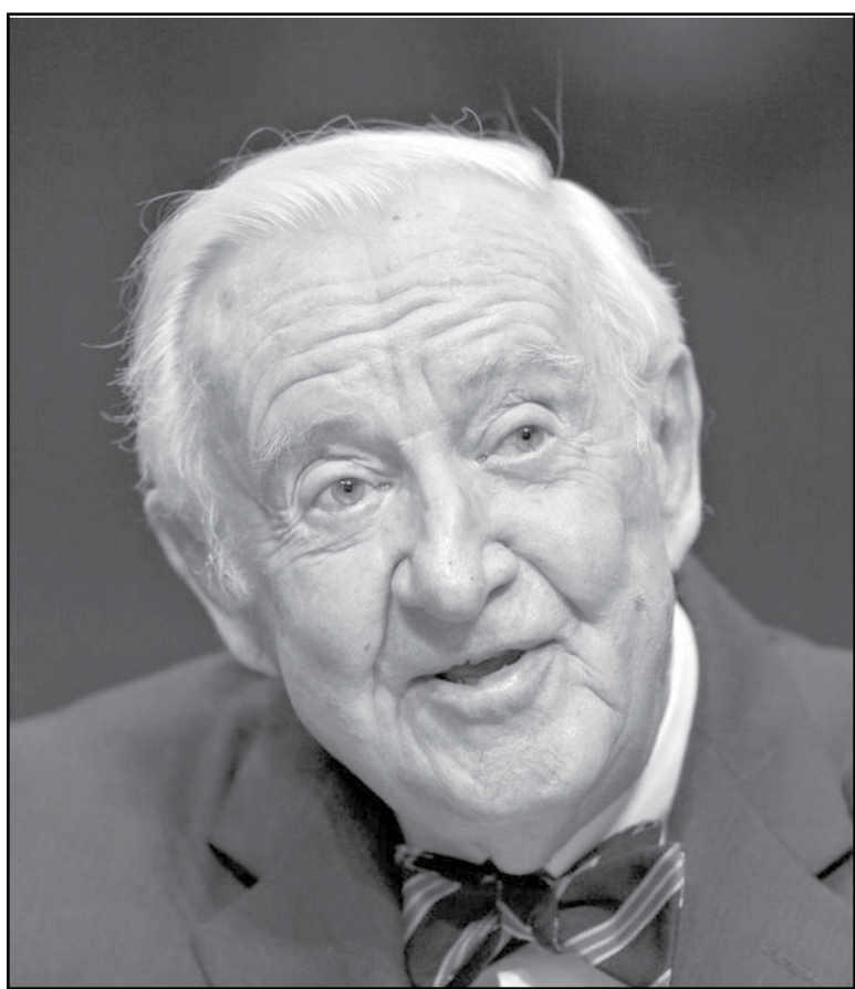
FILE - In this April 30, 2014, file photo, retired Supreme Court Justice John Paul Stevens testifies on the ever-increasing amount of money spent on elections as he appears before the Senate Rules Committee on Capitol Hill in Washington. Stevens is calling for the repeal of the Second Amendment to allow for significant gun control legislation. The 97-year-old Stevens says in an essay on The New York Times website that repeal would weaken the National Rifle Association's ability to "block constructive gun control legislation."