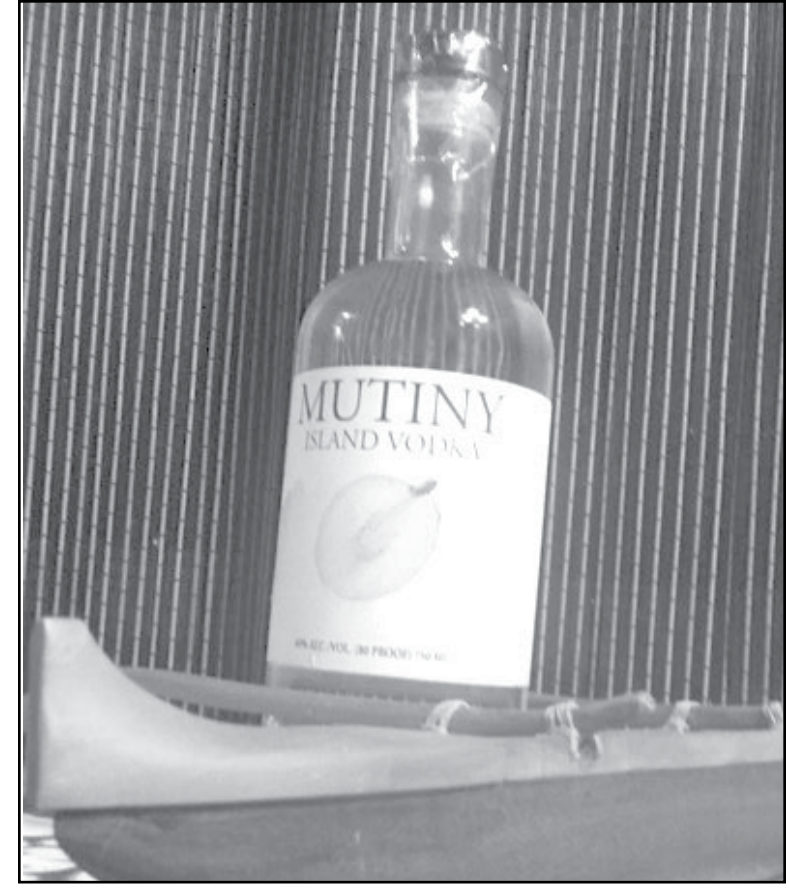
Mutiny Vodka distilled in the State of Virginia from breadfruit flour from American Samoa in the South Pacific, initiated as a product from the US Virgin Islands in the Caribbean.

LATEST IS "MUTINY" VODKA DISTILLED FROM BREADFRUIT FLOUR FROM AM SAMOA