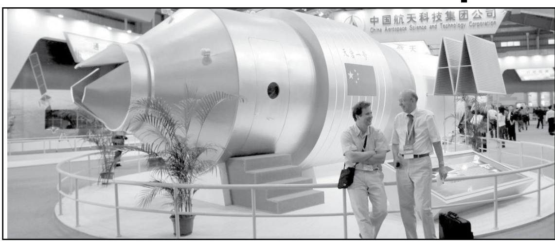
FILE - In this Nov. 16, 2010 file photo, visitors sit beside a model of China's Tiangong-1 space station at the 8th China International Aviation and Aerospace Exhibition in Zhuhai in southern China's Guangdong Province. China's defunct Tiangong 1 space station is expected to re-enter Earth's atmosphere within the next day. The European Space Agency forecast Sunday April 1, 2018 the station will re-enter sometime between Sunday night and early Monday morning GMT.