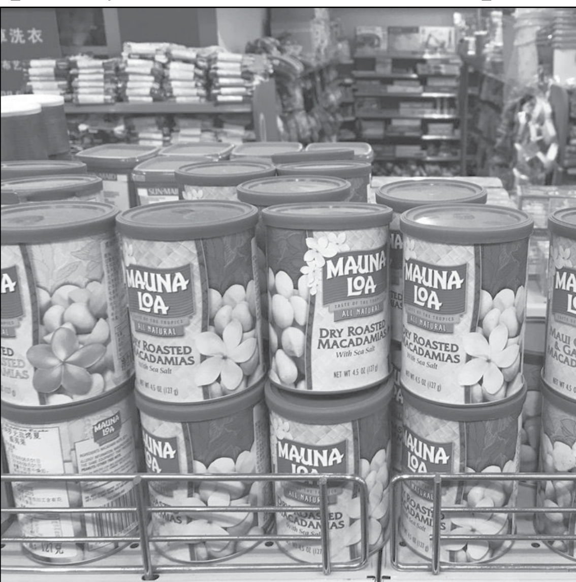
Imported nuts from the United States are displayed for sale at a supermarket in Beijing, Tuesday, April 3, 2018. China raised import duties on U.S. pork, fruit and other products Monday in an escalating tariff dispute with President Donald Trump that companies worry might depress global commerce.