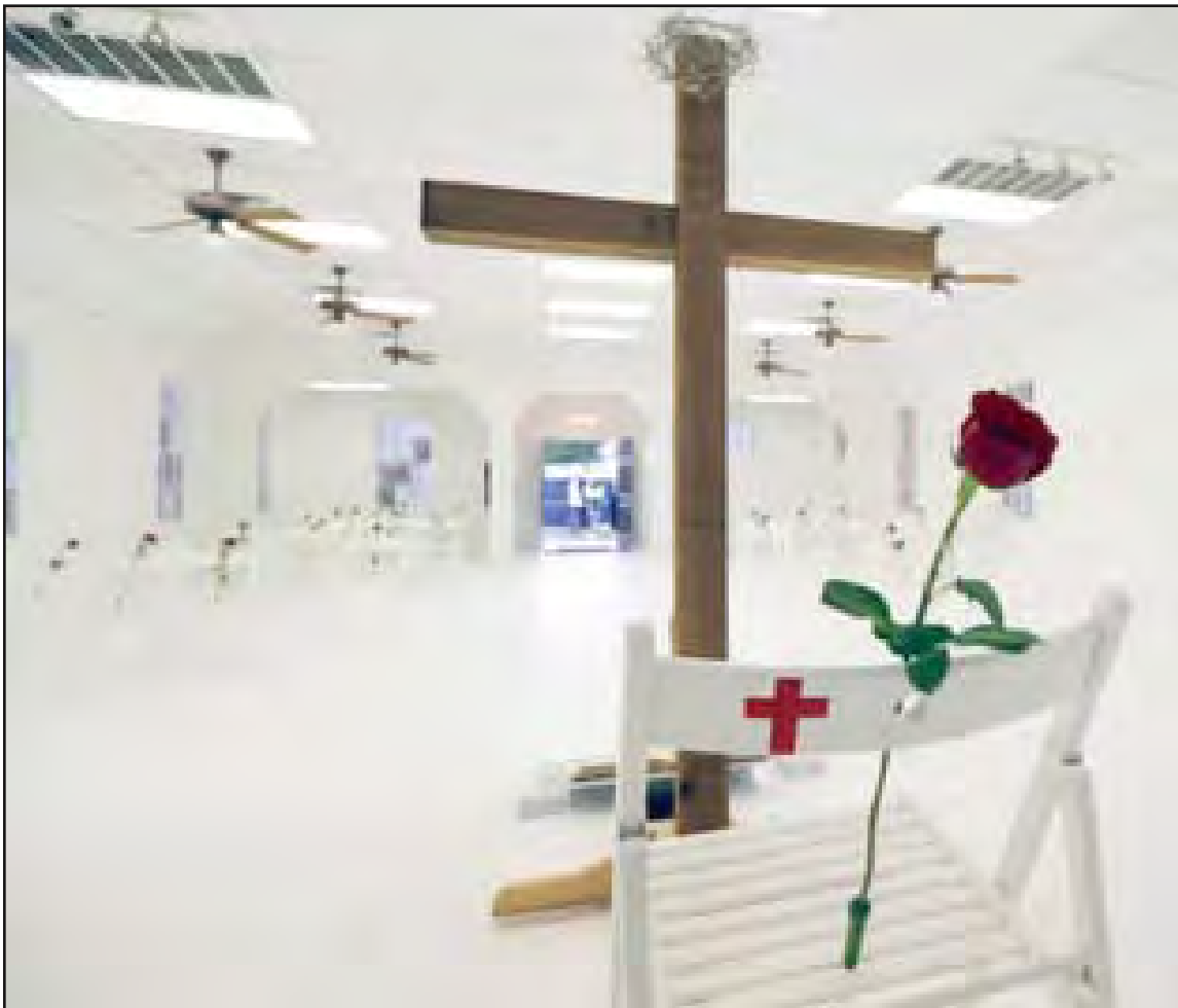
A memorial for the victims of the shooting at Sutherland Springs First Baptist Church includes 26 white chairs, each painted with a cross and a rose, is displayed in the church Sunday, Nov. 12, 2017, in Sutherland Springs, Texas. A man opened fire inside the church in the small South Texas community last week, killing more than two dozen.