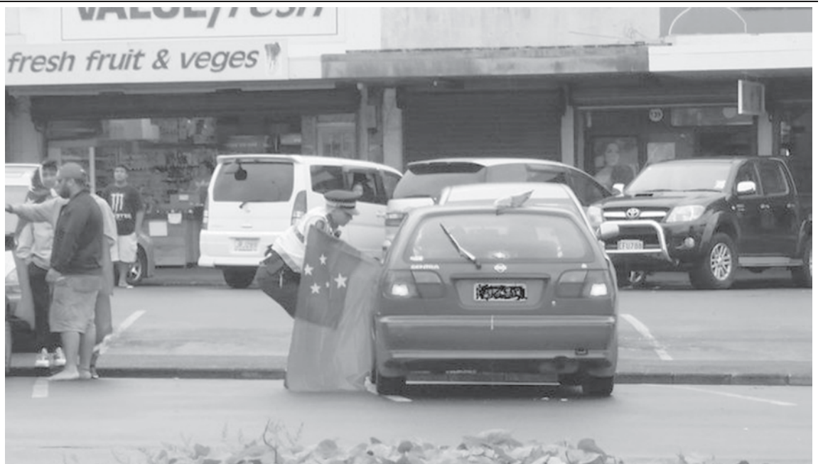
Police speaking to a Samoa supporter in Ōtara last weekend.

In a meeting last week, Turkish Prime Minister Binali Yildirim and U.S. Vice President Michael Pence discussed the cases among other sources of strain, including the U.S. backing of Syrian Kurdish militants in the war against the Islamic State group. Turkey has been infuriated by the U.S. support for a group it considers an extension of the outlawed Kurdistan Workers’ Party or PKK, which has waged an insurgency within Turkey for more than 30 years.