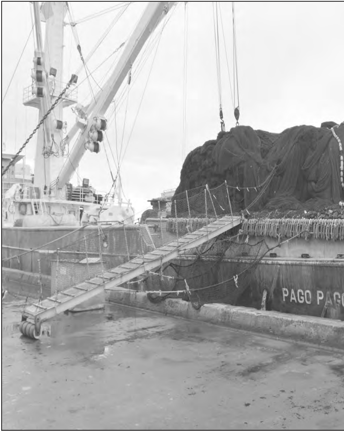
⊗ The gangway of the fishing vessel the purse seiner's captain tried to cross before he accidentally fell into the ocean and died. See story for details.