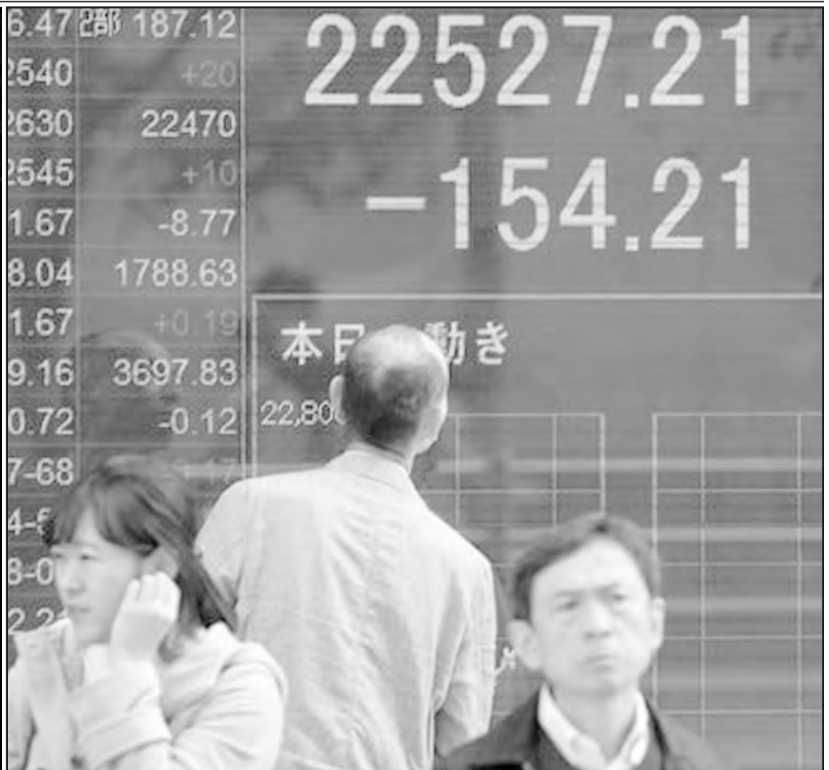
People look at an electronic stock board of a securities firm in Tokyo, Monday, Nov. 13, 2017. Asian stock markets were mixed Monday following Wall Street's losing week as investors looked ahead to a week of data releases and public comments by central bankers.

Fa'amolemole, fa'autagia mai nei fautuaga. O le a toe maua atu se isi ripoti, pe a mae'a nisi o su'esu'ega mai le Potu Su'esu'e a le AS-EPA i le vaiaso fou. O lo'o i lalo o le va'ava'aiga a le AS-EPA matafaga mo tafaaga e 44 i le motu o Tutuila, e 5 i Manua ma le uafu i Aunu'u. O fa'asalalauaga mo fautuaga mo le motu o Tutuila o lo'o avina atu i vaiaso ta'itasi, ae o Manua ma Aunu'u e fa'asalalau atu i masina ta'itasi. Mo ni fesili pe fia malamalama atili, fa'amolemole, vala'au mai i le telefoni (684) 633-2304.