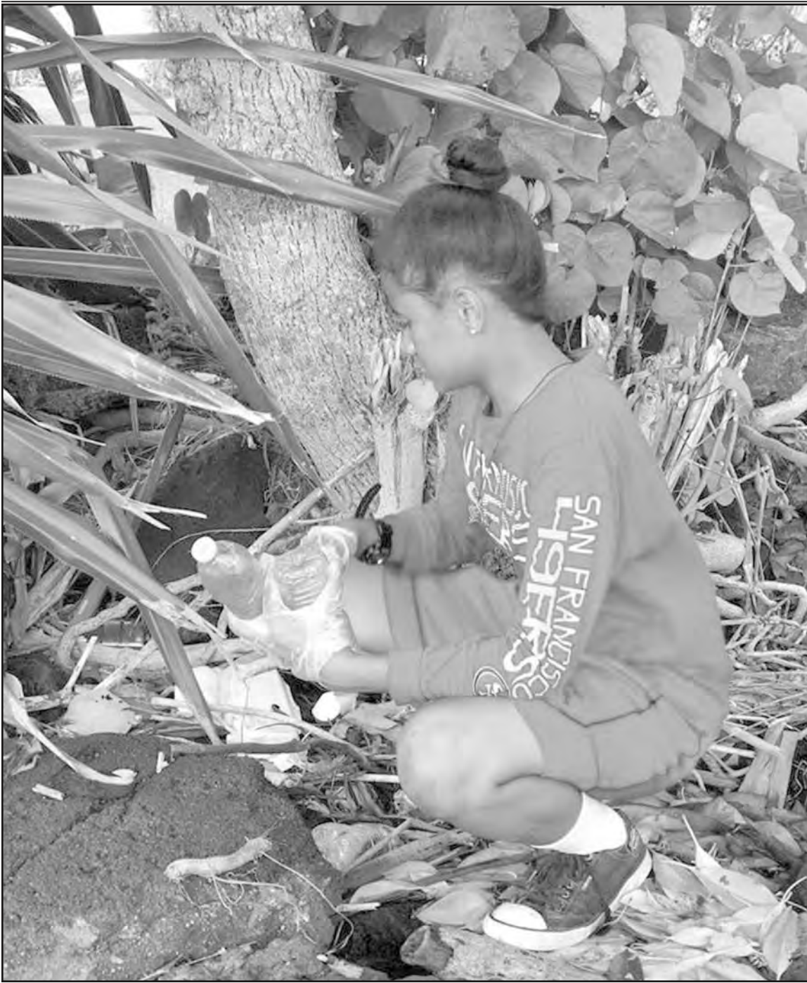
A student from the Home of the Flames picking up plastic water bottles and styrofoam plates around the Pala Lagoon area last Saturday. The private school in Malaeimi has 'adopted' the site near the Lions Park area as part of their contribution to the "Keep American Samoa Beautiful" (KASB) program, spearheaded by the AS-EPA.