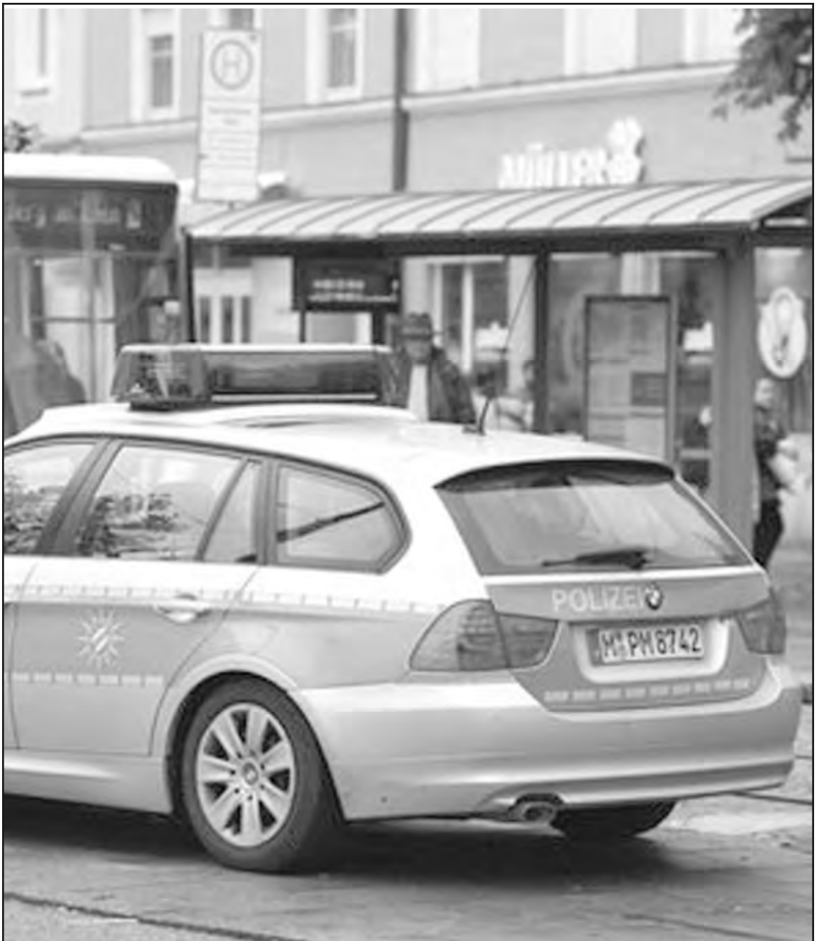
Police guard the area at Rosenheimer Platz square in Munich, Germany, Saturday, Oct. 21, 2017. Police say a man with a knife has lightly wounded several people in Munich. Officers are looking for the assailant. Munich police called on people in the Rosenheimer Platz square area, located close to the German city’s downtown, to stay inside after the incident on Saturday morning.

The Mall of America has more than 520 stores and attractions that include an amusement park and an indoor zip line.