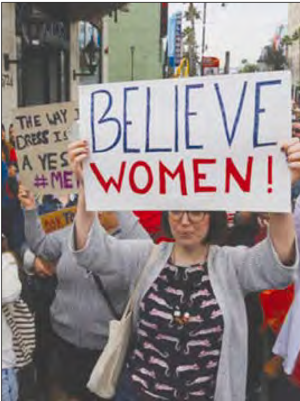
Participants march against sexual assault and harassment at the #MeToo March in the Hollywood section of Los Angeles on Sunday, Nov. 12, 2017.