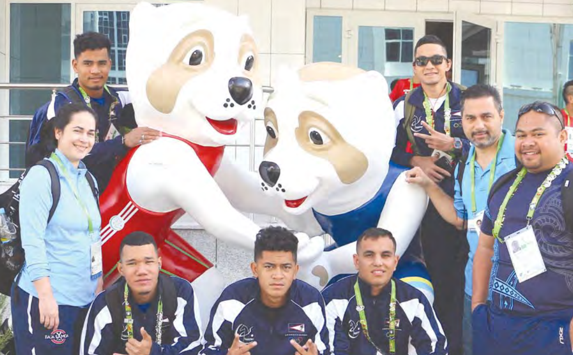
A postcard from Ashgabat, Turkmenistan, where 7 local athletes are representing American Samoa — for the first time ever — in the 5th Asian Indoor and Martial Arts Games. Samoa News extends it thanks to Carl's Jr. for sponsoring "Postcards from Ashgabat".