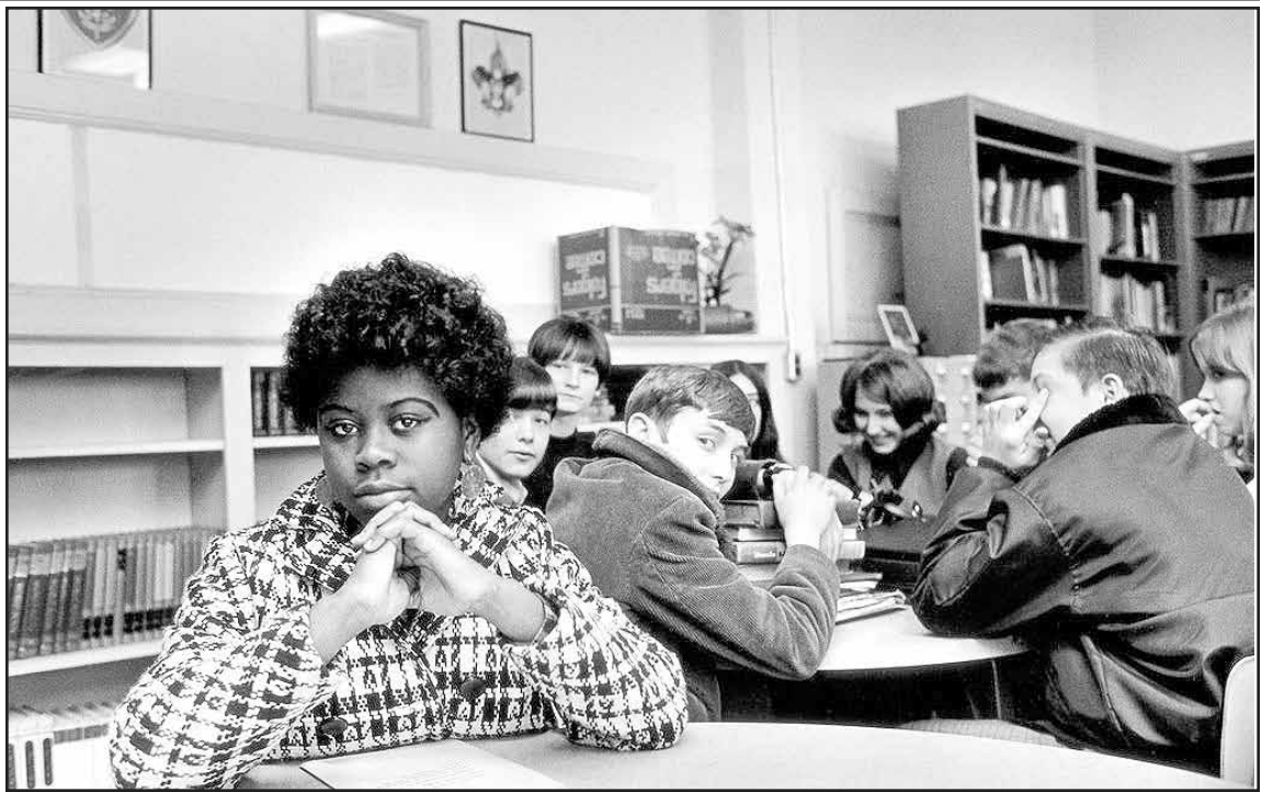
FILE - This undated file photo, location unknown, shows Linda Brown. Brown, the Kansas girl at the center of the 1954 U.S. Supreme Court ruling that struck down racial segregation in schools, has died at age 76. Peaceful Rest Funeral Chapel of Topeka confirmed that Linda Brown died Sunday, March 25, 2018.