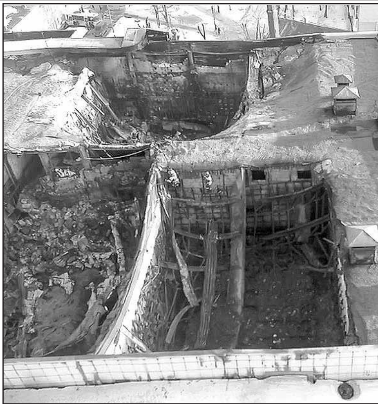
In this Russian Emergency Situations Ministry photo, taken on Monday, March 26, 2018, an aerial view of the multi-story shopping center after a fire, in the Siberian city of Kemerovo, about 3,000 kilometers (1,900 miles) east of Moscow, Russia. Russian officials say a fire at a shopping mall in a Siberian city has killed over 50 people. The Ekho Mosvki radio station quoted witnesses who said the fire alarm did not go off and that the staff in the mall in Kemerovo did not organize the evacuation.