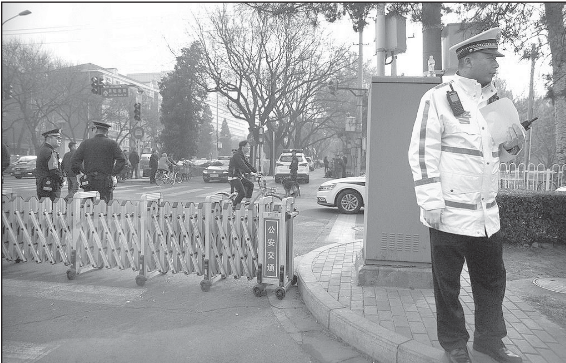
Chinese policemen stand guard at a road barricade in front of the Diaoyutai State Guesthouse in Beijing, Tuesday, March 27, 2018. Unusually heavy security at a Beijing guesthouse where prominent North Koreans have stayed in the past and media reports of a special train arriving have raised speculation that Kim Jong Un is making his first trip to China as the North's leader.